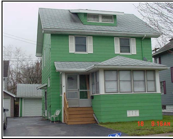
4 Union St 180200 84.031-1-37

Neighborhood: 300 Property Class: 210 - 1 Family Res Sale Date: 8/12/2023 Sale Price: $ 93,500 Prelim 2024 Land Asmt: $ 12,000 Prelim 2024 Asmt: $ 116,000 Building Style: Old Style Exterior Wall: Wood Year Built: 1880 Basement Type: Partial Grade: Average Condition: Fair SFLA: 1,248 Sale Price/SFLA: $ 74.92 Number Bedrooms: 3 Number Baths: 1.5