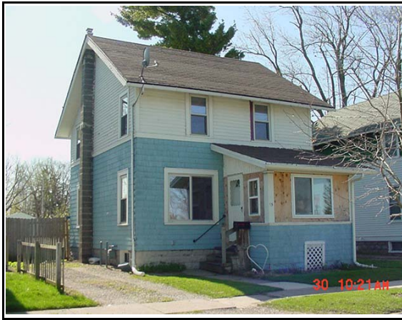
15 South Lyon St 180200 84.039-1-20

Neighborhood: 500 Property Class: 210 - 1 Family Res Sale Date: 7/24/2023 Sale Price: $ 119,000 Prelim 2024 Land Asmt: $ 8,500 Prelim 2024 Asmt: $ 119,000 Building Style: Old Style Exterior Wall: Alum/vinyl Year Built: 1920 Basement Type: Full Grade: Average Condition: Normal SFLA: 1,144 Sale Price/SFLA: $ 104.02 Number Bedrooms: 3 Number Baths: 1.0