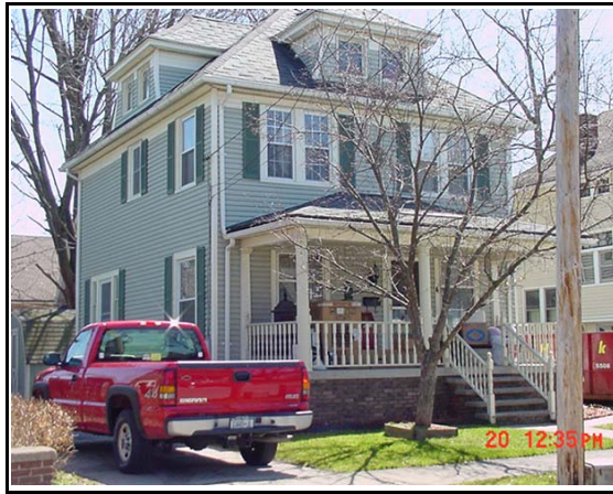
4 Lewis Ave 180200 84.033-1-17

Neighborhood: 200 Property Class: 210 - 1 Family Res Sale Date: 7/21/2023 Sale Price: $ 227,000 Prelim 2024 Land Asmt: $ 13,900 Prelim 2024 Asmt: $ 227,000 Building Style: Old Style Exterior Wall: Wood Year Built: 1925 Basement Type: Full Grade: Average Condition: Normal SFLA: 1,327 Sale Price/SFLA: $ 171.06 Number Bedrooms: 3 Number Baths: 1.5