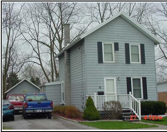
32 Buell St 180200 84.084-1-45

Neighborhood: 600 Property Class: 210 - 1 Family Res Sale Date: 7/21/2022 Sale Price: $ 159,793 Prelim 2024 Land Asmt: $ 15,100 Prelim 2024 Asmt: $ 167,000 Building Style: Old Style Exterior Wall: Composition Year Built: 1900 Basement Type: Partial Grade: Average Condition: Normal SFLA: 1,152 Sale Price/SFLA: $ 138.71 Number Bedrooms: 3 Number Baths: 1.0