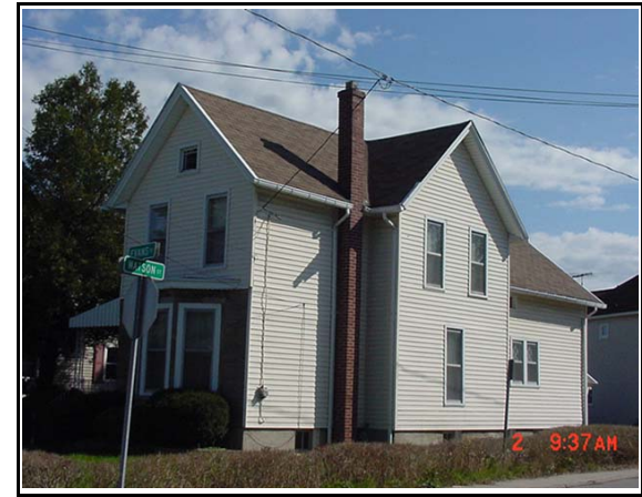
105 Evans St 180200 84.057-1-2

Neighborhood: 500 Property Class: 210 - 1 Family Res Sale Date: 8/12/2022 Sale Price: $ 99,900 Prelim 2024 Land Asmt: $ 9,900 Prelim 2024 Asmt: $ 105,000 Building Style: Old Style Exterior Wall: Wood Year Built: 1925 Basement Type: Full Grade: Average Condition: Normal SFLA: 1,338 Sale Price/SFLA: $ 74.66 Number Bedrooms: 2 Number Baths: 2.0