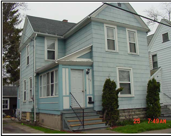
109 Ellsworth Ave 180200 84.043-1-64

Neighborhood: 300 Property Class: 210 - 1 Family Res Sale Date: 12/6/2022 Sale Price: $ 77,000 Prelim 2024 Land Asmt: $ 5,800 Prelim 2024 Asmt: $ 86,000 Building Style: Old Style Exterior Wall: Composition Year Built: 1890 Basement Type: Full Grade: Average Condition: Fair SFLA: 1,336 Sale Price/SFLA: $ 57.63 Number Bedrooms: 3 Number Baths: 1.5