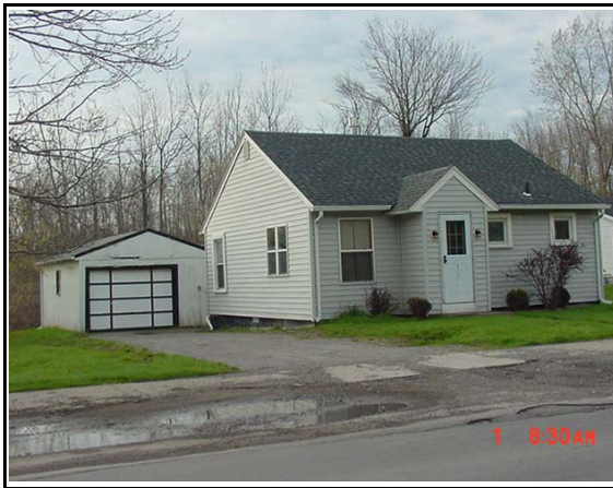
117 Walnut St 180200 84.014-2-27

Neighborhood: 500 Property Class: 210 - 1 Family Res Sale Date: 11/1/2023 Sale Price: $ 54,000 Prelim 2024 Land Asmt: $ 12,600 Prelim 2024 Asmt: $ 85,000 Building Style: Ranch Exterior Wall: Alum/vinyl Year Built: 1950 Basement Type: Crawl Grade: Economy Condition: Poor SFLA: 720 Sale Price/SFLA: $ 75.00 Number Bedrooms: 2 Number Baths: 1.0