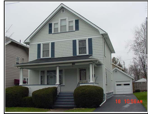
41 Kingsbury Ave 180200 84.023-1-21

Neighborhood: 200 Property Class: 210 - 1 Family Res Sale Date: 8/1/2022 Sale Price: $ 139,900 Prelim 2024 Land Asmt: $ 13,600 Prelim 2024 Asmt: $ 147,000 Building Style: Old Style Exterior Wall: Alum/vinyl Year Built: 1929 Basement Type: Full Grade: Average Condition: Normal SFLA: 1,396 Sale Price/SFLA: $ 100.21 Number Bedrooms: 3 Number Baths: 1.0