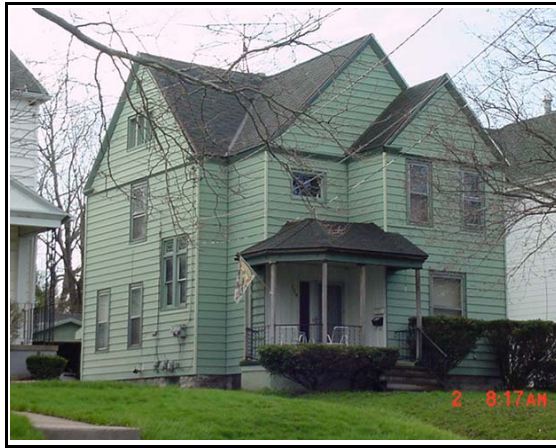
129 Jackson St 180200 84.065-2-53

Neighborhood: 500 Property Class: 210 - 1 Family Res Sale Date: 10/27/2023 Sale Price: $ 155,000 Prelim 2024 Land Asmt: $ 19,300 Prelim 2024 Asmt: $ 154,000 Building Style: Old Style Exterior Wall: Alum/vinyl Year Built: 1912 Basement Type: Full Grade: Average Condition: Normal SFLA: 1,920 Sale Price/SFLA: $ 80.73 Number Bedrooms: 4 Number Baths: 1.5