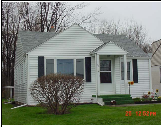
191 Vine St 180200 84.008-1-24

Neighborhood: 200 Property Class: 210 - 1 Family Res Sale Date: 5/20/2022 Sale Price: $ 128,000 Prelim 2024 Land Asmt: $ 14,000 Prelim 2024 Asmt: $ 129,000 Building Style: Ranch Exterior Wall: Alum/vinyl Year Built: 1944 Basement Type: Full Grade: Average Condition: Normal SFLA: 846 Sale Price/SFLA: $ 151.30 Number Bedrooms: 2 Number Baths: 1.0