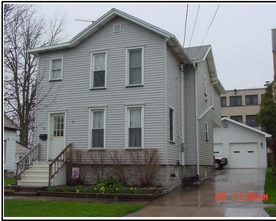
10 East Ave 180200 84.043-3-9

Neighborhood: 700 Property Class: 210 - 1 Family Res Sale Date: 11/8/2022 Sale Price: $ 165,300 Prelim 2024 Land Asmt: $ 13,800 Prelim 2024 Asmt: $ 165,000 Building Style: Old Style Exterior Wall: Alum/vinyl Year Built: 1890 Basement Type: Full Grade: Average Condition: Normal SFLA: 1,732 Sale Price/SFLA: $ 95.44 Number Bedrooms: 4 Number Baths: 2.0