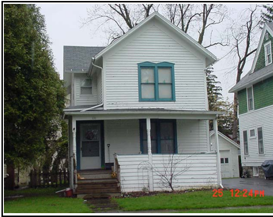
108 North St 180200 84.034-1-5

Neighborhood: 300 Property Class: 210 - 1 Family Res Sale Date: 5/26/2023 Sale Price: $ 150,000 Prelim 2024 Land Asmt: $ 8,600 Prelim 2024 Asmt: $ 156,000 Building Style: Old Style Exterior Wall: Alum/vinyl Year Built: 1900 Basement Type: Full Grade: Average Condition: Normal SFLA: 1,362 Sale Price/SFLA: $ 110.13 Number Bedrooms: 4 Number Baths: 1.0