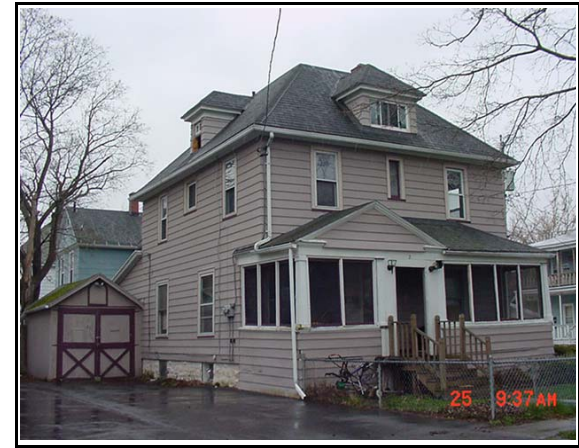
2 Manhattan Ave 180200 84.043-1-65

Neighborhood: 300 Property Class: 210 - 1 Family Res Sale Date: 1/21/2022 Sale Price: $ 150,000 Prelim 2024 Land Asmt: $ 9,500 Prelim 2024 Asmt: $ 168,000 Building Style: Old Style Exterior Wall: Wood Year Built: 1900 Basement Type: Full Grade: Average Condition: Normal SFLA: 1,649 Sale Price/SFLA: $ 90.96 Number Bedrooms: 4 Number Baths: 1.0