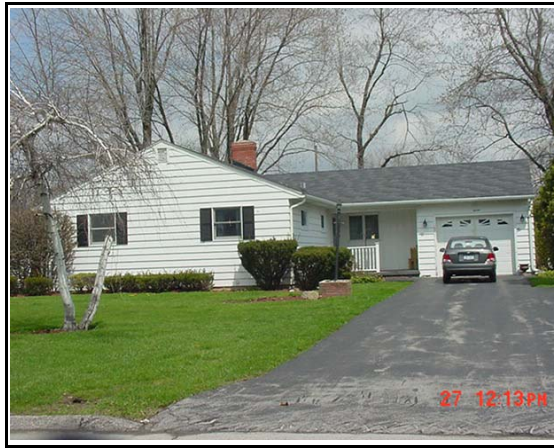
7 Fordham Dr 180200 84.012-3-27

Neighborhood: 200 Property Class: 210 - 1 Family Res Sale Date: 5/10/2022 Sale Price: $ 248,800 Prelim 2024 Land Asmt: $ 17,000 Prelim 2024 Asmt: $ 262,000 Building Style: Ranch Exterior Wall: Alum/vinyl Year Built: 1956 Basement Type: Full Grade: Average Condition: Normal SFLA: 1,534 Sale Price/SFLA: $ 162.19 Number Bedrooms: 2 Number Baths: 1.5