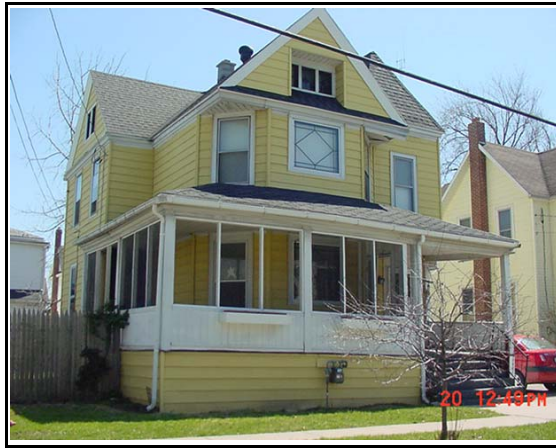
10 Dellinger Ave 180200 84.040-2-59

Neighborhood: 300 Property Class: 210 - 1 Family Res Sale Date: 11/13/2023 Sale Price: $ 160,000 Prelim 2024 Land Asmt: $ 10,000 Prelim 2024 Asmt: $ 165,000 Building Style: Old Style Exterior Wall: Alum/vinyl Year Built: 1925 Basement Type: Full Grade: Average Condition: Normal SFLA: 1,798 Sale Price/SFLA: $ 88.99 Number Bedrooms: 6 Number Baths: 1.0