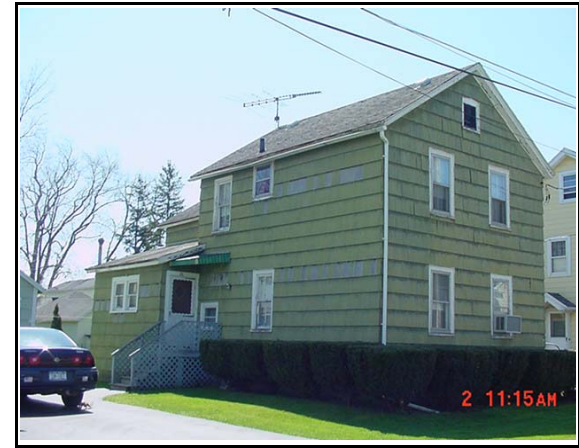
26 Warren St 180200 84.073-2-35

Neighborhood: 500 Property Class: 210 - 1 Family Res Sale Date: 9/26/2022 Sale Price: $ 120,000 Prelim 2024 Land Asmt: $ 19,100 Prelim 2024 Asmt: $ 138,000 Building Style: Old Style Exterior Wall: Alum/vinyl Year Built: 1900 Basement Type: Partial Grade: Average Condition: Normal SFLA: 1,080 Sale Price/SFLA: $ 111.11 Number Bedrooms: 3 Number Baths: 1.0