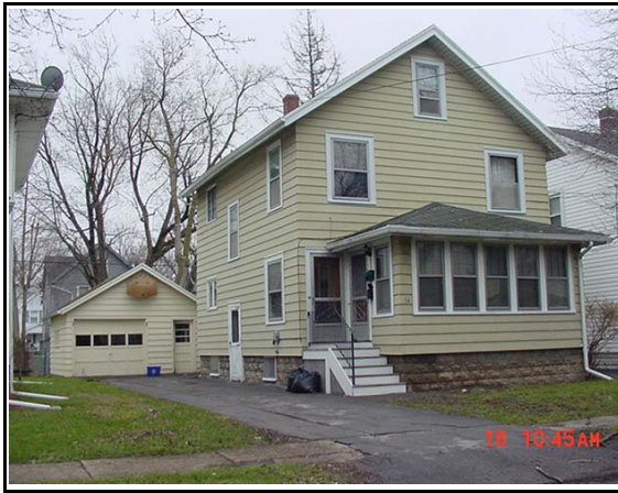
16 Kingsbury Ave 180200 84.031-1-26

Neighborhood: 200 Property Class: 220 - 2 Family Res Sale Date: 11/17/2022 Sale Price: $ 130,000 Prelim 2024 Land Asmt: $ 11,000 Prelim 2024 Asmt: $ 113,000 Building Style: Old Style Exterior Wall: Alum/vinyl Year Built: 1910 Basement Type: Partial Grade: Average Condition: Fair SFLA: 1,748 Sale Price/SFLA: $ 74.37 Number Bedrooms: 3 Number Baths: 2.0