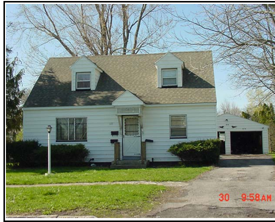
177 South Main St 180200 84.009-2-10

Neighborhood: 500 Property Class: 210 - 1 Family Res Sale Date: 10/4/2022 Sale Price: $ 95,462 Prelim 2024 Land Asmt: $ 13,000 Prelim 2024 Asmt: $ 107,000 Building Style: Cape Cod Exterior Wall: Alum/vinyl Year Built: 1947 Basement Type: Full Grade: Average Condition: Fair SFLA: 1,214 Sale Price/SFLA: $ 78.63 Number Bedrooms: 3 Number Baths: 1.0