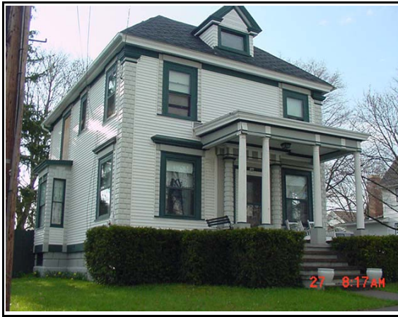
22 Trumbull Pkwy 180200 84.051-2-36

Neighborhood: 700 Property Class: 210 - 1 Family Res Sale Date: 4/14/2022 Sale Price: $ 100,000 Prelim 2024 Land Asmt: $ 23,900 Prelim 2024 Asmt: $ 113,000 Building Style: Old Style Exterior Wall: Wood Year Built: 1909 Basement Type: Full Grade: Average Condition: Normal SFLA: 1,512 Sale Price/SFLA: $ 66.14 Number Bedrooms: 4 Number Baths: 1.5