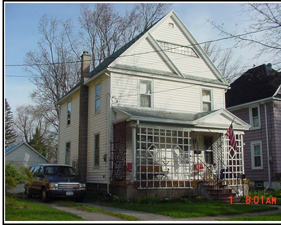
32 Franklin St 180200 84.055-1-24

Neighborhood: 500 Property Class: 210 - 1 Family Res Sale Date: 7/14/2022 Sale Price: $ 144,000 Prelim 2024 Land Asmt: $ 29,800 Prelim 2024 Asmt: $ 153,000 Building Style: Old Style Exterior Wall: Composition Year Built: 1900 Basement Type: Full Grade: Average Condition: Normal SFLA: 1,208 Sale Price/SFLA: $ 119.21 Number Bedrooms: 2 Number Baths: 2.0