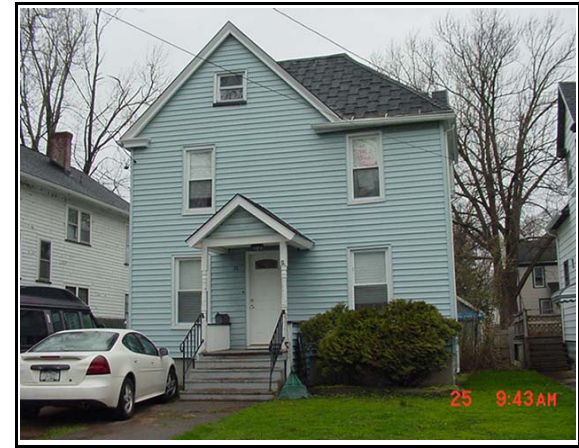
35 Manhattan Ave 180200 84.035-1-56

Neighborhood: 300 Property Class: 210 - 1 Family Res Sale Date: 2/4/2022 Sale Price: $ 124,800 Prelim 2024 Land Asmt: $ 16,800 Prelim 2024 Asmt: $ 125,000 Building Style: Old Style Exterior Wall: Alum/vinyl Year Built: 1900 Basement Type: Full Grade: Average Condition: Normal SFLA: 1,504 Sale Price/SFLA: $ 82.98 Number Bedrooms: 4 Number Baths: 1.0