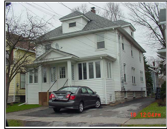
36 Lyon St 180200 84.031-2-38

Neighborhood: 300 Property Class: 210 - 1 Family Res Sale Date: 11/4/2022 Sale Price: $ 206,960 Prelim 2024 Land Asmt: $ 13,500 Prelim 2024 Asmt: $ 215,000 Building Style: Old Style Exterior Wall: Alum/vinyl Year Built: 1900 Basement Type: Full Grade: Average Condition: Normal SFLA: 2,227 Sale Price/SFLA: $ 92.93 Number Bedrooms: 4 Number Baths: 2.0