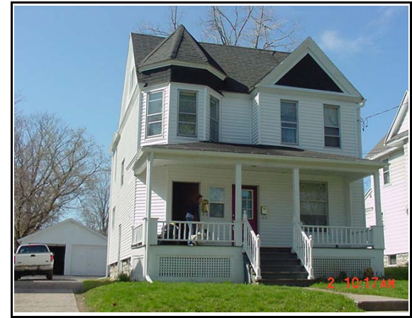
12 Highland Park 180200 84.065-2-7

Neighborhood: 500 Property Class: 220 - 2 Family Res Sale Date: 5/24/2023 Sale Price: $ 109,900 Prelim 2024 Land Asmt: $ 15,400 Prelim 2024 Asmt: $ 110,000 Building Style: Old Style Exterior Wall: Alum/vinyl Year Built: 1900 Basement Type: Full Grade: Average Condition: Fair SFLA: 1,936 Sale Price/SFLA: $ 56.77 Number Bedrooms: 3 Number Baths: 2.0