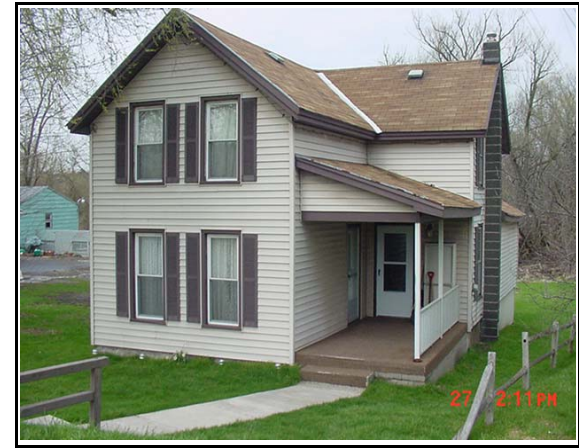
697 East Main St 180200 85.013-1-27

Neighborhood: 600 Property Class: 210 - 1 Family Res Sale Date: 8/1/2022 Sale Price: $ 130,000 Prelim 2024 Land Asmt: $ 7,400 Prelim 2024 Asmt: $ 120,000 Building Style: Old Style Exterior Wall: Alum/vinyl Year Built: 1900 Basement Type: Full Grade: Average Condition: Normal SFLA: 1,318 Sale Price/SFLA: $ 98.63 Number Bedrooms: 3 Number Baths: 1.0