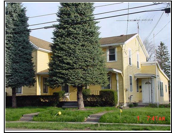
34 Pearl St 180200 84.047-2-46

Neighborhood: 500 Property Class: 220 - 2 Family Res Sale Date: 11/29/2022 Sale Price: $ 135,000 Prelim 2024 Land Asmt: $ 19,400 Prelim 2024 Asmt: $ 142,000 Building Style: Old Style Exterior Wall: Alum/vinyl Year Built: 1900 Basement Type: Full Grade: Average Condition: Fair SFLA: 2,376 Sale Price/SFLA: $ 56.82 Number Bedrooms: 4 Number Baths: 2.0