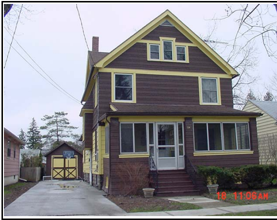
54 Vernon Ave 180200 84.006-3-71

Neighborhood: 200 Property Class: 210 - 1 Family Res Sale Date: 9/12/2023 Sale Price: $ 215,000 Prelim 2024 Land Asmt: $ 16,200 Prelim 2024 Asmt: $ 213,000 Building Style: Old Style Exterior Wall: Wood Year Built: 1915 Basement Type: Full Grade: Average Condition: Good SFLA: 1,575 Sale Price/SFLA: $ 136.51 Number Bedrooms: 4 Number Baths: 2.5