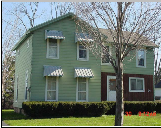
74 South Main St 180200 84.010-2-12

Neighborhood: 500 Property Class: 220 - 2 Family Res Sale Date: 7/25/2022 Sale Price: $ 79,000 Prelim 2024 Land Asmt: $ 17,800 Prelim 2024 Asmt: $ 94,000 Building Style: Old Style Exterior Wall: Alum/vinyl Year Built: 1880 Basement Type: Partial Grade: Economy Condition: Poor SFLA: 1,648 Sale Price/SFLA: $ 47.94 Number Bedrooms: 3 Number Baths: 2.0