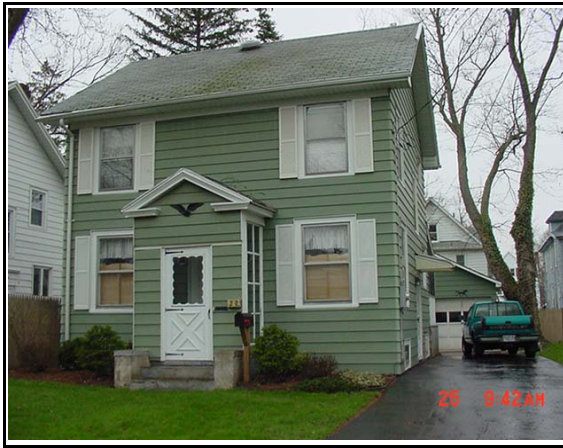
29 Manhattan Ave 180200 84.035-1-58

Neighborhood: 300 Property Class: 210 - 1 Family Res Sale Date: 4/1/2022 Sale Price: $ 150,000 Prelim 2024 Land Asmt: $ 13,100 Prelim 2024 Asmt: $ 157,000 Building Style: Old Style Exterior Wall: Alum/vinyl Year Built: 1920 Basement Type: Full Grade: Average Condition: Normal SFLA: 1,282 Sale Price/SFLA: $ 117.00 Number Bedrooms: 3 Number Baths: 1.0