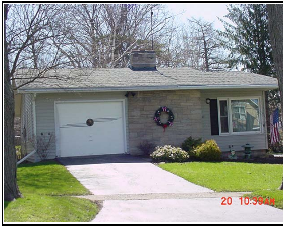
40 Prospect Ave 180200 84.006-4-61

Neighborhood: 200 Property Class: 210 - 1 Family Res Sale Date: 3/31/2022 Sale Price: $ 152,100 Prelim 2024 Land Asmt: $ 17,000 Prelim 2024 Asmt: $ 177,000 Building Style: Ranch Exterior Wall: Alum/vinyl Year Built: 1953 Basement Type: Full Grade: Average Condition: Normal SFLA: 1,247 Sale Price/SFLA: $ 121.97 Number Bedrooms: 3 Number Baths: 1.0