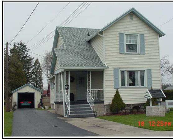
67 Lyon St 180200 84.006-2-62

Neighborhood: 300 Property Class: 210 - 1 Family Res Sale Date: 6/2/2022 Sale Price: $ 65,000 Prelim 2024 Land Asmt: $ 6,600 Prelim 2024 Asmt: $ 77,000 Building Style: Old Style Exterior Wall: Composition Year Built: 1910 Basement Type: Partial Grade: Average Condition: Normal SFLA: 1,254 Sale Price/SFLA: $ 51.83 Number Bedrooms: 2 Number Baths: 1.5