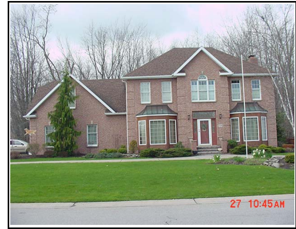
398 Garden Dr 180200 85.005-1-78

Neighborhood: 100 Property Class: 210 - 1 Family Res Sale Date: 9/14/2022 Sale Price: $ 375,000 Prelim 2024 Land Asmt: $ 37,000 Prelim 2024 Asmt: $ 416,000 Building Style: Colonial Exterior Wall: Stucco Year Built: 1989 Basement Type: Full Grade: Good Condition: Normal SFLA: 3,192 Sale Price/SFLA: $ 117.48 Number Bedrooms: 4 Number Baths: 3.0