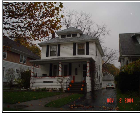
148 Summit St 180200 84.034-2-26

Neighborhood: 300 Property Class: 220 - 2 Family Res Sale Date: 7/14/2022 Sale Price: $ 90,000 Prelim 2024 Land Asmt: $ 8,800 Prelim 2024 Asmt: $ 118,000 Building Style: Old Style Exterior Wall: Alum/vinyl Year Built: 1920 Basement Type: Full Grade: Average Condition: Fair SFLA: 1,344 Sale Price/SFLA: $ 66.96 Number Bedrooms: 2 Number Baths: 2.0