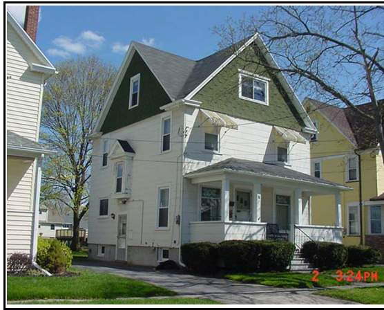
23 Otis St 180200 84.020-2-78

Neighborhood: 500 Property Class: 210 - 1 Family Res Sale Date: 8/15/2022 Sale Price: $ 105,000 Prelim 2024 Land Asmt: $ 13,200 Prelim 2024 Asmt: $ 108,000 Building Style: Old Style Exterior Wall: Alum/vinyl Year Built: 1935 Basement Type: Crawl Grade: Average Condition: Fair SFLA: 1,408 Sale Price/SFLA: $ 74.57 Number Bedrooms: 4 Number Baths: 1.0