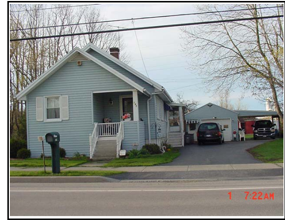
143 Pearl St 180200 84.013-1-17

Neighborhood: 500 Property Class: 210 - 1 Family Res Sale Date: 11/21/2023 Sale Price: $ 20,000 Prelim 2024 Land Asmt: $ 7,900 Prelim 2024 Asmt: $ 42,000 Building Style: Old Style Exterior Wall: Alum/vinyl Year Built: 1920 Basement Type: Crawl Grade: Economy Condition: Poor SFLA: 862 Sale Price/SFLA: $ 23.20 Number Bedrooms: 2 Number Baths: 2.0