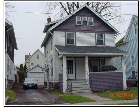
20 Lyon St 180200 84.031-2-31

Neighborhood: 300 Property Class: 210 - 1 Family Res Sale Date: 10/23/2023 Sale Price: $ 165,000 Prelim 2024 Land Asmt: $ 9,000 Prelim 2024 Asmt: $ 165,000 Building Style: Old Style Exterior Wall: Alum/vinyl Year Built: 1930 Basement Type: Full Grade: Average Condition: Normal SFLA: 1,276 Sale Price/SFLA: $ 129.31 Number Bedrooms: 3 Number Baths: 1.5