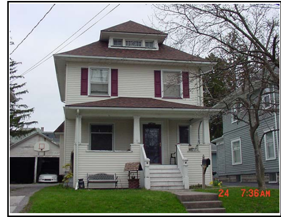
5 Norris Ave 180200 84.025-1-12

Neighborhood: 200 Property Class: 210 - 1 Family Res Sale Date: 4/18/2022 Sale Price: $ 110,000 Prelim 2024 Land Asmt: $ 11,000 Prelim 2024 Asmt: $ 139,000 Building Style: Old Style Exterior Wall: Wood Year Built: 1911 Basement Type: Partial Grade: Average Condition: Normal SFLA: 1,490 Sale Price/SFLA: $ 73.83 Number Bedrooms: 3 Number Baths: 1.0