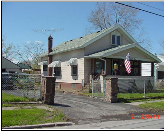
252 Swan St 180200 84.019-3-37

Neighborhood: 500 Property Class: 210 - 1 Family Res Sale Date: 4/18/2023 Sale Price: $ 123,800 Prelim 2024 Land Asmt: $ 24,200 Prelim 2024 Asmt: $ 126,000 Building Style: Old Style Exterior Wall: Wood Year Built: 1910 Basement Type: Full Grade: Average Condition: Fair SFLA: 1,235 Sale Price/SFLA: $ 100.24 Number Bedrooms: 2 Number Baths: 1.0