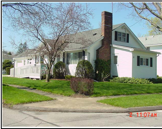
12 Cone St 180200 84.073-1-29

Neighborhood: 500 Property Class: 210 - 1 Family Res Sale Date: 12/8/2022 Sale Price: $ 251,500 Prelim 2024 Land Asmt: $ 13,600 Prelim 2024 Asmt: $ 268,000 Building Style: Ranch Exterior Wall: Wood Year Built: 1949 Basement Type: Full Grade: Average Condition: Normal SFLA: 1,622 Sale Price/SFLA: $ 155.06 Number Bedrooms: 3 Number Baths: 1.5