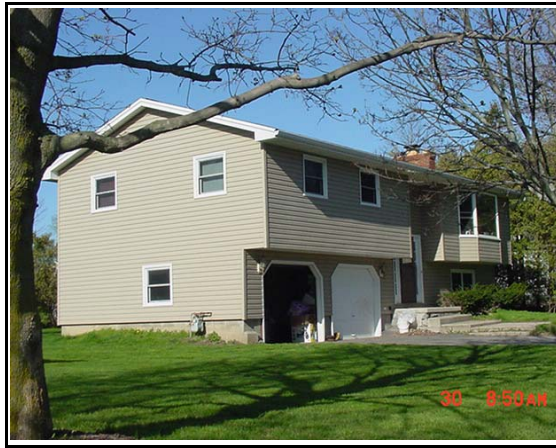
221 South Main St 180200 84.009-1-2

Neighborhood: 500 Property Class: 210 - 1 Family Res Sale Date: 12/8/2022 Sale Price: $ 251,500 Prelim 2024 Land Asmt: $ 13,600 Prelim 2024 Asmt: $ 268,000 Building Style: Ranch Exterior Wall: Wood Year Built: 1949 Basement Type: Full Grade: Average Condition: Normal SFLA: 1,622 Sale Price/SFLA: $ 155.06 Number Bedrooms: 3 Number Baths: 1.5