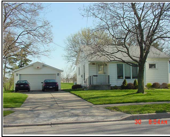
204 South Main St 180200 84.005-2-57

Neighborhood: 500 Property Class: 210 - 1 Family Res Sale Date: 1/23/2023 Sale Price: $ 149,000 Prelim 2024 Land Asmt: $ 14,400 Prelim 2024 Asmt: $ 153,000 Building Style: Ranch Exterior Wall: Alum/vinyl Year Built: 1960 Basement Type: Full Grade: Average Condition: Normal SFLA: 1,212 Sale Price/SFLA: $ 122.94 Number Bedrooms: 3 Number Baths: 1.0