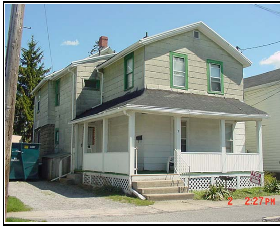
7 Hutchins St 180200 84.066-2-44.1

Neighborhood: 500 Property Class: 210 - 1 Family Res Sale Date: 5/2/2022 Sale Price: $ 147,300 Prelim 2024 Land Asmt: $ 12,100 Prelim 2024 Asmt: $ 156,000 Building Style: Old Style Exterior Wall: Concrete Year Built: 1912 Basement Type: Full Grade: Average Condition: Normal SFLA: 1,735 Sale Price/SFLA: $ 84.90 Number Bedrooms: 4 Number Baths: 1.0