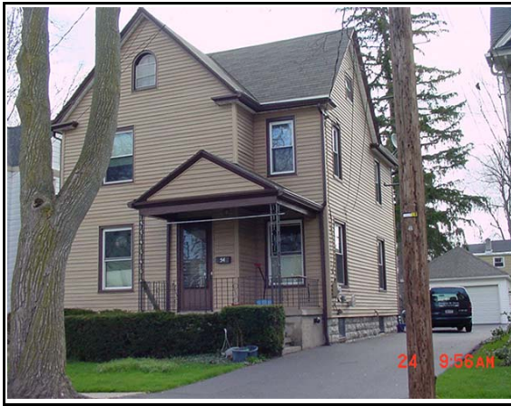
54 Tracy Ave 180200 84.034-1-45

Neighborhood: 300 Property Class: 210 - 1 Family Res Sale Date: 8/11/2022 Sale Price: $ 150,000 Prelim 2024 Land Asmt: $ 10,600 Prelim 2024 Asmt: $ 169,000 Building Style: Old Style Exterior Wall: Alum/vinyl Year Built: 1900 Basement Type: Full Grade: Average Condition: Normal SFLA: 1,488 Sale Price/SFLA: $ 100.81 Number Bedrooms: 4 Number Baths: 1.0