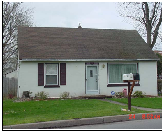
288 Bank St 180200 71.083-1-1

Neighborhood: 200 Property Class: 210 - 1 Family Res Sale Date: 11/7/2022 Sale Price: $ 198,500 Prelim 2024 Land Asmt: $ 23,000 Prelim 2024 Asmt: $ 213,000 Building Style: Cape Cod Exterior Wall: Alum/vinyl Year Built: 1954 Basement Type: Full Grade: Average Condition: Normal SFLA: 1,424 Sale Price/SFLA: $ 139.40 Number Bedrooms: 3 Number Baths: 1.5