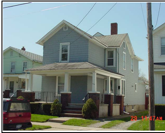
416 Ellicott St 180200 84.074-2-8

Neighborhood: 600 Property Class: 220 - 2 Family Res Sale Date: 6/28/2023 Sale Price: $ 122,000 Prelim 2024 Land Asmt: $ 17,400 Prelim 2024 Asmt: $ 126,000 Building Style: Old Style Exterior Wall: Alum/vinyl Year Built: 1880 Basement Type: Full Grade: Average Condition: Fair SFLA: 1,506 Sale Price/SFLA: $ 81.01 Number Bedrooms: 2 Number Baths: 2.0