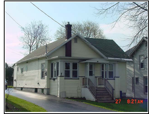
10 Trumbull Pkwy 180200 84.012-3-62

Neighborhood: 700 Property Class: 210 - 1 Family Res Sale Date: 7/20/2022 Sale Price: $ 125,000 Prelim 2024 Land Asmt: $ 16,800 Prelim 2024 Asmt: $ 103,000 Building Style: Old Style Exterior Wall: Wood Year Built: 1940 Basement Type: Full Grade: Average Condition: Normal SFLA: 842 Sale Price/SFLA: $ 148.46 Number Bedrooms: 1 Number Baths: 1.0