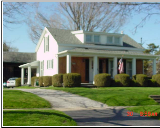
187 South Main St 180200 84.009-2-7

Neighborhood: 500 Property Class: 210 - 1 Family Res Sale Date: 10/11/2022 Sale Price: $ 115,000 Prelim 2024 Land Asmt: $ 11,400 Prelim 2024 Asmt: $ 133,000 Building Style: Old Style Exterior Wall: Alum/vinyl Year Built: 1925 Basement Type: Full Grade: Average Condition: Good SFLA: 1,056 Sale Price/SFLA: $ 108.90 Number Bedrooms: 2 Number Baths: 1.0