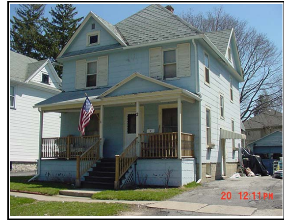
2 Lincoln Ave 180200 84.032-2-22

Neighborhood: 200 Property Class: 210 - 1 Family Res Sale Date: 4/25/2022 Sale Price: $ 170,000 Prelim 2024 Land Asmt: $ 13,300 Prelim 2024 Asmt: $ 133,000 Building Style: Old Style Exterior Wall: Wood Year Built: 1910 Basement Type: Full Grade: Average Condition: Normal SFLA: 1,344 Sale Price/SFLA: $ 126.49 Number Bedrooms: 3 Number Baths: 2.0