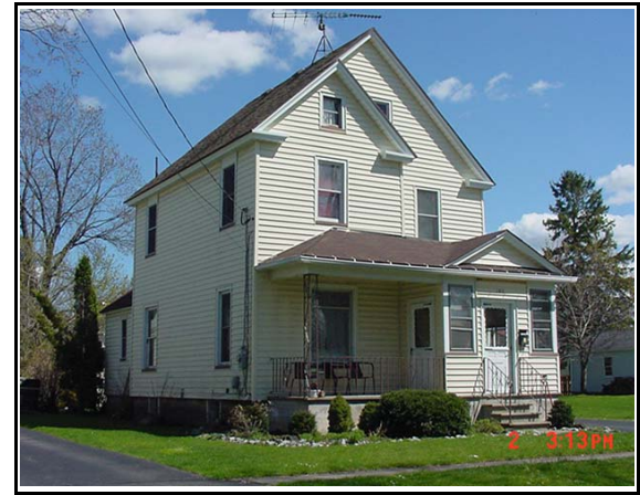
108 Osterhout Ave 180200 84.082-2-32

Neighborhood: 500 Property Class: 210 - 1 Family Res Sale Date: 5/12/2022 Sale Price: $ 159,000 Prelim 2024 Land Asmt: $ 13,100 Prelim 2024 Asmt: $ 156,000 Building Style: Old Style Exterior Wall: Alum/vinyl Year Built: 1880 Basement Type: Full Grade: Average Condition: Fair SFLA: 1,388 Sale Price/SFLA: $ 114.55 Number Bedrooms: 3 Number Baths: 2.0