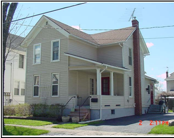
206 Swan St 180200 84.082-1-5

Neighborhood: 500 Property Class: 210 - 1 Family Res Sale Date: 1/19/2022 Sale Price: $ 87,000 Prelim 2024 Land Asmt: $ 11,700 Prelim 2024 Asmt: $ 102,000 Building Style: Old Style Exterior Wall: Alum/vinyl Year Built: 1885 Basement Type: Full Grade: Average Condition: Normal SFLA: 1,336 Sale Price/SFLA: $ 65.12 Number Bedrooms: 3 Number Baths: 1.5