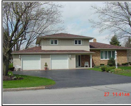
15 Naramore Dr 180200 84.008-2-4

Neighborhood: 100 Property Class: 210 - 1 Family Res Sale Date: 3/3/2023 Sale Price: $ 220,000 Prelim 2024 Land Asmt: $ 29,700 Prelim 2024 Asmt: $ 235,000 Building Style: R. Ranch Exterior Wall: Alum/vinyl Year Built: 1968 Basement Type: Full Grade: Average Condition: Normal SFLA: 1,911 Sale Price/SFLA: $ 115.12 Number Bedrooms: 4 Number Baths: 2.0