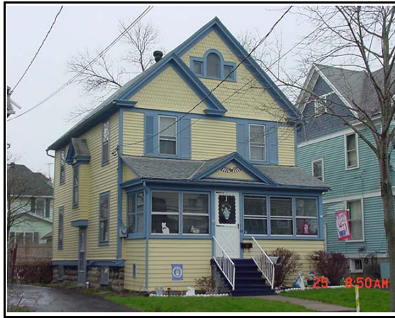
136 Ross St 180200 84.043-1-79

Neighborhood: 300 Property Class: 210 - 1 Family Res Sale Date: 7/20/2023 Sale Price: $ 177,000 Prelim 2024 Land Asmt: $ 10,600 Prelim 2024 Asmt: $ 122,000 Building Style: Old Style Exterior Wall: Wood Year Built: 1900 Basement Type: Full Grade: Average Condition: Normal SFLA: 1,452 Sale Price/SFLA: $ 121.90 Number Bedrooms: 3 Number Baths: 2.0