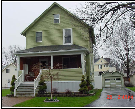
12 Chase Park 180200 84.051-1-25

Neighborhood: 700 Property Class: 210 - 1 Family Res Sale Date: 7/6/2022 Sale Price: $ 95,294 Prelim 2024 Land Asmt: $ 12,500 Prelim 2024 Asmt: $ 98,000 Building Style: Old Style Exterior Wall: Alum/vinyl Year Built: 1900 Basement Type: Full Grade: Average Condition: Fair SFLA: 1,275 Sale Price/SFLA: $ 74.74 Number Bedrooms: 3 Number Baths: 1.0