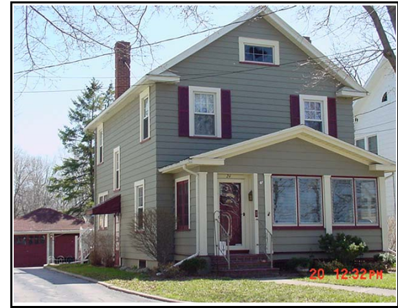
24 Lewis Ave 180200 84.033-1-5

Neighborhood: 200 Property Class: 220 - 2 Family Res Sale Date: 10/20/2023 Sale Price: $ 179,900 Prelim 2024 Land Asmt: $ 11,500 Prelim 2024 Asmt: $ 180,000 Building Style: Old Style Exterior Wall: Alum/vinyl Year Built: 1900 Basement Type: Partial Grade: Average Condition: Normal SFLA: 1,812 Sale Price/SFLA: $ 99.28 Number Bedrooms: 4 Number Baths: 3.0