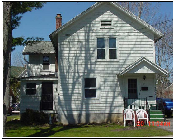
43 Prospect Ave 180200 84.024-1-14

Neighborhood: 200 Property Class: 210 - 1 Family Res Sale Date: 4/24/2023 Sale Price: $ 189,900 Prelim 2024 Land Asmt: $ 15,300 Prelim 2024 Asmt: $ 197,000 Building Style: Old Style Exterior Wall: Alum/vinyl Year Built: 1900 Basement Type: Partial Grade: Average Condition: Normal SFLA: 1,968 Sale Price/SFLA: $ 96.49 Number Bedrooms: 3 Number Baths: 1.0