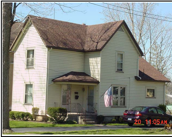
47 Prospect Ave 180200 84.024-1-12

Neighborhood: 200 Property Class: 210 - 1 Family Res Sale Date: 11/2/2023 Sale Price: $ 145,000 Prelim 2024 Land Asmt: $ 16,500 Prelim 2024 Asmt: $ 149,000 Building Style: Old Style Exterior Wall: Alum/vinyl Year Built: 1910 Basement Type: Full Grade: Average Condition: Normal SFLA: 1,208 Sale Price/SFLA: $ 120.03 Number Bedrooms: 3 Number Baths: 1.0