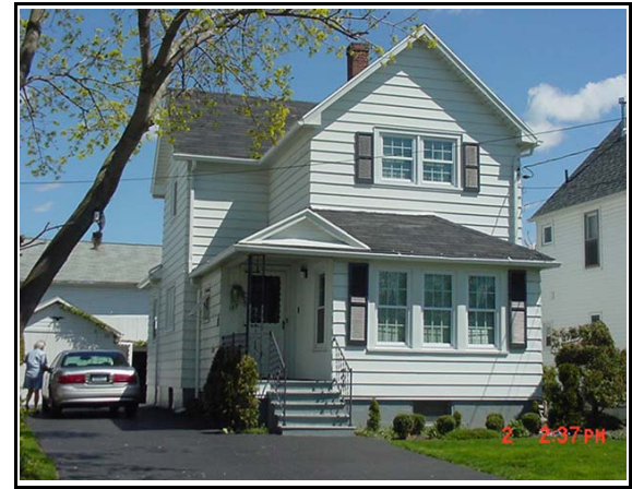
117 Hutchins St 180200 84.082-1-31

Neighborhood: 500 Property Class: 210 - 1 Family Res Sale Date: 9/13/2022 Sale Price: $ 145,000 Prelim 2024 Land Asmt: $ 13,200 Prelim 2024 Asmt: $ 158,000 Building Style: Old Style Exterior Wall: Composition Year Built: 1880 Basement Type: Full Grade: Average Condition: Normal SFLA: 1,416 Sale Price/SFLA: $ 102.40 Number Bedrooms: 4 Number Baths: 1.5