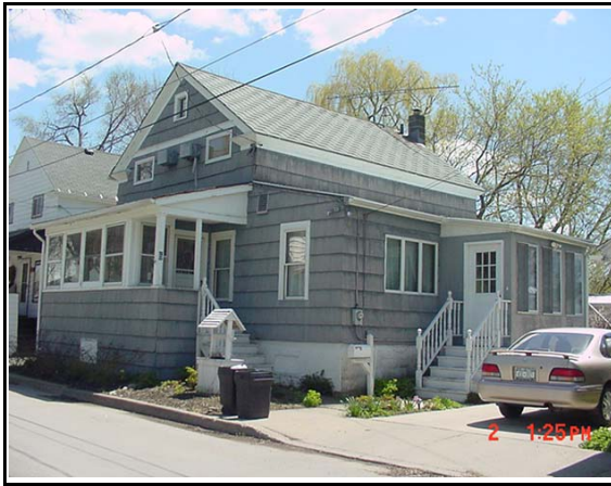
6 Hall St 180200 84.066-2-26

Neighborhood: 600 Property Class: 210 - 1 Family Res Sale Date: 7/13/2023 Sale Price: $ 129,000 Prelim 2024 Land Asmt: $ 11,300 Prelim 2024 Asmt: $ 135,000 Building Style: Old Style Exterior Wall: Wood Year Built: 1890 Basement Type: Full Grade: Average Condition: Fair SFLA: 1,268 Sale Price/SFLA: $ 101.74 Number Bedrooms: 5 Number Baths: 2.0