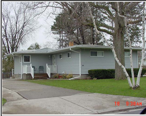
25 West Ave 180200 84.005-1-13

Neighborhood: 400 Property Class: 210 - 1 Family Res Sale Date: 2/15/2022 Sale Price: $ 120,000 Prelim 2024 Land Asmt: $ 31,200 Prelim 2024 Asmt: $ 134,000 Building Style: Ranch Exterior Wall: Alum/vinyl Year Built: 1949 Basement Type: Full Grade: Average Condition: Normal SFLA: 1,052 Sale Price/SFLA: $ 114.07 Number Bedrooms: 3 Number Baths: 1.0