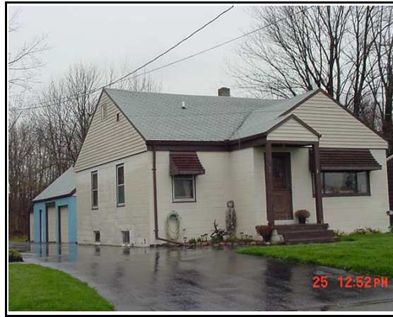
193 Vine St 180200 84.008-1-23

Neighborhood: 200 Property Class: 210 - 1 Family Res Sale Date: 9/28/2023 Sale Price: $ 225,000 Prelim 2024 Land Asmt: $ 16,500 Prelim 2024 Asmt: $ 244,000 Building Style: Cape Cod Exterior Wall: Alum/vinyl Year Built: 1942 Basement Type: Crawl Grade: Average Condition: Normal SFLA: 1,260 Sale Price/SFLA: $ 178.57 Number Bedrooms: 4 Number Baths: 1.0