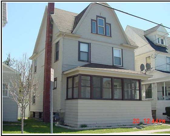
38 Dellinger Ave 180200 84.040-2-45

Neighborhood: 300 Property Class: 210 - 1 Family Res Sale Date: 2/25/2022 Sale Price: $ 88,740 Prelim 2024 Land Asmt: $ 5,500 Prelim 2024 Asmt: $ 101,000 Building Style: Old Style Exterior Wall: Wood Year Built: 1900 Basement Type: Full Grade: Average Condition: Normal SFLA: 1,268 Sale Price/SFLA: $ 69.98 Number Bedrooms: 3 Number Baths: 1.0