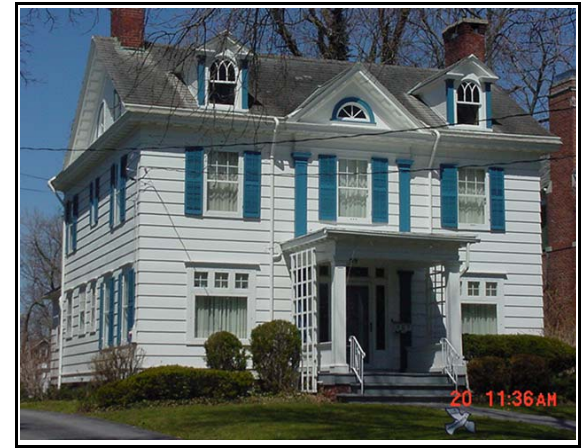
59 Ellicott Ave 180200 84.006-4-13

Neighborhood: 400 Property Class: 210 - 1 Family Res Sale Date: 10/25/2023 Sale Price: $ 235,000 Prelim 2024 Land Asmt: $ 33,800 Prelim 2024 Asmt: $ 235,000 Building Style: Old Style Exterior Wall: Alum/vinyl Year Built: 1926 Basement Type: Full Grade: Average Condition: Good SFLA: 1,800 Sale Price/SFLA: $ 130.56 Number Bedrooms: 3 Number Baths: 1.5