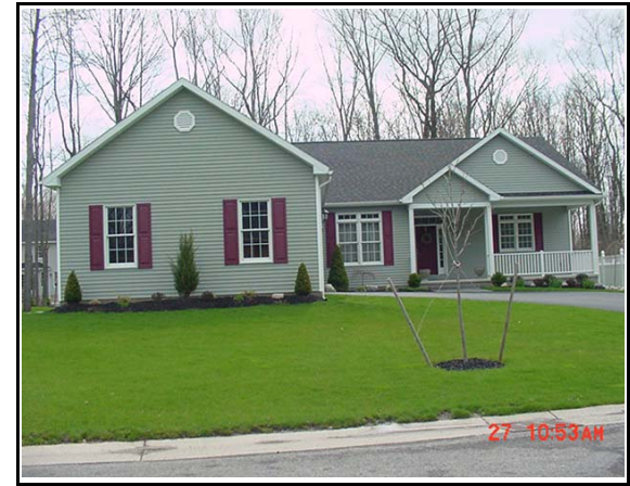
2 Carolwood Dr 180200 72.017-3-9

Neighborhood: 100 Property Class: 210 - 1 Family Res Sale Date: 10/16/2023 Sale Price: $ 385,900 Prelim 2024 Land Asmt: $ 31,600 Prelim 2024 Asmt: $ 395,000 Building Style: Ranch Exterior Wall: Brick Year Built: 1988 Basement Type: Full Grade: Good Condition: Good SFLA: 2,094 Sale Price/SFLA: $ 184.29 Number Bedrooms: 3 Number Baths: 2.0