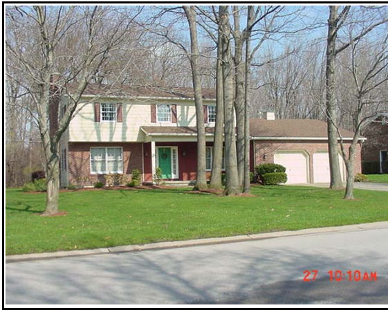
115 Naramore Dr 180200 85.005-1-51

Neighborhood: 100 Property Class: 210 - 1 Family Res Sale Date: 8/25/2023 Sale Price: $ 300,000 Prelim 2024 Land Asmt: $ 32,800 Prelim 2024 Asmt: $ 315,000 Building Style: Colonial Exterior Wall: Wood Year Built: 1971 Basement Type: Full Grade: Average Condition: Normal SFLA: 2,280 Sale Price/SFLA: $ 131.58 Number Bedrooms: 4 Number Baths: 2.5