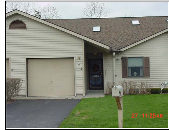
21 North Pointe Dr 180200 84.008-2-86

Neighborhood: 100 Property Class: 210 - 1 Family Res Sale Date: 12/20/2022 Sale Price: $ 175,000 Prelim 2024 Land Asmt: $ 9,900 Prelim 2024 Asmt: $ 182,000 Building Style: Town House Exterior Wall: Alum/vinyl Year Built: 1993 Basement Type: Full Grade: Average Condition: Normal SFLA: 1,236 Sale Price/SFLA: $ 141.59 Number Bedrooms: 2 Number Baths: 2.0