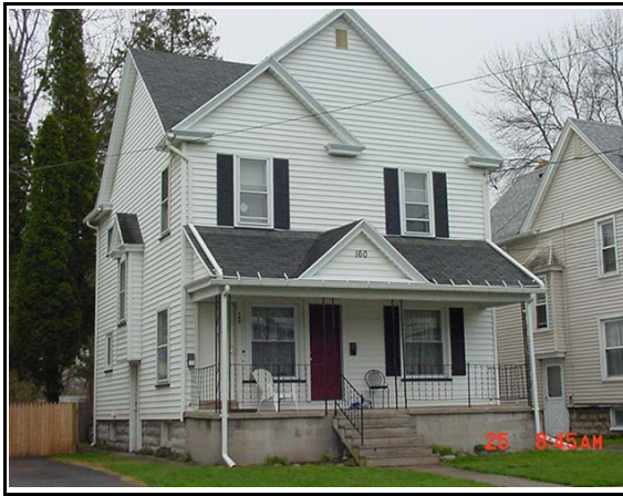
160 Ross St 180200 84.035-1-72

Neighborhood: 300 Property Class: 220 - 2 Family Res Sale Date: 3/15/2023 Sale Price: $ 97,000 Prelim 2024 Land Asmt: $ 9,500 Prelim 2024 Asmt: $ 101,000 Building Style: Old Style Exterior Wall: Alum/vinyl Year Built: 1900 Basement Type: Full Grade: Average Condition: Fair SFLA: 1,646 Sale Price/SFLA: $ 58.93 Number Bedrooms: 4 Number Baths: 2.0