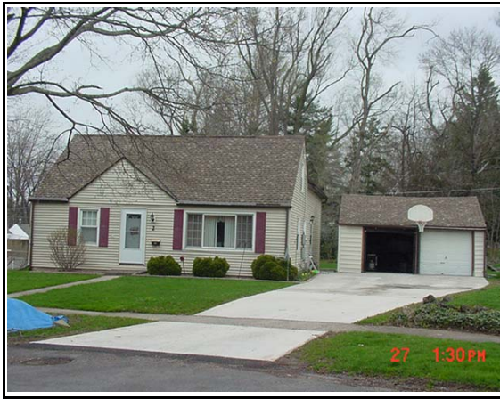
2 Crescent Ct 180200 85.009-2-53

Neighborhood: 200 Property Class: 210 - 1 Family Res Sale Date: 9/28/2023 Sale Price: $ 225,000 Prelim 2024 Land Asmt: $ 16,500 Prelim 2024 Asmt: $ 244,000 Building Style: Cape Cod Exterior Wall: Alum/vinyl Year Built: 1942 Basement Type: Crawl Grade: Average Condition: Normal SFLA: 1,260 Sale Price/SFLA: $ 178.57 Number Bedrooms: 4 Number Baths: 1.0