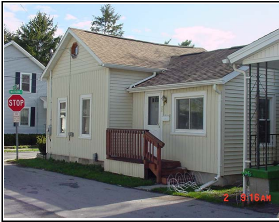
11 Thorp St 180200 84.065-1-5

Neighborhood: 500 Property Class: 210 - 1 Family Res Sale Date: 6/21/2022 Sale Price: $ 55,000 Prelim 2024 Land Asmt: $ 6,000 Prelim 2024 Asmt: $ 72,000 Building Style: Old Style Exterior Wall: Composition Year Built: 1840 Basement Type: Crawl Grade: Average Condition: Normal SFLA: 859 Sale Price/SFLA: $ 64.03 Number Bedrooms: 2 Number Baths: 1.0