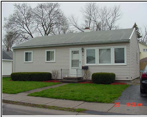
36 Seneca Ave 180200 84.034-2-16

Neighborhood: 300 Property Class: 210 - 1 Family Res Sale Date: 7/27/2022 Sale Price: $ 136,000 Prelim 2024 Land Asmt: $ 11,800 Prelim 2024 Asmt: $ 138,000 Building Style: Ranch Exterior Wall: Alum/vinyl Year Built: 1957 Basement Type: Full Grade: Average Condition: Normal SFLA: 864 Sale Price/SFLA: $ 157.41 Number Bedrooms: 3 Number Baths: 1.0