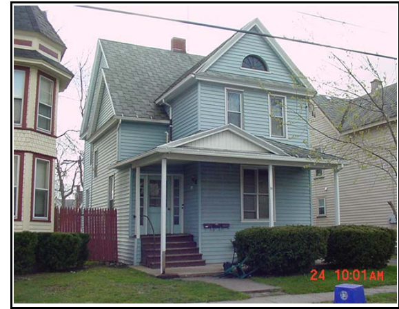
24 Tracy Ave 180200 84.042-1-44

Neighborhood: 300 Property Class: 210 - 1 Family Res Sale Date: 1/10/2023 Sale Price: $ 149,900 Prelim 2024 Land Asmt: $ 15,000 Prelim 2024 Asmt: $ 173,000 Building Style: Old Style Exterior Wall: Wood Year Built: 1930 Basement Type: Full Grade: Average Condition: Fair SFLA: 2,134 Sale Price/SFLA: $ 70.24 Number Bedrooms: 5 Number Baths: 2.5