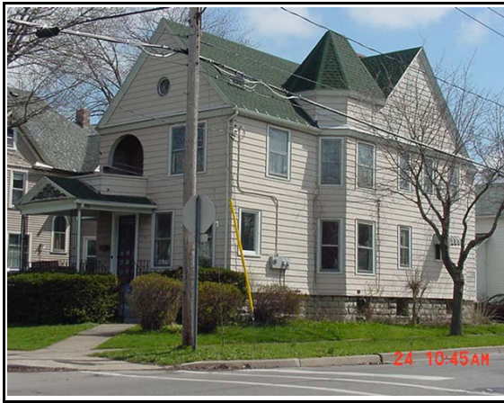
100 Summit St 180200 84.042-2-40