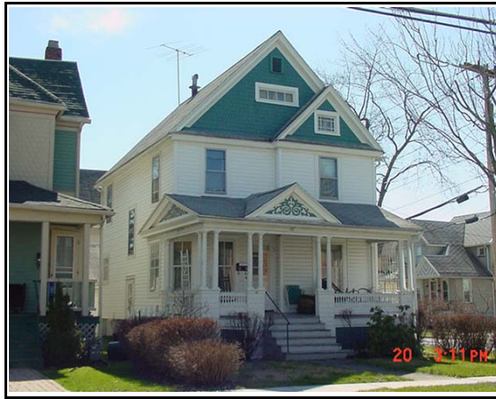
30 Washington Ave 180200 84.040-2-8

Neighborhood: 300 Property Class: 210 - 1 Family Res Sale Date: 3/31/2023 Sale Price: $ 130,000 Prelim 2024 Land Asmt: $ 7,100 Prelim 2024 Asmt: $ 139,000 Building Style: Old Style Exterior Wall: Wood Year Built: 1915 Basement Type: Full Grade: Average Condition: Normal SFLA: 1,416 Sale Price/SFLA: $ 91.81 Number Bedrooms: 3 Number Baths: 1.0