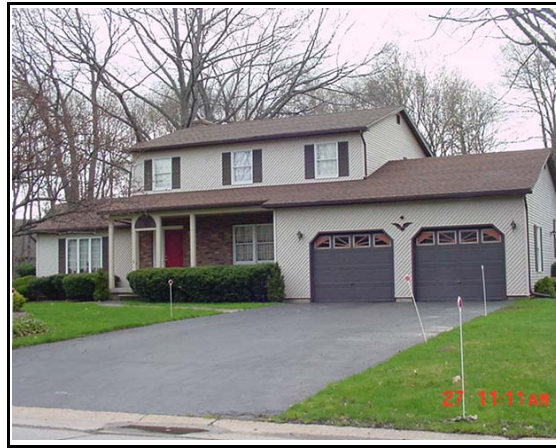
14 Belvedere Ln 180200 85.005-1-20

Neighborhood: 100 Property Class: 210 - 1 Family Res Sale Date: 10/7/2022 Sale Price: $ 300,000 Prelim 2024 Land Asmt: $ 42,900 Prelim 2024 Asmt: $ 314,000 Building Style: Colonial Exterior Wall: Alum/vinyl Year Built: 1990 Basement Type: Partial Grade: Average Condition: Normal SFLA: 1,880 Sale Price/SFLA: $ 159.57 Number Bedrooms: 4 Number Baths: 2.5