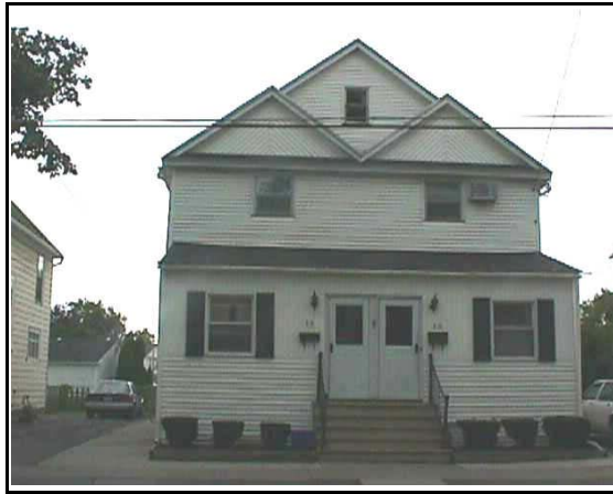
10-12 South Main St 180200 84.048-1-69

Neighborhood: 500 Property Class: 210 - 1 Family Res Sale Date: 2/6/2023 Sale Price: $ 100,000 Prelim 2024 Land Asmt: $ 17,100 Prelim 2024 Asmt: $ 97,000 Building Style: Old Style Exterior Wall: Alum/vinyl Year Built: 1870 Basement Type: Partial Grade: Economy Condition: Poor SFLA: 2,569 Sale Price/SFLA: $ 38.93 Number Bedrooms: 5 Number Baths: 3.5