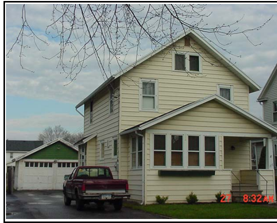
127 Trumbull Pkwy 180200 84.043-2-27

Neighborhood: 200 Property Class: 210 - 1 Family Res Sale Date: 8/11/2022 Sale Price: $ 150,000 Prelim 2024 Land Asmt: $ 14,000 Prelim 2024 Asmt: $ 139,000 Building Style: Old Style Exterior Wall: Alum/vinyl Year Built: 1915 Basement Type: Full Grade: Average Condition: Normal SFLA: 1,396 Sale Price/SFLA: $ 107.45 Number Bedrooms: 4 Number Baths: 1.0