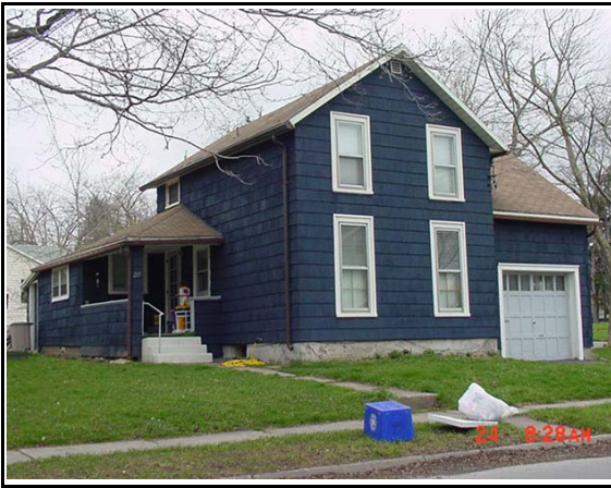
217 Bank St 180200 84.025-1-20

Neighborhood: 300 Property Class: 210 - 1 Family Res Sale Date: 8/12/2023 Sale Price: $ 93,500 Prelim 2024 Land Asmt: $ 12,000 Prelim 2024 Asmt: $ 116,000 Building Style: Old Style Exterior Wall: Wood Year Built: 1880 Basement Type: Partial Grade: Average Condition: Fair SFLA: 1,248 Sale Price/SFLA: $ 74.92 Number Bedrooms: 3 Number Baths: 1.5