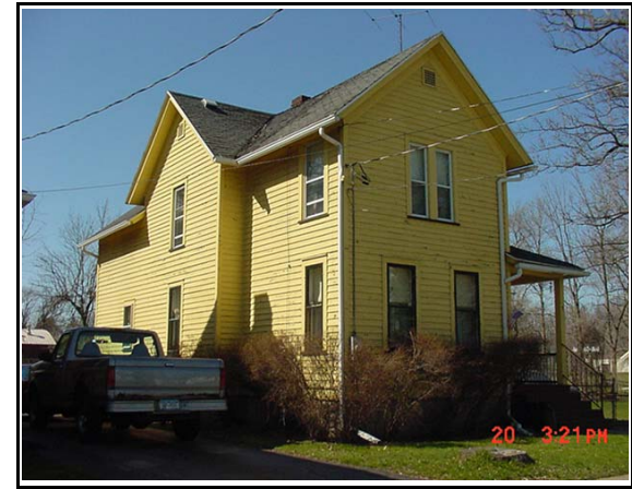
7 Willow St 180200 84.007-1-22

Neighborhood: 300 Property Class: 210 - 1 Family Res Sale Date: 2/28/2023 Sale Price: $ 125,497 Prelim 2024 Land Asmt: $ 17,800 Prelim 2024 Asmt: $ 139,000 Building Style: Old Style Exterior Wall: Composition Year Built: 1939 Basement Type: Full Grade: Average Condition: Fair SFLA: 1,308 Sale Price/SFLA: $ 95.95 Number Bedrooms: 2 Number Baths: 1.5