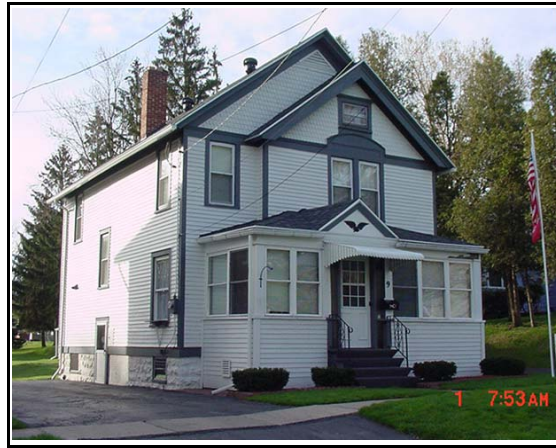
9 Franklin St 180200 84.014-1-16

Neighborhood: 500 Property Class: 220 - 2 Family Res Sale Date: 1/10/2023 Sale Price: $ 78,000 Prelim 2024 Land Asmt: $ 8,700 Prelim 2024 Asmt: $ 74,000 Building Style: Old Style Exterior Wall: Wood Year Built: 1880 Basement Type: Full Grade: Average Condition: Fair SFLA: 1,613 Sale Price/SFLA: $ 48.36 Number Bedrooms: 3 Number Baths: 2.0