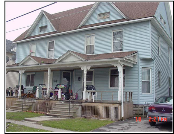
3-5 Holland Ave 180200 84.031-3-23

Neighborhood: 300 Property Class: 220 - 2 Family Res Sale Date: 2/3/2022 Sale Price: $ 160,000 Prelim 2024 Land Asmt: $ 10,100 Prelim 2024 Asmt: $ 173,000 Building Style: Old Style Exterior Wall: Alum/vinyl Year Built: 1910 Basement Type: Full Grade: Average Condition: Normal SFLA: 2,170 Sale Price/SFLA: $ 73.73 Number Bedrooms: 6 Number Baths: 2.0