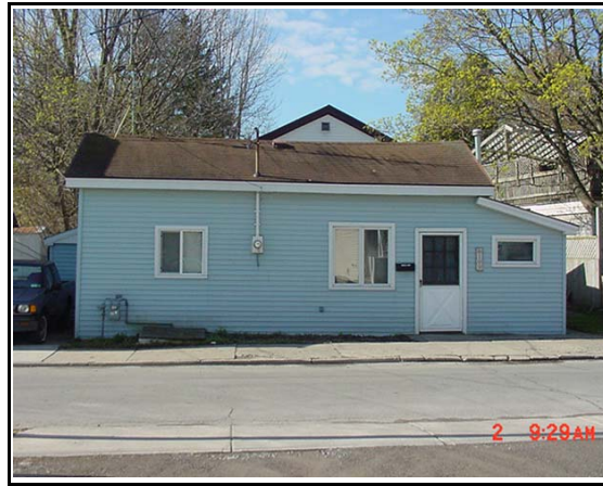
109 Watson St 180200 84.065-1-2

Neighborhood: 500 Property Class: 210 - 1 Family Res Sale Date: 6/21/2022 Sale Price: $ 55,000 Prelim 2024 Land Asmt: $ 6,000 Prelim 2024 Asmt: $ 72,000 Building Style: Old Style Exterior Wall: Composition Year Built: 1840 Basement Type: Crawl Grade: Average Condition: Normal SFLA: 859 Sale Price/SFLA: $ 64.03 Number Bedrooms: 2 Number Baths: 1.0