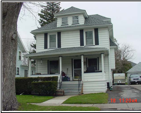
15 Vernon Ave 180200 84.031-1-7

Neighborhood: 200 Property Class: 210 - 1 Family Res Sale Date: 8/15/2023 Sale Price: $ 120,000 Prelim 2024 Land Asmt: $ 15,300 Prelim 2024 Asmt: $ 130,000 Building Style: Old Style Exterior Wall: Alum/vinyl Year Built: 1905 Basement Type: Full Grade: Average Condition: Normal SFLA: 1,628 Sale Price/SFLA: $ 73.71 Number Bedrooms: 4 Number Baths: 1.5