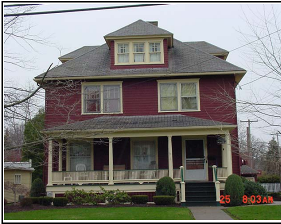
25 Ross St 180200 84.011-2-31

Neighborhood: 700 Property Class: 210 - 1 Family Res Sale Date: 7/28/2023 Sale Price: $ 260,000 Prelim 2024 Land Asmt: $ 17,000 Prelim 2024 Asmt: $ 261,000 Building Style: Old Style Exterior Wall: Wood Year Built: 1925 Basement Type: Full Grade: Average Condition: Normal SFLA: 2,336 Sale Price/SFLA: $ 111.30 Number Bedrooms: 4 Number Baths: 2.0