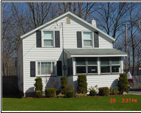
12 Hutchins Pl 180200 84.041-1-51

Neighborhood: 700 Property Class: 210 - 1 Family Res Sale Date: 5/26/2022 Sale Price: $ 17,500 Prelim 2024 Land Asmt: $ 13,200 Prelim 2024 Asmt: $ 57,000 Building Style: Old Style Exterior Wall: Alum/vinyl Year Built: 1900 Basement Type: Crawl Grade: Average Condition: Normal SFLA: 957 Sale Price/SFLA: $ 18.29 Number Bedrooms: 2 Number Baths: 1.0