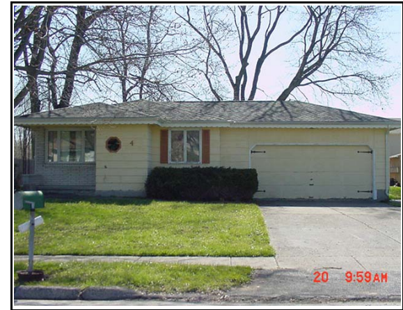
4 Gateway Dr 180200 71.018-2-22

Neighborhood: 200 Property Class: 210 - 1 Family Res Sale Date: 6/8/2023 Sale Price: $ 182,500 Prelim 2024 Land Asmt: $ 20,100 Prelim 2024 Asmt: $ 185,000 Building Style: Ranch Exterior Wall: Alum/vinyl Year Built: 1951 Basement Type: Full Grade: Average Condition: Good SFLA: 932 Sale Price/SFLA: $ 195.82 Number Bedrooms: 2 Number Baths: 1.5