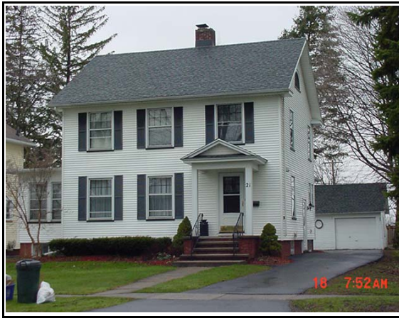
21 Redfield Pkwy 180200 84.005-1-77

Neighborhood: 400 Property Class: 210 - 1 Family Res Sale Date: 6/13/2022 Sale Price: $ 211,000 Prelim 2024 Land Asmt: $ 26,900 Prelim 2024 Asmt: $ 219,000 Building Style: Old Style Exterior Wall: Alum/vinyl Year Built: 1925 Basement Type: Full Grade: Average Condition: Normal SFLA: 1,635 Sale Price/SFLA: $ 129.05 Number Bedrooms: 3 Number Baths: 1.0