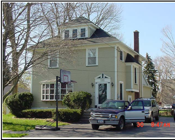
111 South Main St 180200 84.010-1-3

Neighborhood: 500 Property Class: 210 - 1 Family Res Sale Date: 1/13/2022 Sale Price: $ 160,000 Prelim 2024 Land Asmt: $ 14,500 Prelim 2024 Asmt: $ 167,000 Building Style: Old Style Exterior Wall: Alum/vinyl Year Built: 1924 Basement Type: Full Grade: Average Condition: Normal SFLA: 2,030 Sale Price/SFLA: $ 78.82 Number Bedrooms: 5 Number Baths: 2.0