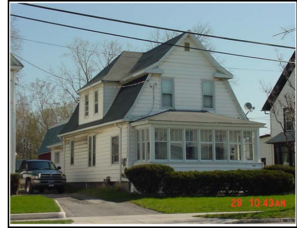
348 West Main St 180200 84.005-2-18

Neighborhood: 300 Property Class: 210 - 1 Family Res Sale Date: 11/20/2023 Sale Price: $ 215,000 Prelim 2024 Land Asmt: $ 14,300 Prelim 2024 Asmt: $ 217,000 Building Style: Old Style Exterior Wall: Wood Year Built: 1900 Basement Type: Full Grade: Average Condition: Good SFLA: 1,628 Sale Price/SFLA: $ 132.06 Number Bedrooms: 4 Number Baths: 1.5