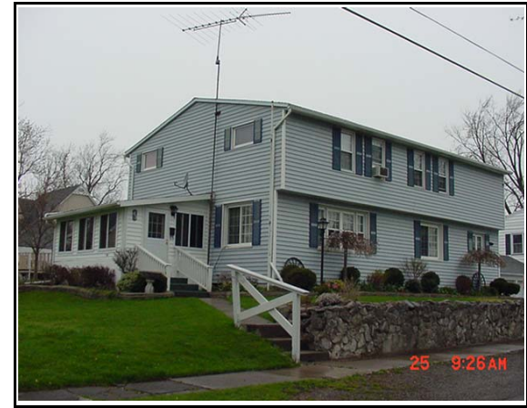
63 Manhattan Ave 180200 84.035-1-3

Neighborhood: 200 Property Class: 210 - 1 Family Res Sale Date: 1/31/2023 Sale Price: $ 195,000 Prelim 2024 Land Asmt: $ 22,300 Prelim 2024 Asmt: $ 218,000 Building Style: Colonial Exterior Wall: Alum/vinyl Year Built: 1977 Basement Type: Full Grade: Average Condition: Fair SFLA: 2,436 Sale Price/SFLA: $ 80.05 Number Bedrooms: 4 Number Baths: 1.5