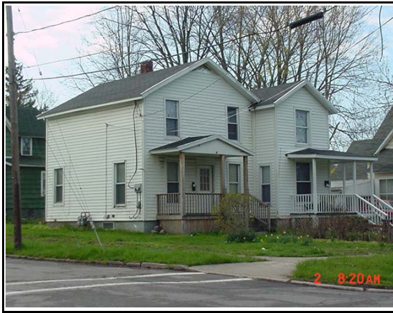
137 Jackson St 180200 84.065-2-33

Neighborhood: 500 Property Class: 220 - 2 Family Res Sale Date: 2/23/2022 Sale Price: $ 95,000 Prelim 2024 Land Asmt: $ 13,700 Prelim 2024 Asmt: $ 122,000 Building Style: Old Style Exterior Wall: Alum/vinyl Year Built: 1900 Basement Type: Full Grade: Average Condition: Normal SFLA: 2,118 Sale Price/SFLA: $ 44.85 Number Bedrooms: 5 Number Baths: 2.0