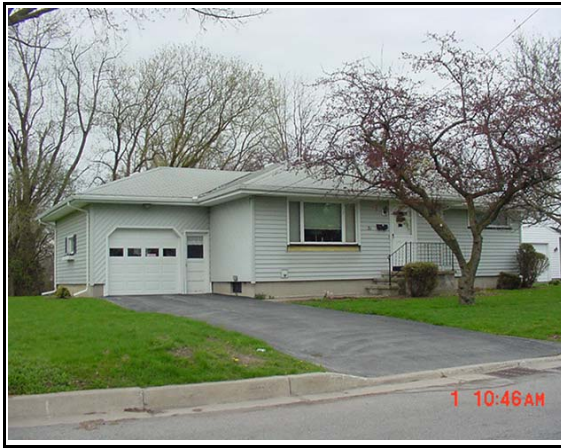
31 Clifton Ave 180200 84.020-3-58

Neighborhood: 500 Property Class: 210 - 1 Family Res Sale Date: 1/23/2023 Sale Price: $ 149,000 Prelim 2024 Land Asmt: $ 14,400 Prelim 2024 Asmt: $ 153,000 Building Style: Ranch Exterior Wall: Alum/vinyl Year Built: 1960 Basement Type: Full Grade: Average Condition: Normal SFLA: 1,212 Sale Price/SFLA: $ 122.94 Number Bedrooms: 3 Number Baths: 1.0