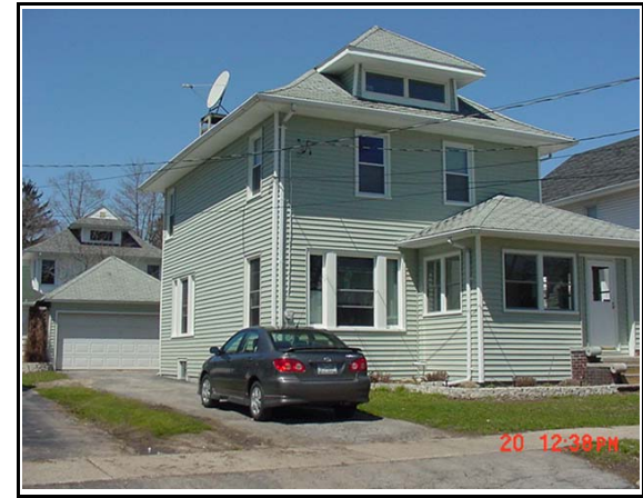
11 Lewis Ave 180200 84.032-2-14

Neighborhood: 200 Property Class: 210 - 1 Family Res Sale Date: 10/5/2022 Sale Price: $ 218,000 Prelim 2024 Land Asmt: $ 16,300 Prelim 2024 Asmt: $ 221,000 Building Style: Old Style Exterior Wall: Brick Year Built: 1914 Basement Type: Full Grade: Average Condition: Normal SFLA: 1,808 Sale Price/SFLA: $ 120.58 Number Bedrooms: 4 Number Baths: 1.5