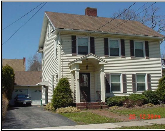
17 Lewis Ave 180200 84.032-2-11

Neighborhood: 200 Property Class: 210 - 1 Family Res Sale Date: 2/23/2023 Sale Price: $ 147,500 Prelim 2024 Land Asmt: $ 14,600 Prelim 2024 Asmt: $ 168,000 Building Style: Old Style Exterior Wall: Alum/vinyl Year Built: 1920 Basement Type: Full Grade: Average Condition: Normal SFLA: 1,660 Sale Price/SFLA: $ 88.86 Number Bedrooms: 3 Number Baths: 1.0