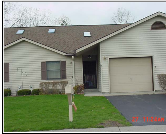
19 North Pointe Dr 180200 84.008-2-85

Neighborhood: 100 Property Class: 210 - 1 Family Res Sale Date: 1/20/2022 Sale Price: $ 189,900 Prelim 2024 Land Asmt: $ 4,500 Prelim 2024 Asmt: $ 182,000 Building Style: Town House Exterior Wall: Alum/vinyl Year Built: 1994 Basement Type: Full Grade: Average Condition: Normal SFLA: 1,236 Sale Price/SFLA: $ 153.64 Number Bedrooms: 2 Number Baths: 2.0