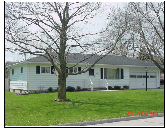
2 Fordham Dr 180200 84.012-3-18

Neighborhood: 200 Property Class: 210 - 1 Family Res Sale Date: 6/30/2022 Sale Price: $ 170,000 Prelim 2024 Land Asmt: $ 18,900 Prelim 2024 Asmt: $ 188,000 Building Style: Ranch Exterior Wall: Alum/vinyl Year Built: 1955 Basement Type: Full Grade: Average Condition: Normal SFLA: 1,075 Sale Price/SFLA: $ 158.14 Number Bedrooms: 3 Number Baths: 1.0