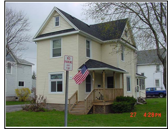
16 Edward St 180200 84.084-1-7

Neighborhood: 600 Property Class: 210 - 1 Family Res Sale Date: 4/6/2023 Sale Price: $ 155,000 Prelim 2024 Land Asmt: $ 14,200 Prelim 2024 Asmt: $ 196,000 Building Style: Old Style Exterior Wall: Alum/vinyl Year Built: 1910 Basement Type: Full Grade: Average Condition: Normal SFLA: 1,428 Sale Price/SFLA: $ 108.54 Number Bedrooms: 3 Number Baths: 1.5