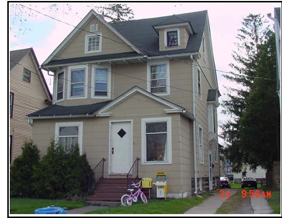
52 Tracy Ave 180200 84.034-1-44

Neighborhood: 300 Property Class: 210 - 1 Family Res Sale Date: 6/23/2022 Sale Price: $ 40,000 Prelim 2024 Land Asmt: $ 16,100 Prelim 2024 Asmt: $ 75,000 Building Style: Old Style Exterior Wall: Wood Year Built: 1930 Basement Type: Partial Grade: Average Condition: Normal SFLA: 2,072 Sale Price/SFLA: $ 19.31 Number Bedrooms: 4 Number Baths: 1.5