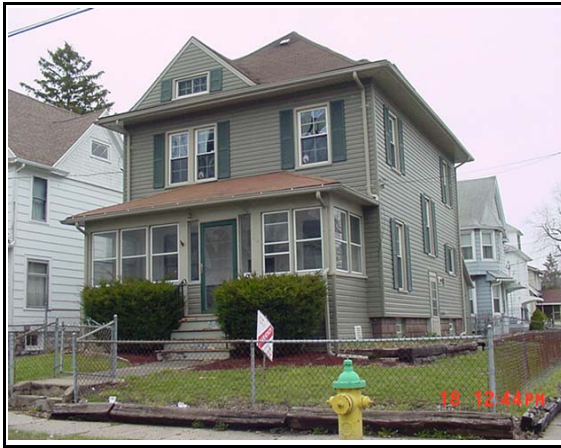
22 Montclair Ave 180200 84.031-3-47

Neighborhood: 300 Property Class: 210 - 1 Family Res Sale Date: 9/29/2022 Sale Price: $ 107,000 Prelim 2024 Land Asmt: $ 9,000 Prelim 2024 Asmt: $ 137,000 Building Style: Old Style Exterior Wall: Alum/vinyl Year Built: 1910 Basement Type: Full Grade: Average Condition: Fair SFLA: 1,440 Sale Price/SFLA: $ 74.31 Number Bedrooms: 3 Number Baths: 1.5