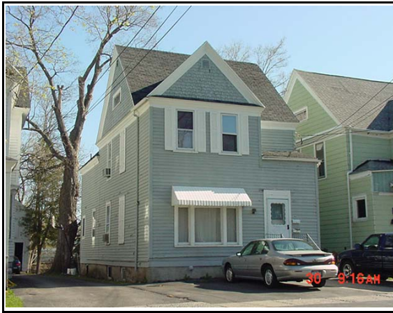
46 South Main St 180200 84.039-2-12

Neighborhood: 500 Property Class: 220 - 2 Family Res Sale Date: 7/31/2023 Sale Price: $ 82,500 Prelim 2024 Land Asmt: $ 8,700 Prelim 2024 Asmt: $ 80,000 Building Style: Old Style Exterior Wall: Wood Year Built: 1900 Basement Type: Full Grade: Average Condition: Poor SFLA: 1,936 Sale Price/SFLA: $ 42.61 Number Bedrooms: 4 Number Baths: 2.0