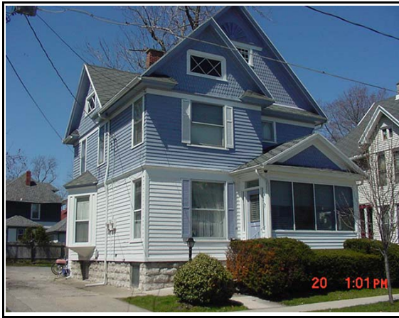
19 Dellinger Ave 180200 84.040-2-66

Neighborhood: 300 Property Class: 220 - 2 Family Res Sale Date: 6/1/2022 Sale Price: $ 98,000 Prelim 2024 Land Asmt: $ 12,500 Prelim 2024 Asmt: $ 117,000 Building Style: Old Style Exterior Wall: Wood Year Built: 1915 Basement Type: Full Grade: Average Condition: Normal SFLA: 1,946 Sale Price/SFLA: $ 50.36 Number Bedrooms: 4 Number Baths: 2.0