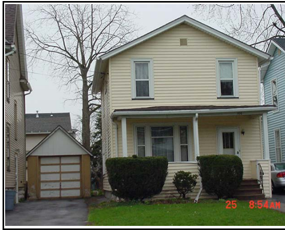
106 Ross St 180200 84.043-3-2

Neighborhood: 700 Property Class: 210 - 1 Family Res Sale Date: 4/14/2022 Sale Price: $ 100,000 Prelim 2024 Land Asmt: $ 23,900 Prelim 2024 Asmt: $ 113,000 Building Style: Old Style Exterior Wall: Wood Year Built: 1909 Basement Type: Full Grade: Average Condition: Normal SFLA: 1,512 Sale Price/SFLA: $ 66.14 Number Bedrooms: 4 Number Baths: 1.5