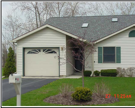
25 North Pointe Dr 180200 84.008-2-88

Neighborhood: 100 Property Class: 210 - 1 Family Res Sale Date: 7/12/2022 Sale Price: $ 204,000 Prelim 2024 Land Asmt: $ 9,900 Prelim 2024 Asmt: $ 215,000 Building Style: Town House Exterior Wall: Alum/vinyl Year Built: 2002 Basement Type: Full Grade: Average Condition: Good SFLA: 1,236 Sale Price/SFLA: $ 165.05 Number Bedrooms: 2 Number Baths: 2.0