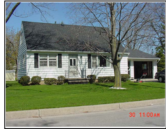
36 Roosevelt Ave 180200 84.009-2-27

Neighborhood: 500 Property Class: 210 - 1 Family Res Sale Date: 8/12/2022 Sale Price: $ 211,000 Prelim 2024 Land Asmt: $ 17,600 Prelim 2024 Asmt: $ 215,000 Building Style: Split Level Exterior Wall: Alum/vinyl Year Built: 1972 Basement Type: Full Grade: Average Condition: Normal SFLA: 2,020 Sale Price/SFLA: $ 104.46 Number Bedrooms: 4 Number Baths: 1.0