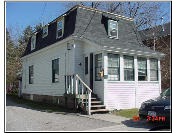
22 Hutchins Pl 180200 84.041-1-56

Neighborhood: 700 Property Class: 220 - 2 Family Res Sale Date: 7/29/2022 Sale Price: $ 76,000 Prelim 2024 Land Asmt: $ 11,000 Prelim 2024 Asmt: $ 86,000 Building Style: Old Style Exterior Wall: Alum/vinyl Year Built: 1900 Basement Type: Full Grade: Average Condition: Fair SFLA: 1,040 Sale Price/SFLA: $ 73.08 Number Bedrooms: 2 Number Baths: 2.0