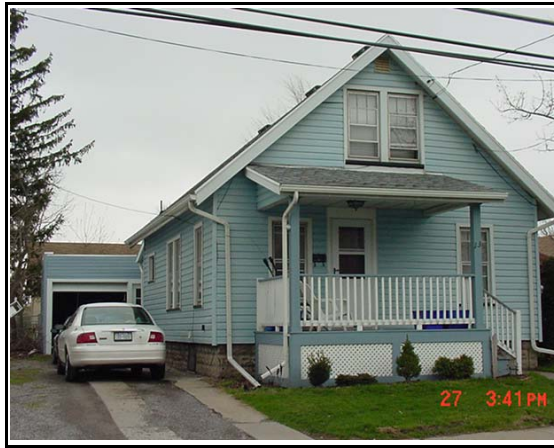
13 Cedar St 180200 85.013-1-67

Neighborhood: 600 Property Class: 210 - 1 Family Res Sale Date: 10/17/2022 Sale Price: $ 155,000 Prelim 2024 Land Asmt: $ 21,600 Prelim 2024 Asmt: $ 161,000 Building Style: Cape Cod Exterior Wall: Alum/vinyl Year Built: 1900 Basement Type: Full Grade: Average Condition: Normal SFLA: 1,660 Sale Price/SFLA: $ 93.37 Number Bedrooms: 4 Number Baths: 1.0