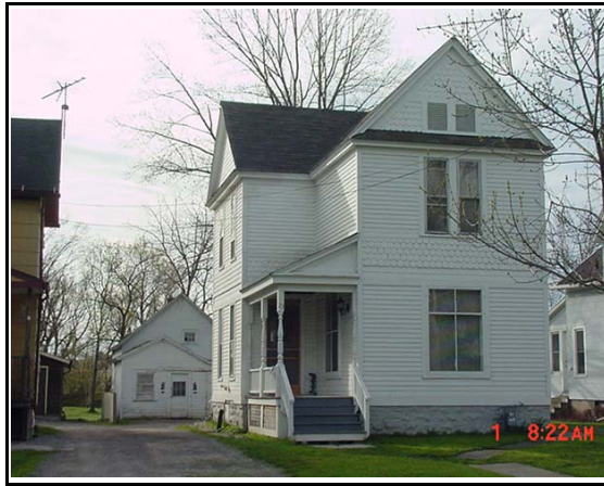
23 Walnut St 180200 84.056-1-3

Neighborhood: 500 Property Class: 210 - 1 Family Res Sale Date: 3/8/2022 Sale Price: $ 131,000 Prelim 2024 Land Asmt: $ 17,200 Prelim 2024 Asmt: $ 154,000 Building Style: Old Style Exterior Wall: Alum/vinyl Year Built: 1925 Basement Type: Partial Grade: Average Condition: Normal SFLA: 1,388 Sale Price/SFLA: $ 94.38 Number Bedrooms: 3 Number Baths: 1.5