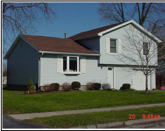
25 Gateway Dr 180200 71.014-2-17

Neighborhood: 200 Property Class: 210 - 1 Family Res Sale Date: 6/21/2023 Sale Price: $ 235,000 Prelim 2024 Land Asmt: $ 17,500 Prelim 2024 Asmt: $ 233,000 Building Style: Split Level Exterior Wall: Alum/vinyl Year Built: 1972 Basement Type: Partial Grade: Average Condition: Normal SFLA: 1,557 Sale Price/SFLA: $ 150.93 Number Bedrooms: 3 Number Baths: 1.0