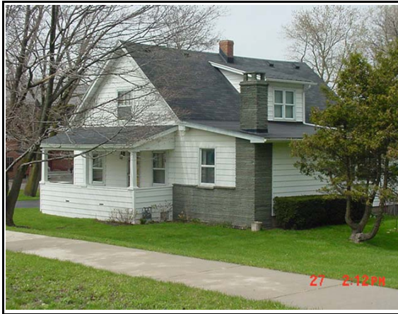
685 East Main St 180200 85.013-1-25

Neighborhood: 600 Property Class: 210 - 1 Family Res Sale Date: 10/17/2022 Sale Price: $ 155,000 Prelim 2024 Land Asmt: $ 21,600 Prelim 2024 Asmt: $ 161,000 Building Style: Cape Cod Exterior Wall: Alum/vinyl Year Built: 1900 Basement Type: Full Grade: Average Condition: Normal SFLA: 1,660 Sale Price/SFLA: $ 93.37 Number Bedrooms: 4 Number Baths: 1.0