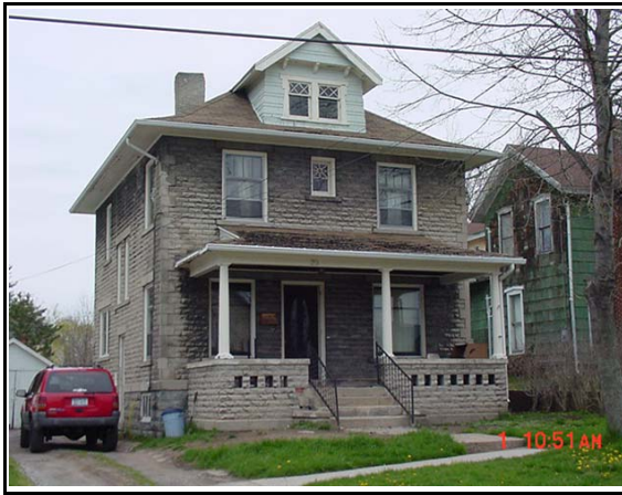
20 Clifton Ave 180200 84.020-2-17

Neighborhood: 500 Property Class: 210 - 1 Family Res Sale Date: 5/2/2022 Sale Price: $ 147,300 Prelim 2024 Land Asmt: $ 12,100 Prelim 2024 Asmt: $ 156,000 Building Style: Old Style Exterior Wall: Concrete Year Built: 1912 Basement Type: Full Grade: Average Condition: Normal SFLA: 1,735 Sale Price/SFLA: $ 84.90 Number Bedrooms: 4 Number Baths: 1.0