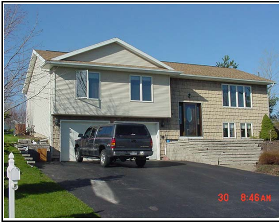
1 Edgewood Dr 180200 84.009-1-88.3

Neighborhood: 200 Property Class: 210 - 1 Family Res Sale Date: 3/8/2022 Sale Price: $ 295,000 Prelim 2024 Land Asmt: $ 20,400 Prelim 2024 Asmt: $ 301,000 Building Style: R. Ranch Exterior Wall: Alum/vinyl Year Built: 1989 Basement Type: Full Grade: Average Condition: Normal SFLA: 2,426 Sale Price/SFLA: $ 121.60 Number Bedrooms: 3 Number Baths: 1.5