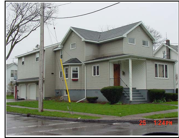
24 Vine St 180200 84.051-1-3

Neighborhood: 700 Property Class: 220 - 2 Family Res Sale Date: 5/20/2022 Sale Price: $ 191,000 Prelim 2024 Land Asmt: $ 15,700 Prelim 2024 Asmt: $ 198,000 Building Style: Old Style Exterior Wall: Composition Year Built: 1903 Basement Type: Full Grade: Average Condition: Normal SFLA: 2,584 Sale Price/SFLA: $ 73.92 Number Bedrooms: 6 Number Baths: 2.0