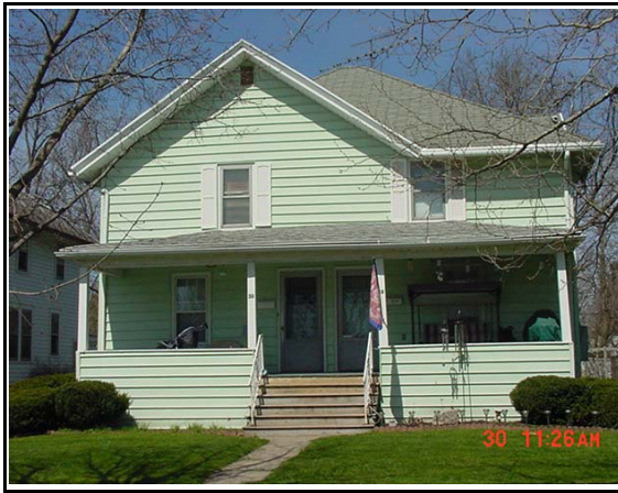
28-30 Brooklyn Ave 180200 84.010-1-13

Neighborhood: 500 Property Class: 220 - 2 Family Res Sale Date: 4/8/2022 Sale Price: $ 120,000 Prelim 2024 Land Asmt: $ 14,400 Prelim 2024 Asmt: $ 137,000 Building Style: Old Style Exterior Wall: Alum/vinyl Year Built: 1925 Basement Type: Full Grade: Average Condition: Normal SFLA: 2,176 Sale Price/SFLA: $ 55.15 Number Bedrooms: 6 Number Baths: 2.0