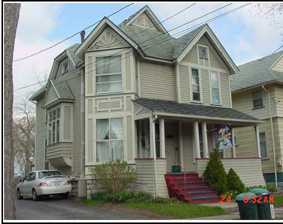
17 Tracy Ave 180200 84.042-1-50

Neighborhood: 300 Property Class: 210 - 1 Family Res Sale Date: 12/27/2022 Sale Price: $ 103,000 Prelim 2024 Land Asmt: $ 10,900 Prelim 2024 Asmt: $ 117,000 Building Style: Old Style Exterior Wall: Wood Year Built: 1900 Basement Type: Full Grade: Average Condition: Fair SFLA: 1,624 Sale Price/SFLA: $ 63.42 Number Bedrooms: 4 Number Baths: 1.0