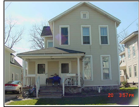
117 State St 180200 84.007-1-18

Neighborhood: 700 Property Class: 220 - 2 Family Res Sale Date: 5/24/2023 Sale Price: $ 84,000 Prelim 2024 Land Asmt: $ 9,300 Prelim 2024 Asmt: $ 98,000 Building Style: Old Style Exterior Wall: Wood Year Built: 1880 Basement Type: Full Grade: Average Condition: Poor SFLA: 2,216 Sale Price/SFLA: $ 37.91 Number Bedrooms: 4 Number Baths: 2.0