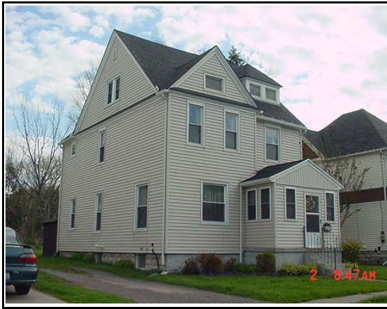
10 Morton Ave 180200 84.015-2-24

Neighborhood: 500 Property Class: 210 - 1 Family Res Sale Date: 5/26/2022 Sale Price: $ 117,000 Prelim 2024 Land Asmt: $ 13,400 Prelim 2024 Asmt: $ 123,000 Building Style: Old Style Exterior Wall: Alum/vinyl Year Built: 1875 Basement Type: Full Grade: Average Condition: Normal SFLA: 1,578 Sale Price/SFLA: $ 74.14 Number Bedrooms: 4 Number Baths: 1.5