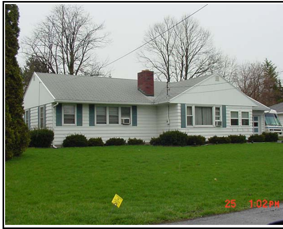
17 Northern Blvd 180200 71.020-1-55

Neighborhood: 200 Property Class: 210 - 1 Family Res Sale Date: 8/10/2022 Sale Price: $ 200,090 Prelim 2024 Land Asmt: $ 17,500 Prelim 2024 Asmt: $ 219,000 Building Style: Ranch Exterior Wall: Wood Year Built: 1966 Basement Type: Full Grade: Average Condition: Normal SFLA: 1,403 Sale Price/SFLA: $ 142.62 Number Bedrooms: 3 Number Baths: 1.5