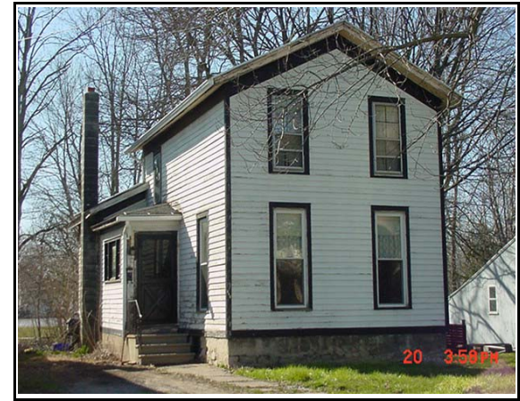
123 State St 180200 84.007-1-15

Neighborhood: 700 Property Class: 210 - 1 Family Res Sale Date: 9/18/2023 Sale Price: $ 135,000 Prelim 2024 Land Asmt: $ 16,800 Prelim 2024 Asmt: $ 135,000 Building Style: Old Style Exterior Wall: Wood Year Built: 1910 Basement Type: Full Grade: Average Condition: Good SFLA: 1,296 Sale Price/SFLA: $ 104.17 Number Bedrooms: 3 Number Baths: 1.0