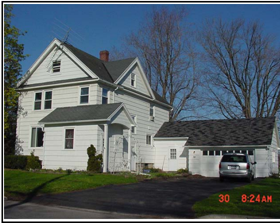
20 River St 180200 84.005-2-54

Neighborhood: 500 Property Class: 210 - 1 Family Res Sale Date: 10/27/2023 Sale Price: $ 155,000 Prelim 2024 Land Asmt: $ 19,300 Prelim 2024 Asmt: $ 154,000 Building Style: Old Style Exterior Wall: Alum/vinyl Year Built: 1912 Basement Type: Full Grade: Average Condition: Normal SFLA: 1,920 Sale Price/SFLA: $ 80.73 Number Bedrooms: 4 Number Baths: 1.5