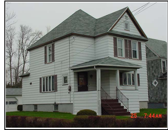
9 Ellsworth Ave 180200 84.034-3-34

Neighborhood: 300 Property Class: 210 - 1 Family Res Sale Date: 10/26/2022 Sale Price: $ 175,000 Prelim 2024 Land Asmt: $ 10,000 Prelim 2024 Asmt: $ 169,000 Building Style: Old Style Exterior Wall: Alum/vinyl Year Built: 1900 Basement Type: Full Grade: Average Condition: Normal SFLA: 1,344 Sale Price/SFLA: $ 130.21 Number Bedrooms: 3 Number Baths: 1.0