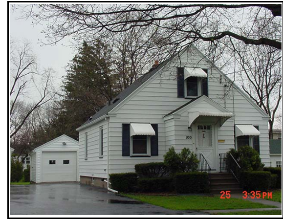
100 Elm St 180200 84.043-2-42

Neighborhood: 200 Property Class: 210 - 1 Family Res Sale Date: 10/10/2023 Sale Price: $ 195,000 Prelim 2024 Land Asmt: $ 26,700 Prelim 2024 Asmt: $ 212,000 Building Style: Split Level Exterior Wall: Wood Year Built: 1955 Basement Type: Full Grade: Average Condition: Normal SFLA: 1,987 Sale Price/SFLA: $ 98.14 Number Bedrooms: 3 Number Baths: 1.5