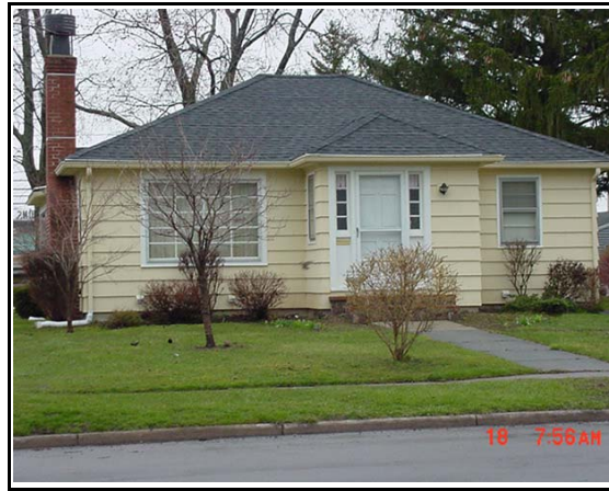
43 Redfield Pkwy 180200 71.017-2-47

Neighborhood: 400 Property Class: 210 - 1 Family Res Sale Date: 2/15/2022 Sale Price: $ 120,000 Prelim 2024 Land Asmt: $ 31,200 Prelim 2024 Asmt: $ 134,000 Building Style: Ranch Exterior Wall: Alum/vinyl Year Built: 1949 Basement Type: Full Grade: Average Condition: Normal SFLA: 1,052 Sale Price/SFLA: $ 114.07 Number Bedrooms: 3 Number Baths: 1.0