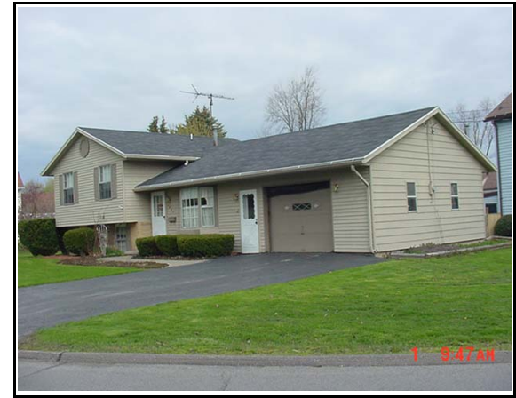
447 South Jackson St 180200 84.019-3-45

Neighborhood: 500 Property Class: 210 - 1 Family Res Sale Date: 12/6/2022 Sale Price: $ 223,000 Prelim 2024 Land Asmt: $ 15,700 Prelim 2024 Asmt: $ 227,000 Building Style: R. Ranch Exterior Wall: Alum/vinyl Year Built: 1977 Basement Type: Full Grade: Average Condition: Normal SFLA: 1,886 Sale Price/SFLA: $ 118.24 Number Bedrooms: 4 Number Baths: 1.5