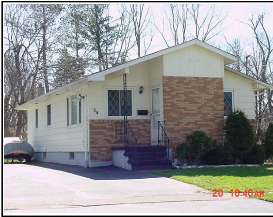
34 Prospect Ave 180200 84.006-4-58

Neighborhood: 200 Property Class: 210 - 1 Family Res Sale Date: 6/23/2023 Sale Price: $ 223,002 Prelim 2024 Land Asmt: $ 13,200 Prelim 2024 Asmt: $ 130,000 Building Style: Ranch Exterior Wall: Composition Year Built: 1974 Basement Type: Full Grade: Average Condition: Normal SFLA: 1,048 Sale Price/SFLA: $ 212.79 Number Bedrooms: 3 Number Baths: 1.0