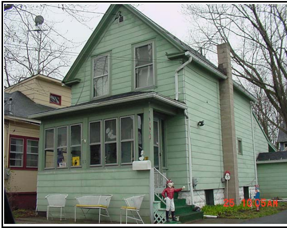
65 Columbia Ave 180200 84.035-1-34

Neighborhood: 300 Property Class: 210 - 1 Family Res Sale Date: 5/10/2022 Sale Price: $ 112,500 Prelim 2024 Land Asmt: $ 6,100 Prelim 2024 Asmt: $ 118,000 Building Style: Old Style Exterior Wall: Wood Year Built: 1900 Basement Type: Full Grade: Average Condition: Normal SFLA: 864 Sale Price/SFLA: $ 130.21 Number Bedrooms: 2 Number Baths: 1.0