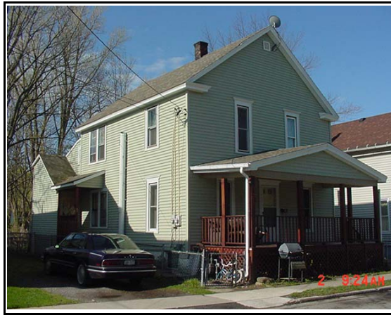
5 Watson St 180200 84.065-1-9

Neighborhood: 500 Property Class: 220 - 2 Family Res Sale Date: 1/5/2022 Sale Price: $ 100,000 Prelim 2024 Land Asmt: $ 15,300 Prelim 2024 Asmt: $ 109,000 Building Style: Old Style Exterior Wall: Alum/vinyl Year Built: 1900 Basement Type: Full Grade: Average Condition: Normal SFLA: 1,997 Sale Price/SFLA: $ 50.08 Number Bedrooms: 4 Number Baths: 2.0