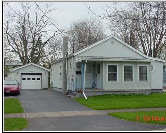
15 Elmwood Ave 180200 84.019-2-44

Neighborhood: 500 Property Class: 210 - 1 Family Res Sale Date: 11/1/2023 Sale Price: $ 54,000 Prelim 2024 Land Asmt: $ 12,600 Prelim 2024 Asmt: $ 85,000 Building Style: Ranch Exterior Wall: Alum/vinyl Year Built: 1950 Basement Type: Crawl Grade: Economy Condition: Poor SFLA: 720 Sale Price/SFLA: $ 75.00 Number Bedrooms: 2 Number Baths: 1.0