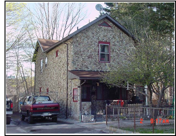
1 Thorp St 180200 84.057-1-6

Neighborhood: 500 Property Class: 210 - 1 Family Res Sale Date: 6/20/2022 Sale Price: $ 64,000 Prelim 2024 Land Asmt: $ 9,000 Prelim 2024 Asmt: $ 136,000 Building Style: Old Style Exterior Wall: Stone Year Built: 1900 Basement Type: Full Grade: Average Condition: Normal SFLA: 1,664 Sale Price/SFLA: $ 38.46 Number Bedrooms: 5 Number Baths: 1.5