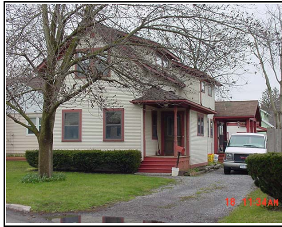
62 Lyon St 180200 84.024-1-68

Neighborhood: 300 Property Class: 210 - 1 Family Res Sale Date: 12/6/2022 Sale Price: $ 77,000 Prelim 2024 Land Asmt: $ 5,800 Prelim 2024 Asmt: $ 86,000 Building Style: Old Style Exterior Wall: Composition Year Built: 1890 Basement Type: Full Grade: Average Condition: Fair SFLA: 1,336 Sale Price/SFLA: $ 57.63 Number Bedrooms: 3 Number Baths: 1.5