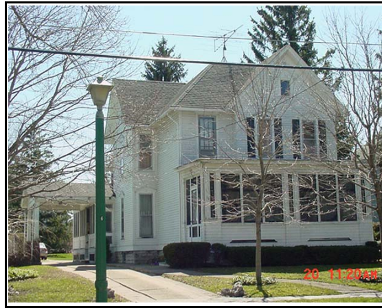
16 Ellicott Ave 180200 84.010-3-29

Neighborhood: 400 Property Class: 210 - 1 Family Res Sale Date: 10/6/2022 Sale Price: $ 245,000 Prelim 2024 Land Asmt: $ 29,800 Prelim 2024 Asmt: $ 256,000 Building Style: Old Style Exterior Wall: Wood Year Built: 1880 Basement Type: Full Grade: Average Condition: Normal SFLA: 2,601 Sale Price/SFLA: $ 94.19 Number Bedrooms: 4 Number Baths: 3.0