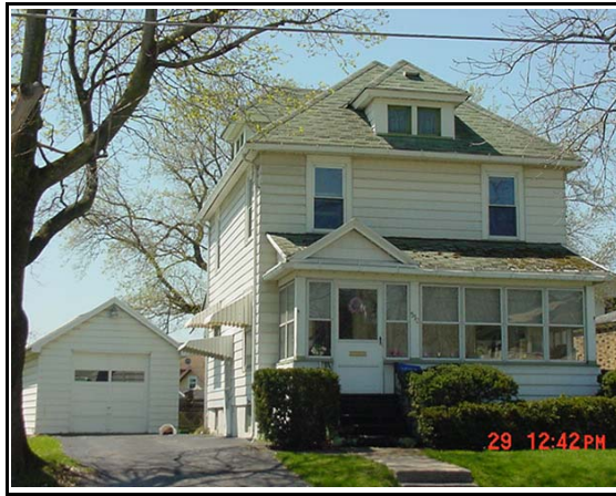
512 Ellicott St 180200 84.020-3-4

Neighborhood: 600 Property Class: 210 - 1 Family Res Sale Date: 7/21/2022 Sale Price: $ 159,793 Prelim 2024 Land Asmt: $ 15,100 Prelim 2024 Asmt: $ 167,000 Building Style: Old Style Exterior Wall: Composition Year Built: 1900 Basement Type: Partial Grade: Average Condition: Normal SFLA: 1,152 Sale Price/SFLA: $ 138.71 Number Bedrooms: 3 Number Baths: 1.0