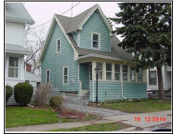
37 Montclair Ave 180200 84.031-2-4

Neighborhood: 300 Property Class: 210 - 1 Family Res Sale Date: 7/6/2023 Sale Price: $ 169,000 Prelim 2024 Land Asmt: $ 13,500 Prelim 2024 Asmt: $ 176,000 Building Style: Old Style Exterior Wall: Alum/vinyl Year Built: 1880 Basement Type: Full Grade: Average Condition: Normal SFLA: 1,155 Sale Price/SFLA: $ 146.32 Number Bedrooms: 3 Number Baths: 1.0