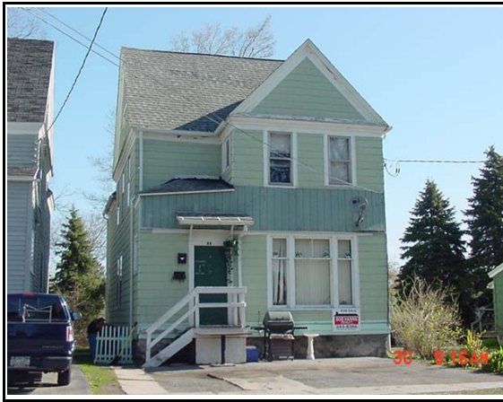
44 South Main St 180200 84.039-2-11

Neighborhood: 500 Property Class: 220 - 2 Family Res Sale Date: 12/15/2022 Sale Price: $ 70,000 Prelim 2024 Land Asmt: $ 8,600 Prelim 2024 Asmt: $ 92,000 Building Style: Old Style Exterior Wall: Alum/vinyl Year Built: 1900 Basement Type: Full Grade: Average Condition: Poor SFLA: 1,954 Sale Price/SFLA: $ 35.82 Number Bedrooms: 3 Number Baths: 2.0