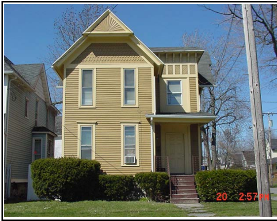
215 Washington Ave 180200 84.042-1-59

Neighborhood: 300 Property Class: 220 - 2 Family Res Sale Date: 9/7/2023 Sale Price: $ 90,000 Prelim 2024 Land Asmt: $ 8,300 Prelim 2024 Asmt: $ 107,000 Building Style: Old Style Exterior Wall: Wood Year Built: 1890 Basement Type: Full Grade: Average Condition: Poor SFLA: 1,986 Sale Price/SFLA: $ 45.32 Number Bedrooms: 5 Number Baths: 2.0