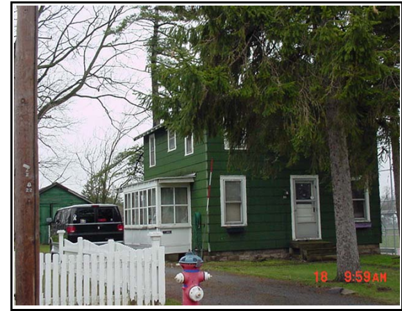
98 Union St 180200 71.018-1-68

Neighborhood: 200 Property Class: 210 - 1 Family Res Sale Date: 9/30/2022 Sale Price: $ 139,900 Prelim 2024 Land Asmt: $ 12,300 Prelim 2024 Asmt: $ 145,000 Building Style: Old Style Exterior Wall: Wood Year Built: 1930 Basement Type: Full Grade: Average Condition: Normal SFLA: 1,032 Sale Price/SFLA: $ 135.56 Number Bedrooms: 2 Number Baths: 1.0