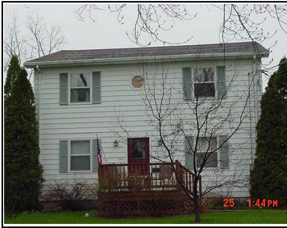
111-113 Vine St 180200 84.043-1-13.21

Neighborhood: 200 Property Class: 220 - 2 Family Res Sale Date: 8/19/2022 Sale Price: $ 171,500 Prelim 2024 Land Asmt: $ 20,100 Prelim 2024 Asmt: $ 193,000 Building Style: Colonial Exterior Wall: Alum/vinyl Year Built: 1985 Basement Type: Full Grade: Average Condition: Normal SFLA: 2,100 Sale Price/SFLA: $ 81.67 Number Bedrooms: 4 Number Baths: 2.0