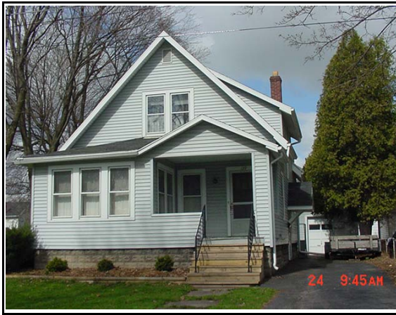
139 Tracy Ave 180200 84.026-1-14

Neighborhood: 300 Property Class: 210 - 1 Family Res Sale Date: 8/9/2022 Sale Price: $ 125,000 Prelim 2024 Land Asmt: $ 15,300 Prelim 2024 Asmt: $ 135,000 Building Style: Old Style Exterior Wall: Alum/vinyl Year Built: 1930 Basement Type: Full Grade: Average Condition: Fair SFLA: 1,560 Sale Price/SFLA: $ 80.13 Number Bedrooms: 3 Number Baths: 1.5