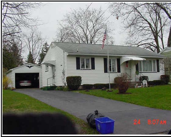
3 Douglas St 180200 71.082-1-45

Neighborhood: 200 Property Class: 210 - 1 Family Res Sale Date: 6/13/2022 Sale Price: $ 155,000 Prelim 2024 Land Asmt: $ 16,400 Prelim 2024 Asmt: $ 161,000 Building Style: Ranch Exterior Wall: Alum/vinyl Year Built: 1959 Basement Type: Full Grade: Average Condition: Normal SFLA: 1,026 Sale Price/SFLA: $ 151.07 Number Bedrooms: 2 Number Baths: 1.0