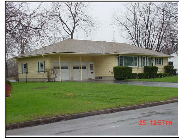
229 Vine St 180200 71.020-1-67

Neighborhood: 200 Property Class: 210 - 1 Family Res Sale Date: 3/9/2022 Sale Price: $ 212,700 Prelim 2024 Land Asmt: $ 18,500 Prelim 2024 Asmt: $ 217,000 Building Style: Ranch Exterior Wall: Wood Year Built: 1957 Basement Type: Full Grade: Average Condition: Normal SFLA: 1,412 Sale Price/SFLA: $ 150.64 Number Bedrooms: 2 Number Baths: 1.0