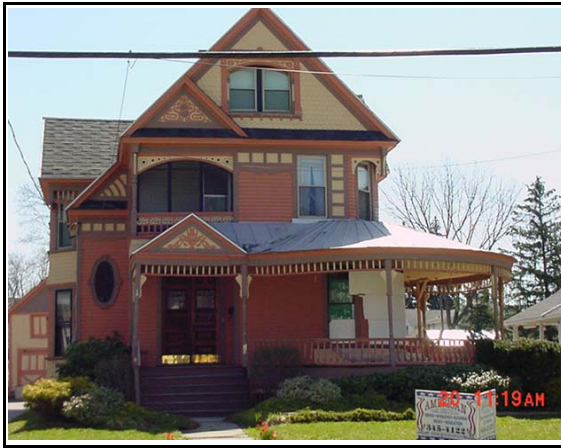
20 Ellicott Ave 180200 84.010-3-31

Neighborhood: 400 Property Class: 210 - 1 Family Res Sale Date: 10/6/2022 Sale Price: $ 245,000 Prelim 2024 Land Asmt: $ 29,800 Prelim 2024 Asmt: $ 256,000 Building Style: Old Style Exterior Wall: Wood Year Built: 1880 Basement Type: Full Grade: Average Condition: Normal SFLA: 2,601 Sale Price/SFLA: $ 94.19 Number Bedrooms: 4 Number Baths: 3.0