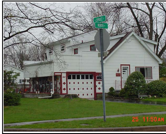
526 North St 180200 84.008-2-11

Neighborhood: 200 Property Class: 210 - 1 Family Res Sale Date: 2/4/2022 Sale Price: $ 259,900 Prelim 2024 Land Asmt: $ 23,000 Prelim 2024 Asmt: $ 280,000 Building Style: Cape Cod Exterior Wall: Alum/vinyl Year Built: 1950 Basement Type: Partial Grade: Average Condition: Good SFLA: 3,160 Sale Price/SFLA: $ 82.25 Number Bedrooms: 4 Number Baths: 2.0