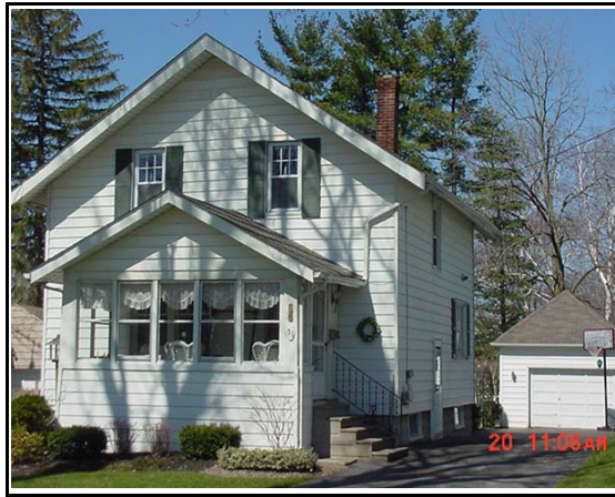
51 Prospect Ave 180200 84.024-1-10

Neighborhood: 200 Property Class: 210 - 1 Family Res Sale Date: 11/2/2023 Sale Price: $ 145,000 Prelim 2024 Land Asmt: $ 16,500 Prelim 2024 Asmt: $ 149,000 Building Style: Old Style Exterior Wall: Alum/vinyl Year Built: 1910 Basement Type: Full Grade: Average Condition: Normal SFLA: 1,208 Sale Price/SFLA: $ 120.03 Number Bedrooms: 3 Number Baths: 1.0