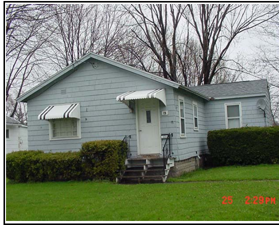
15-17 Chase Park 180200 84.051-1-12

Neighborhood: 700 Property Class: 210 - 1 Family Res Sale Date: 7/21/2023 Sale Price: $ 199,900 Prelim 2024 Land Asmt: $ 15,800 Prelim 2024 Asmt: $ 197,000 Building Style: Cape Cod Exterior Wall: Alum/vinyl Year Built: 1950 Basement Type: Full Grade: Average Condition: Normal SFLA: 1,097 Sale Price/SFLA: $ 182.22 Number Bedrooms: 2 Number Baths: 1.0