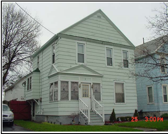
5 Margaret Pl 180200 84.051-2-30

Neighborhood: 700 Property Class: 210 - 1 Family Res Sale Date: 9/22/2023 Sale Price: $ 85,000 Prelim 2024 Land Asmt: $ 10,100 Prelim 2024 Asmt: $ 105,000 Building Style: Old Style Exterior Wall: Wood Year Built: 1870 Basement Type: Full Grade: Average Condition: Poor SFLA: 1,380 Sale Price/SFLA: $ 61.59 Number Bedrooms: 3 Number Baths: 1.5