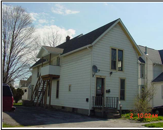
25 Central Ave 180200 84.057-1-22

Neighborhood: 500 Property Class: 230 - 3 Family Res Sale Date: 2/18/2022 Sale Price: $ 50,000 Prelim 2024 Land Asmt: $ 8,100 Prelim 2024 Asmt: $ 79,000 Building Style: Old Style Exterior Wall: Alum/vinyl Year Built: 1880 Basement Type: Full Grade: Average Condition: Normal SFLA: 1,966 Sale Price/SFLA: $ 25.43 Number Bedrooms: 6 Number Baths: 3.0