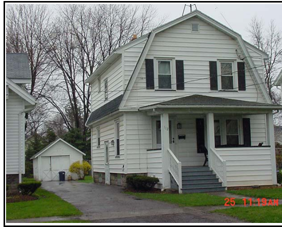
112 East Ave 180200 84.043-3-25

Neighborhood: 700 Property Class: 210 - 1 Family Res Sale Date: 3/11/2022 Sale Price: $ 131,000 Prelim 2024 Land Asmt: $ 14,700 Prelim 2024 Asmt: $ 133,000 Building Style: Old Style Exterior Wall: Wood Year Built: 1880 Basement Type: Full Grade: Average Condition: Normal SFLA: 1,120 Sale Price/SFLA: $ 116.96 Number Bedrooms: 3 Number Baths: 1.0