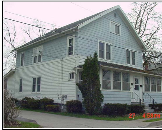
21 Colorado Ave 180200 84.075-1-2

Neighborhood: 600 Property Class: 210 - 1 Family Res Sale Date: 1/18/2022 Sale Price: $ 124,000 Prelim 2024 Land Asmt: $ 15,700 Prelim 2024 Asmt: $ 135,000 Building Style: Old Style Exterior Wall: Wood Year Built: 1890 Basement Type: Full Grade: Average Condition: Normal SFLA: 2,064 Sale Price/SFLA: $ 60.08 Number Bedrooms: 4 Number Baths: 2.0