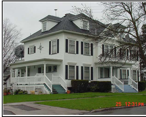
2 North St 180200 84.033-2-1

Neighborhood: 300 Property Class: 220 - 2 Family Res Sale Date: 2/19/2022 Sale Price: $ 90,000 Prelim 2024 Land Asmt: $ 12,000 Prelim 2024 Asmt: $ 118,000 Building Style: Old Style Exterior Wall: Alum/vinyl Year Built: 1885 Basement Type: Full Grade: Average Condition: Normal SFLA: 3,012 Sale Price/SFLA: $ 29.88 Number Bedrooms: 4 Number Baths: 2.0