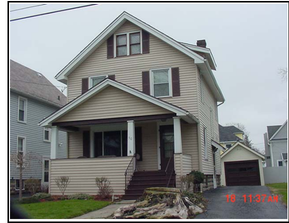
50 Lyon St 180200 84.024-1-59

Neighborhood: 300 Property Class: 210 - 1 Family Res Sale Date: 5/11/2022 Sale Price: $ 160,000 Prelim 2024 Land Asmt: $ 10,500 Prelim 2024 Asmt: $ 171,000 Building Style: Old Style Exterior Wall: Wood Year Built: 1910 Basement Type: Full Grade: Average Condition: Normal SFLA: 1,291 Sale Price/SFLA: $ 123.93 Number Bedrooms: 3 Number Baths: 1.0