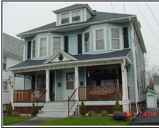
17 Ellsworth Ave 180200 84.034-3-30

Neighborhood: 300 Property Class: 220 - 2 Family Res Sale Date: 10/4/2022 Sale Price: $ 84,000 Prelim 2024 Land Asmt: $ 8,300 Prelim 2024 Asmt: $ 109,000 Building Style: Old Style Exterior Wall: Alum/vinyl Year Built: 1900 Basement Type: Full Grade: Average Condition: Normal SFLA: 2,150 Sale Price/SFLA: $ 39.07 Number Bedrooms: 6 Number Baths: 2.0