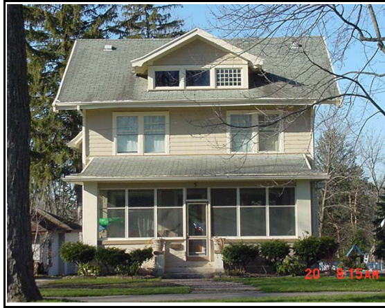
3 Richmond Ave 180200 84.006-4-4

Neighborhood: 300 Property Class: 210 - 1 Family Res Sale Date: 12/27/2022 Sale Price: $ 103,000 Prelim 2024 Land Asmt: $ 10,900 Prelim 2024 Asmt: $ 117,000 Building Style: Old Style Exterior Wall: Wood Year Built: 1900 Basement Type: Full Grade: Average Condition: Fair SFLA: 1,624 Sale Price/SFLA: $ 63.42 Number Bedrooms: 4 Number Baths: 1.0