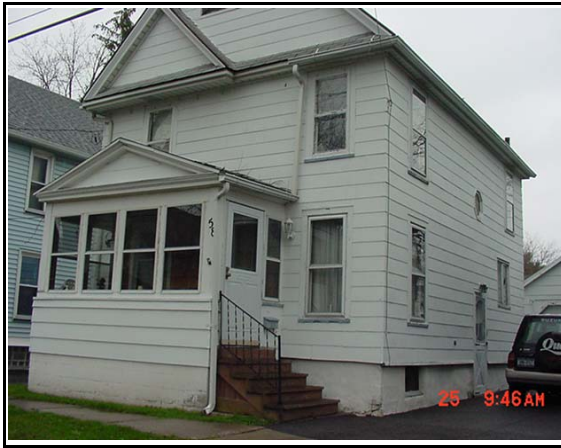
58 Columbia Ave 180200 84.035-1-29

Neighborhood: 300 Property Class: 210 - 1 Family Res Sale Date: 7/10/2023 Sale Price: $ 80,000 Prelim 2024 Land Asmt: $ 6,100 Prelim 2024 Asmt: $ 88,000 Building Style: Old Style Exterior Wall: Wood Year Built: 1900 Basement Type: Full Grade: Average Condition: Fair SFLA: 1,180 Sale Price/SFLA: $ 67.80 Number Bedrooms: 3 Number Baths: 1.0