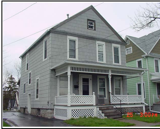
9 Margaret Pl 180200 84.051-2-28

Neighborhood: 700 Property Class: 210 - 1 Family Res Sale Date: 7/20/2022 Sale Price: $ 134,000 Prelim 2024 Land Asmt: $ 11,300 Prelim 2024 Asmt: $ 160,000 Building Style: Old Style Exterior Wall: Composition Year Built: 1900 Basement Type: Full Grade: Average Condition: Normal SFLA: 1,420 Sale Price/SFLA: $ 94.37 Number Bedrooms: 4 Number Baths: 1.5