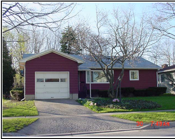
19 River St 180200 84.005-2-45

Neighborhood: 500 Property Class: 210 - 1 Family Res Sale Date: 10/31/2022 Sale Price: $ 159,900 Prelim 2024 Land Asmt: $ 15,200 Prelim 2024 Asmt: $ 152,000 Building Style: Ranch Exterior Wall: Wood Year Built: 1965 Basement Type: Full Grade: Average Condition: Normal SFLA: 1,292 Sale Price/SFLA: $ 123.76 Number Bedrooms: 2 Number Baths: 1.5