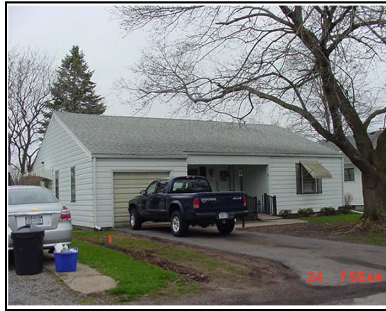
8 Douglas St 180200 71.082-1-58

Neighborhood: 200 Property Class: 210 - 1 Family Res Sale Date: 6/10/2022 Sale Price: $ 118,000 Prelim 2024 Land Asmt: $ 18,900 Prelim 2024 Asmt: $ 129,000 Building Style: Ranch Exterior Wall: Alum/vinyl Year Built: 1915 Basement Type: Partial Grade: Average Condition: Normal SFLA: 1,144 Sale Price/SFLA: $ 103.15 Number Bedrooms: 2 Number Baths: 1.0