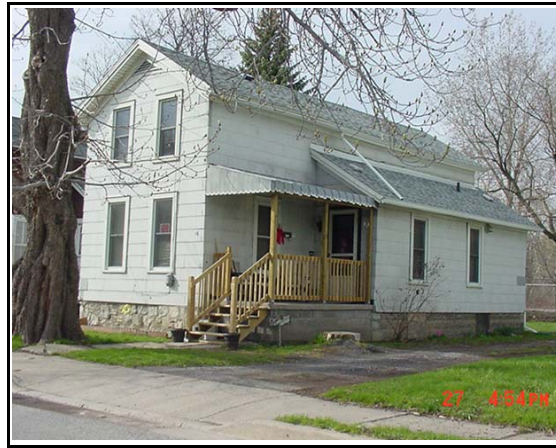
16 Colorado Ave 180200 84.067-1-5

Neighborhood: 600 Property Class: 210 - 1 Family Res Sale Date: 6/23/2022 Sale Price: $ 85,106 Prelim 2024 Land Asmt: $ 12,600 Prelim 2024 Asmt: $ 99,000 Building Style: Old Style Exterior Wall: Alum/vinyl Year Built: 1890 Basement Type: Full Grade: Average Condition: Normal SFLA: 1,024 Sale Price/SFLA: $ 83.11 Number Bedrooms: 2 Number Baths: 1.0