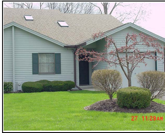
2 North Pointe Dr 180200 84.008-2-68

Neighborhood: 100 Property Class: 210 - 1 Family Res Sale Date: 7/12/2022 Sale Price: $ 204,000 Prelim 2024 Land Asmt: $ 9,900 Prelim 2024 Asmt: $ 215,000 Building Style: Town House Exterior Wall: Alum/vinyl Year Built: 2002 Basement Type: Full Grade: Average Condition: Good SFLA: 1,236 Sale Price/SFLA: $ 165.05 Number Bedrooms: 2 Number Baths: 2.0