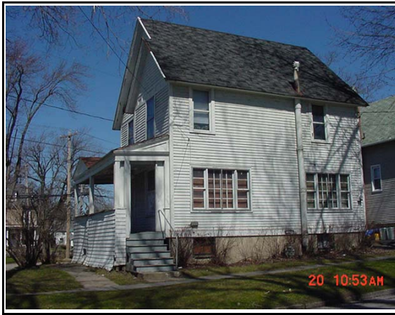
1 Prospect Ave 180200 84.032-1-35

Neighborhood: 200 Property Class: 210 - 1 Family Res Sale Date: 11/29/2022 Sale Price: $ 40,000 Prelim 2024 Land Asmt: $ 10,900 Prelim 2024 Asmt: $ 144,800 Building Style: Old Style Exterior Wall: Wood Year Built: 1900 Basement Type: Full Grade: Economy Condition: Poor SFLA: 1,124 Sale Price/SFLA: $ 35.59 Number Bedrooms: 3 Number Baths: 1.0