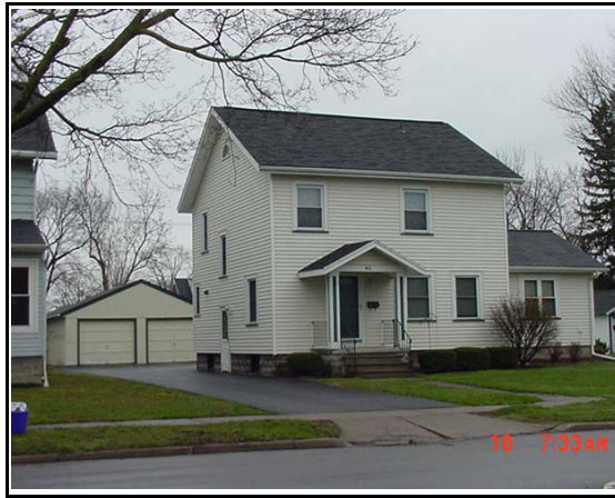
40 Redfield Pkwy 180200 84.005-1-66

Neighborhood: 400 Property Class: 210 - 1 Family Res Sale Date: 6/13/2022 Sale Price: $ 211,000 Prelim 2024 Land Asmt: $ 26,900 Prelim 2024 Asmt: $ 219,000 Building Style: Old Style Exterior Wall: Alum/vinyl Year Built: 1925 Basement Type: Full Grade: Average Condition: Normal SFLA: 1,635 Sale Price/SFLA: $ 129.05 Number Bedrooms: 3 Number Baths: 1.0