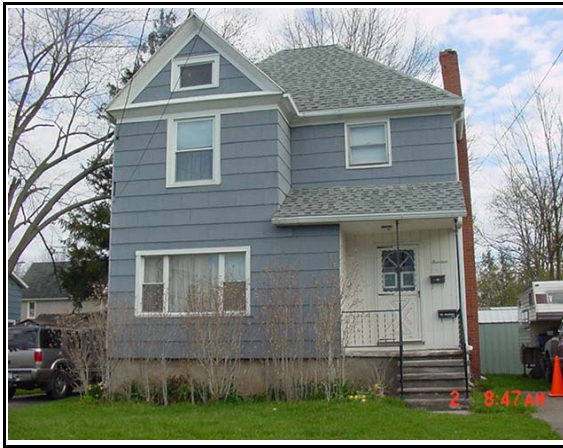
14 Morton Ave 180200 84.015-2-27

Neighborhood: 500 Property Class: 210 - 1 Family Res Sale Date: 2/13/2023 Sale Price: $ 139,900 Prelim 2024 Land Asmt: $ 13,100 Prelim 2024 Asmt: $ 142,000 Building Style: Old Style Exterior Wall: Wood Year Built: 1920 Basement Type: Full Grade: Average Condition: Normal SFLA: 1,312 Sale Price/SFLA: $ 106.63 Number Bedrooms: 4 Number Baths: 1.0