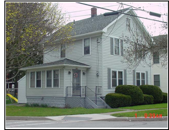
335 South Jackson St 180200 84.073-2-25

Neighborhood: 500 Property Class: 210 - 1 Family Res Sale Date: 4/5/2022 Sale Price: $ 149,000 Prelim 2024 Land Asmt: $ 12,900 Prelim 2024 Asmt: $ 129,000 Building Style: Old Style Exterior Wall: Alum/vinyl Year Built: 1895 Basement Type: Full Grade: Average Condition: Normal SFLA: 1,376 Sale Price/SFLA: $ 108.28 Number Bedrooms: 2 Number Baths: 1.5