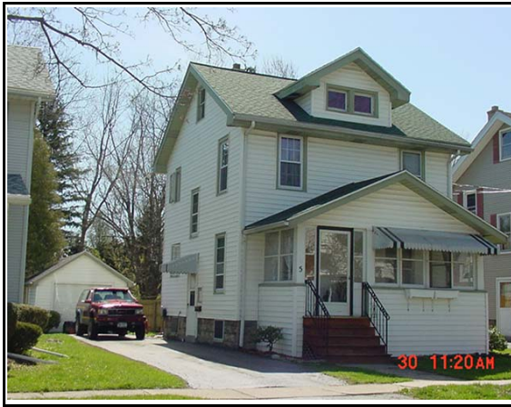
5 Brooklyn Ave 180200 84.047-2-69

Neighborhood: 500 Property Class: 210 - 1 Family Res Sale Date: 10/11/2022 Sale Price: $ 115,000 Prelim 2024 Land Asmt: $ 11,400 Prelim 2024 Asmt: $ 133,000 Building Style: Old Style Exterior Wall: Alum/vinyl Year Built: 1925 Basement Type: Full Grade: Average Condition: Good SFLA: 1,056 Sale Price/SFLA: $ 108.90 Number Bedrooms: 2 Number Baths: 1.0