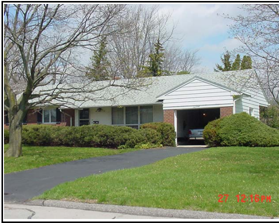
17 Fordham Dr 180200 85.009-1-37

Neighborhood: 200 Property Class: 210 - 1 Family Res Sale Date: 8/25/2022 Sale Price: $ 220,000 Prelim 2024 Land Asmt: $ 18,400 Prelim 2024 Asmt: $ 200,000 Building Style: Ranch Exterior Wall: Wood Year Built: 1963 Basement Type: Full Grade: Average Condition: Normal SFLA: 1,376 Sale Price/SFLA: $ 159.88 Number Bedrooms: 3 Number Baths: 1.5