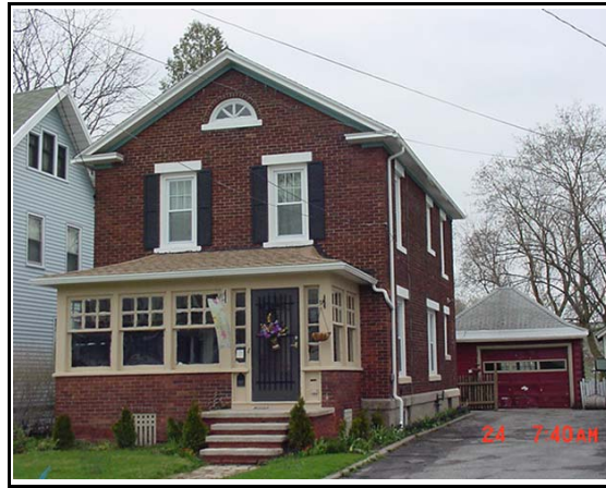
8 Norris Ave 180200 84.026-1-81.1

Neighborhood: 200 Property Class: 220 - 2 Family Res Sale Date: 11/17/2022 Sale Price: $ 130,000 Prelim 2024 Land Asmt: $ 11,000 Prelim 2024 Asmt: $ 113,000 Building Style: Old Style Exterior Wall: Alum/vinyl Year Built: 1910 Basement Type: Partial Grade: Average Condition: Fair SFLA: 1,748 Sale Price/SFLA: $ 74.37 Number Bedrooms: 3 Number Baths: 2.0