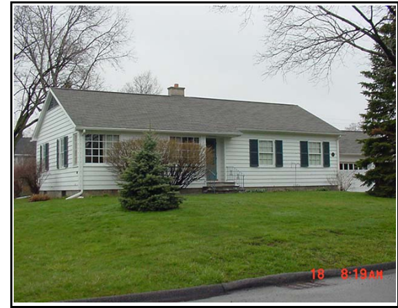
33 Bogue Ave 180200 84.005-1-40

Neighborhood: 400 Property Class: 210 - 1 Family Res Sale Date: 6/5/2023 Sale Price: $ 140,000 Prelim 2024 Land Asmt: $ 26,200 Prelim 2024 Asmt: $ 143,000 Building Style: Ranch Exterior Wall: Wood Year Built: 1951 Basement Type: Full Grade: Average Condition: Fair SFLA: 1,182 Sale Price/SFLA: $ 118.44 Number Bedrooms: 2 Number Baths: 1.0