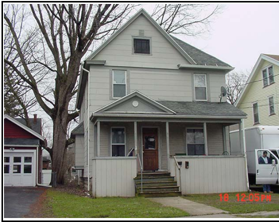
32 Lyon St 180200 84.031-2-36

Neighborhood: 300 Property Class: 220 - 2 Family Res Sale Date: 7/20/2023 Sale Price: $ 118,000 Prelim 2024 Land Asmt: $ 9,500 Prelim 2024 Asmt: $ 124,000 Building Style: Old Style Exterior Wall: Composition Year Built: 1900 Basement Type: Full Grade: Average Condition: Fair SFLA: 1,672 Sale Price/SFLA: $ 70.57 Number Bedrooms: 5 Number Baths: 2.0