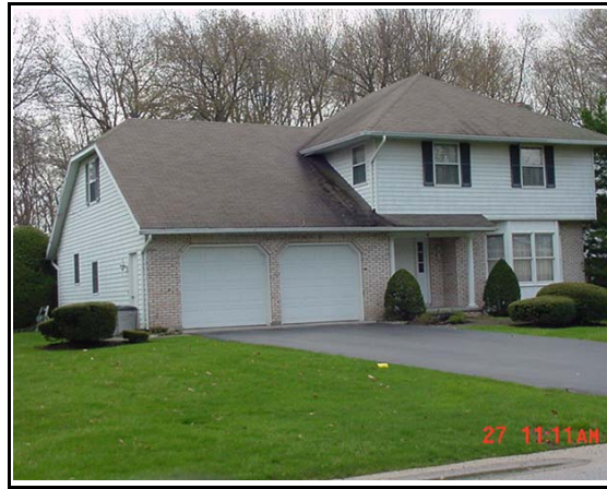
10 Belvedere Ln 180200 85.005-1-18

Neighborhood: 100 Property Class: 210 - 1 Family Res Sale Date: 8/25/2023 Sale Price: $ 300,000 Prelim 2024 Land Asmt: $ 32,800 Prelim 2024 Asmt: $ 315,000 Building Style: Colonial Exterior Wall: Wood Year Built: 1971 Basement Type: Full Grade: Average Condition: Normal SFLA: 2,280 Sale Price/SFLA: $ 131.58 Number Bedrooms: 4 Number Baths: 2.5