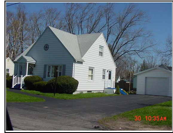
23 Adams St 180200 84.046-1-6

Neighborhood: 500 Property Class: 220 - 2 Family Res Sale Date: 8/24/2022 Sale Price: $ 135,000 Prelim 2024 Land Asmt: $ 14,500 Prelim 2024 Asmt: $ 162,000 Building Style: Cape Cod Exterior Wall: Alum/vinyl Year Built: 1952 Basement Type: Full Grade: Average Condition: Fair SFLA: 1,326 Sale Price/SFLA: $ 101.81 Number Bedrooms: 2 Number Baths: 2.0