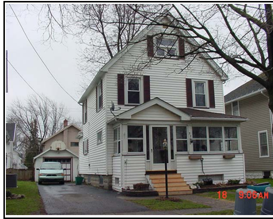
52 Union St 180200 84.023-1-11

Neighborhood: 300 Property Class: 210 - 1 Family Res Sale Date: 2/25/2022 Sale Price: $ 88,740 Prelim 2024 Land Asmt: $ 5,500 Prelim 2024 Asmt: $ 101,000 Building Style: Old Style Exterior Wall: Wood Year Built: 1900 Basement Type: Full Grade: Average Condition: Normal SFLA: 1,268 Sale Price/SFLA: $ 69.98 Number Bedrooms: 3 Number Baths: 1.0