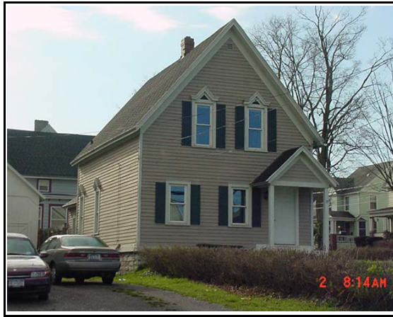
119 Jackson St 180200 84.065-1-34