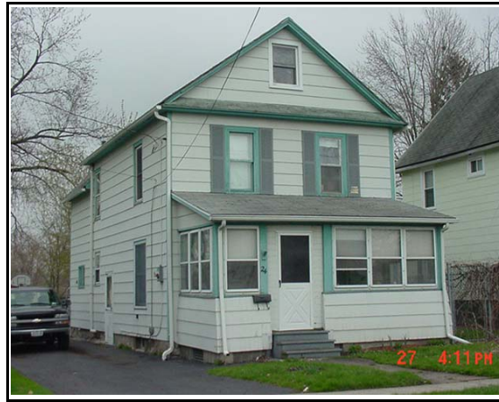
24 Buell St 180200 84.084-1-41

Neighborhood: 600 Property Class: 220 - 2 Family Res Sale Date: 11/30/2023 Sale Price: $ 130,000 Prelim 2024 Land Asmt: $ 21,700 Prelim 2024 Asmt: $ 142,000 Building Style: Old Style Exterior Wall: Alum/vinyl Year Built: 1900 Basement Type: Full Grade: Average Condition: Fair SFLA: 1,616 Sale Price/SFLA: $ 80.45 Number Bedrooms: 3 Number Baths: 2.0