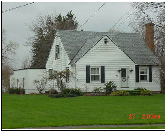
42 Clinton St 180200 85.009-1-11

Neighborhood: 200 Property Class: 210 - 1 Family Res Sale Date: 11/7/2022 Sale Price: $ 198,500 Prelim 2024 Land Asmt: $ 23,000 Prelim 2024 Asmt: $ 213,000 Building Style: Cape Cod Exterior Wall: Alum/vinyl Year Built: 1954 Basement Type: Full Grade: Average Condition: Normal SFLA: 1,424 Sale Price/SFLA: $ 139.40 Number Bedrooms: 3 Number Baths: 1.5