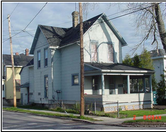
110 Jackson St 180200 84.057-1-36

Neighborhood: 500 Property Class: 220 - 2 Family Res Sale Date: 1/10/2023 Sale Price: $ 78,000 Prelim 2024 Land Asmt: $ 8,700 Prelim 2024 Asmt: $ 74,000 Building Style: Old Style Exterior Wall: Wood Year Built: 1880 Basement Type: Full Grade: Average Condition: Fair SFLA: 1,613 Sale Price/SFLA: $ 48.36 Number Bedrooms: 3 Number Baths: 2.0