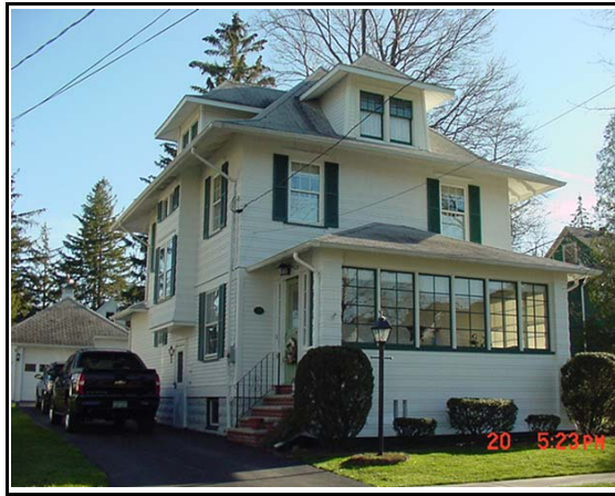
2 Hart St 180200 84.025-1-2

Neighborhood: 200 Property Class: 210 - 1 Family Res Sale Date: 9/12/2023 Sale Price: $ 215,000 Prelim 2024 Land Asmt: $ 16,200 Prelim 2024 Asmt: $ 213,000 Building Style: Old Style Exterior Wall: Wood Year Built: 1915 Basement Type: Full Grade: Average Condition: Good SFLA: 1,575 Sale Price/SFLA: $ 136.51 Number Bedrooms: 4 Number Baths: 2.5