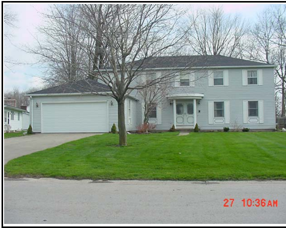
403 Garden Dr 180200 85.005-1-35

Neighborhood: 100 Property Class: 210 - 1 Family Res Sale Date: 7/29/2022 Sale Price: $ 335,000 Prelim 2024 Land Asmt: $ 31,100 Prelim 2024 Asmt: $ 354,000 Building Style: Colonial Exterior Wall: Alum/vinyl Year Built: 1978 Basement Type: Full Grade: Average Condition: Normal SFLA: 2,800 Sale Price/SFLA: $ 119.64 Number Bedrooms: 4 Number Baths: 2.5