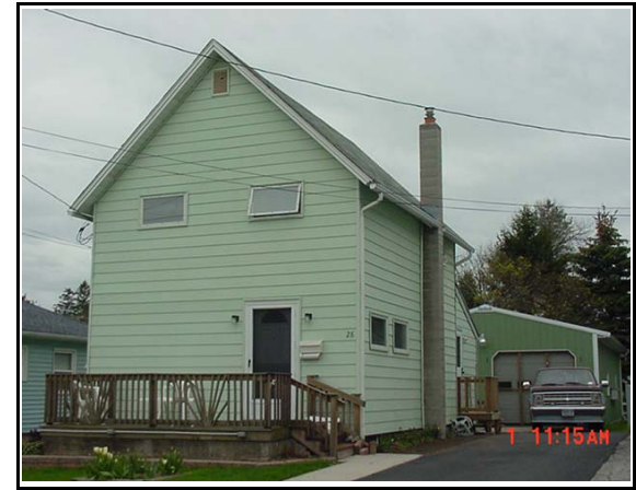
28 Williams St 180200 84.020-2-52

Neighborhood: 500 Property Class: 210 - 1 Family Res Sale Date: 3/4/2022 Sale Price: $ 58,500 Prelim 2024 Land Asmt: $ 7,400 Prelim 2024 Asmt: $ 64,000 Building Style: Old Style Exterior Wall: Alum/vinyl Year Built: 1900 Basement Type: Full Grade: Average Condition: Normal SFLA: 1,024 Sale Price/SFLA: $ 57.13 Number Bedrooms: 3 Number Baths: 1.0