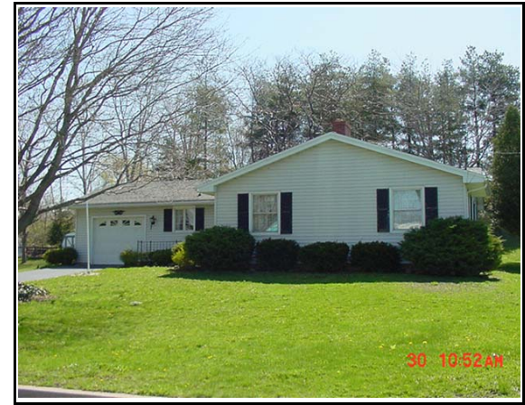
43-45 Roosevelt Ave 180200 84.009-4-23

Neighborhood: 500 Property Class: 210 - 1 Family Res Sale Date: 10/26/2022 Sale Price: $ 121,500 Prelim 2024 Land Asmt: $ 21,800 Prelim 2024 Asmt: $ 154,000 Building Style: Ranch Exterior Wall: Alum/vinyl Year Built: 1954 Basement Type: Full Grade: Economy Condition: Fair SFLA: 1,305 Sale Price/SFLA: $ 93.10 Number Bedrooms: 3 Number Baths: 1.0