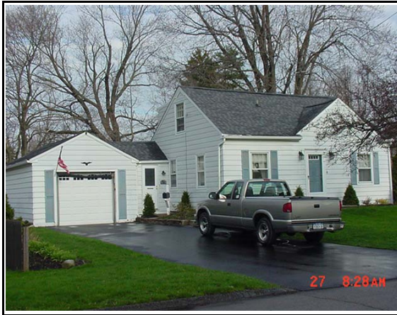
39 Trumbull Pkwy 180200 84.051-2-7

Neighborhood: 700 Property Class: 210 - 1 Family Res Sale Date: 7/21/2023 Sale Price: $ 199,900 Prelim 2024 Land Asmt: $ 15,800 Prelim 2024 Asmt: $ 197,000 Building Style: Cape Cod Exterior Wall: Alum/vinyl Year Built: 1950 Basement Type: Full Grade: Average Condition: Normal SFLA: 1,097 Sale Price/SFLA: $ 182.22 Number Bedrooms: 2 Number Baths: 1.0