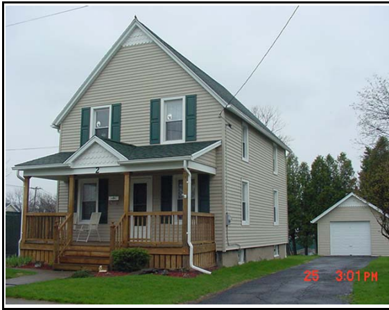
2 Margaret Pl 180200 84.012-3-64

Neighborhood: 700 Property Class: 210 - 1 Family Res Sale Date: 3/11/2022 Sale Price: $ 131,000 Prelim 2024 Land Asmt: $ 14,700 Prelim 2024 Asmt: $ 133,000 Building Style: Old Style Exterior Wall: Wood Year Built: 1880 Basement Type: Full Grade: Average Condition: Normal SFLA: 1,120 Sale Price/SFLA: $ 116.96 Number Bedrooms: 3 Number Baths: 1.0