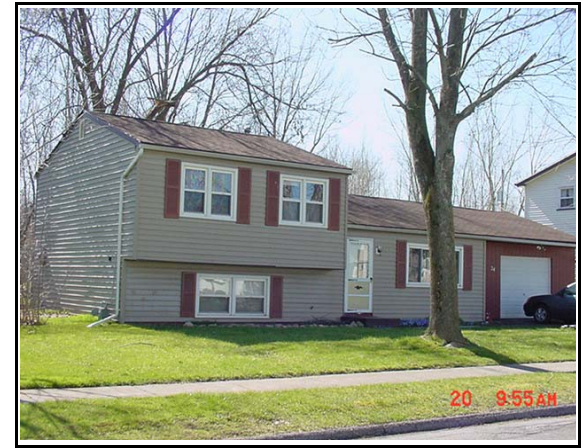
24 Gateway Dr 180200 71.014-2-11

Neighborhood: 200 Property Class: 210 - 1 Family Res Sale Date: 7/31/2023 Sale Price: $ 180,000 Prelim 2024 Land Asmt: $ 17,700 Prelim 2024 Asmt: $ 191,000 Building Style: Split Level Exterior Wall: Composition Year Built: 1970 Basement Type: Partial Grade: Average Condition: Normal SFLA: 1,280 Sale Price/SFLA: $ 140.63 Number Bedrooms: 3 Number Baths: 1.0