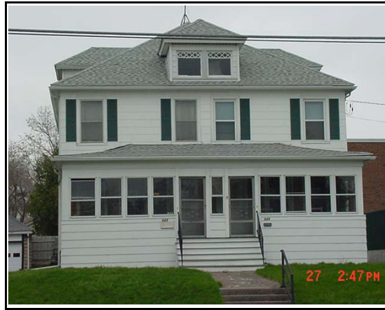
525 East Main St 180200 84.012-3-56

Neighborhood: 700 Property Class: 210 - 1 Family Res Sale Date: 7/28/2023 Sale Price: $ 260,000 Prelim 2024 Land Asmt: $ 17,000 Prelim 2024 Asmt: $ 261,000 Building Style: Old Style Exterior Wall: Wood Year Built: 1925 Basement Type: Full Grade: Average Condition: Normal SFLA: 2,336 Sale Price/SFLA: $ 111.30 Number Bedrooms: 4 Number Baths: 2.0