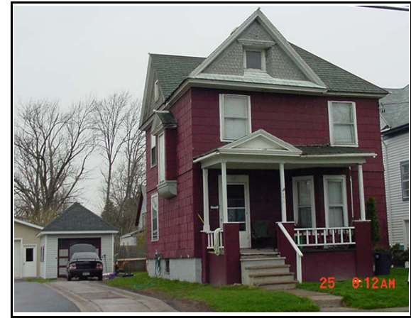
141 Ross St 180200 84.034-3-24

Neighborhood: 300 Property Class: 210 - 1 Family Res Sale Date: 11/4/2022 Sale Price: $ 159,900 Prelim 2024 Land Asmt: $ 8,100 Prelim 2024 Asmt: $ 161,000 Building Style: Old Style Exterior Wall: Alum/vinyl Year Built: 1900 Basement Type: Full Grade: Average Condition: Normal SFLA: 1,416 Sale Price/SFLA: $ 112.92 Number Bedrooms: 4 Number Baths: 2.0