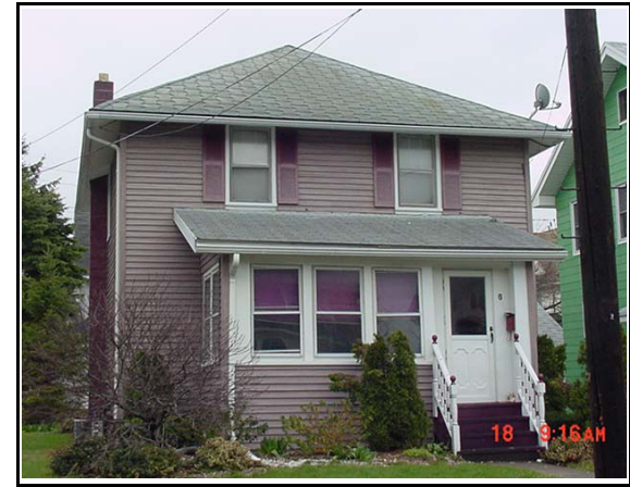
6 Union St 180200 84.031-1-38

Neighborhood: 300 Property Class: 210 - 1 Family Res Sale Date: 8/23/2023 Sale Price: $ 106,000 Prelim 2024 Land Asmt: $ 9,000 Prelim 2024 Asmt: $ 118,000 Building Style: Old Style Exterior Wall: Composition Year Built: 1924 Basement Type: Full Grade: Average Condition: Fair SFLA: 1,248 Sale Price/SFLA: $ 84.94 Number Bedrooms: 3 Number Baths: 1.0