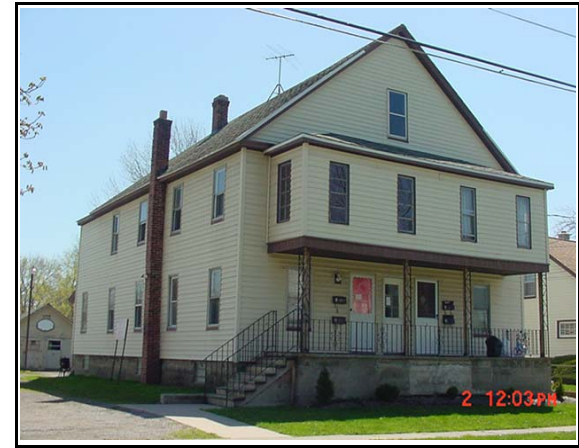
211-215 Liberty St 180200 84.074-1-50

Neighborhood: 500 Property Class: 210 - 1 Family Res Sale Date: 6/29/2023 Sale Price: $ 84,100 Prelim 2024 Land Asmt: $ 14,300 Prelim 2024 Asmt: $ 84,000 Building Style: Old Style Exterior Wall: Alum/vinyl Year Built: 1880 Basement Type: Full Grade: Average Condition: Poor SFLA: 1,295 Sale Price/SFLA: $ 64.94 Number Bedrooms: 2 Number Baths: 1.5