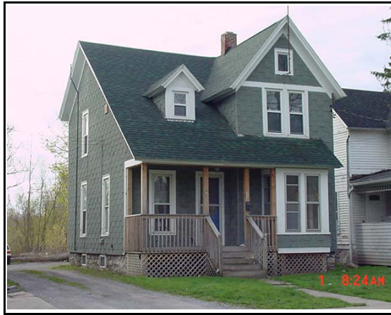
33 Walnut St 180200 84.056-1-8

Neighborhood: 500 Property Class: 210 - 1 Family Res Sale Date: 1/19/2022 Sale Price: $ 87,000 Prelim 2024 Land Asmt: $ 11,700 Prelim 2024 Asmt: $ 102,000 Building Style: Old Style Exterior Wall: Alum/vinyl Year Built: 1885 Basement Type: Full Grade: Average Condition: Normal SFLA: 1,336 Sale Price/SFLA: $ 65.12 Number Bedrooms: 3 Number Baths: 1.5