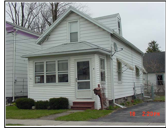
4 Holland Ave 180200 84.039-2-28

Neighborhood: 300 Property Class: 210 - 1 Family Res Sale Date: 3/18/2022 Sale Price: $ 191,000 Prelim 2024 Land Asmt: $ 9,600 Prelim 2024 Asmt: $ 212,000 Building Style: Cape Cod Exterior Wall: Brick Year Built: 1945 Basement Type: Full Grade: Average Condition: Normal SFLA: 1,774 Sale Price/SFLA: $ 107.67 Number Bedrooms: 3 Number Baths: 1.0