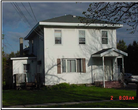
108 Jackson St 180200 84.057-1-35

Neighborhood: 500 Property Class: 210 - 1 Family Res Sale Date: 2/6/2023 Sale Price: $ 100,000 Prelim 2024 Land Asmt: $ 17,100 Prelim 2024 Asmt: $ 97,000 Building Style: Old Style Exterior Wall: Alum/vinyl Year Built: 1870 Basement Type: Partial Grade: Economy Condition: Poor SFLA: 2,569 Sale Price/SFLA: $ 38.93 Number Bedrooms: 5 Number Baths: 3.5