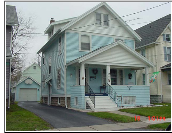
53 Montclair Ave 180200 84.024-1-51

Neighborhood: 300 Property Class: 210 - 1 Family Res Sale Date: 1/26/2022 Sale Price: $ 129,900 Prelim 2024 Land Asmt: $ 7,800 Prelim 2024 Asmt: $ 136,000 Building Style: Old Style Exterior Wall: Alum/vinyl Year Built: 1925 Basement Type: Full Grade: Average Condition: Normal SFLA: 1,196 Sale Price/SFLA: $ 108.61 Number Bedrooms: 3 Number Baths: 1.0