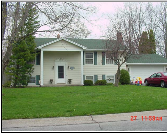
5 Hillside Dr 180200 84.012-2-49

Neighborhood: 100 Property Class: 210 - 1 Family Res Sale Date: 3/3/2023 Sale Price: $ 220,000 Prelim 2024 Land Asmt: $ 29,700 Prelim 2024 Asmt: $ 235,000 Building Style: R. Ranch Exterior Wall: Alum/vinyl Year Built: 1968 Basement Type: Full Grade: Average Condition: Normal SFLA: 1,911 Sale Price/SFLA: $ 115.12 Number Bedrooms: 4 Number Baths: 2.0