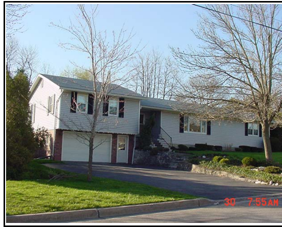
47 River St 180200 84.009-2-68

Neighborhood: 500 Property Class: 210 - 1 Family Res Sale Date: 3/24/2022 Sale Price: $ 247,000 Prelim 2024 Land Asmt: $ 16,200 Prelim 2024 Asmt: $ 209,000 Building Style: Split Level Exterior Wall: Alum/vinyl Year Built: 1975 Basement Type: Full Grade: Average Condition: Normal SFLA: 2,000 Sale Price/SFLA: $ 123.50 Number Bedrooms: 3 Number Baths: 1.0