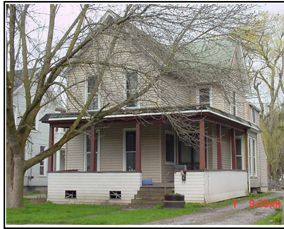
16 Walnut St 180200 84.048-1-44

Neighborhood: 500 Property Class: 210 - 1 Family Res Sale Date: 1/13/2022 Sale Price: $ 160,000 Prelim 2024 Land Asmt: $ 14,500 Prelim 2024 Asmt: $ 167,000 Building Style: Old Style Exterior Wall: Alum/vinyl Year Built: 1924 Basement Type: Full Grade: Average Condition: Normal SFLA: 2,030 Sale Price/SFLA: $ 78.82 Number Bedrooms: 5 Number Baths: 2.0