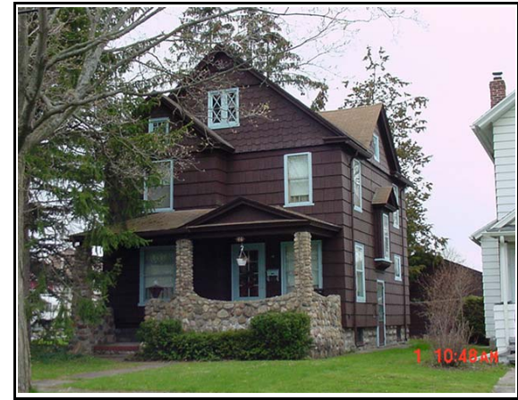
46 Clifton Ave 180200 84.020-2-27

Neighborhood: 500 Property Class: 220 - 2 Family Res Sale Date: 3/31/2022 Sale Price: $ 89,994 Prelim 2024 Land Asmt: $ 5,600 Prelim 2024 Asmt: $ 86,000 Building Style: Old Style Exterior Wall: Alum/vinyl Year Built: 1890 Basement Type: Full Grade: Average Condition: Normal SFLA: 1,248 Sale Price/SFLA: $ 72.11 Number Bedrooms: 4 Number Baths: 2.0