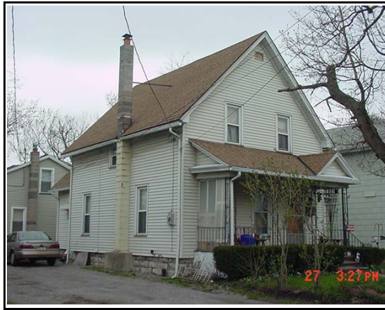
10 South Spruce St 180200 84.059-2-21

Neighborhood: 600 Property Class: 210 - 1 Family Res Sale Date: 7/13/2023 Sale Price: $ 129,000 Prelim 2024 Land Asmt: $ 11,300 Prelim 2024 Asmt: $ 135,000 Building Style: Old Style Exterior Wall: Wood Year Built: 1890 Basement Type: Full Grade: Average Condition: Fair SFLA: 1,268 Sale Price/SFLA: $ 101.74 Number Bedrooms: 5 Number Baths: 2.0