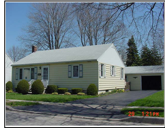
11 Linwood Ave 180200 84.020-3-40

Neighborhood: 500 Property Class: 210 - 1 Family Res Sale Date: 6/22/2022 Sale Price: $ 103,500 Prelim 2024 Land Asmt: $ 14,700 Prelim 2024 Asmt: $ 142,000 Building Style: Ranch Exterior Wall: Wood Year Built: 1946 Basement Type: Full Grade: Economy Condition: Normal SFLA: 932 Sale Price/SFLA: $ 111.05 Number Bedrooms: 2 Number Baths: 2.0