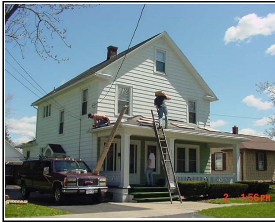
233 Swan St 180200 84.082-2-52

Neighborhood: 500 Property Class: 220 - 2 Family Res Sale Date: 11/21/2023 Sale Price: $ 105,000 Prelim 2024 Land Asmt: $ 7,700 Prelim 2024 Asmt: $ 108,000 Building Style: Old Style Exterior Wall: Alum/vinyl Year Built: 1890 Basement Type: Full Grade: Average Condition: Fair SFLA: 1,772 Sale Price/SFLA: $ 59.26 Number Bedrooms: 4 Number Baths: 2.0