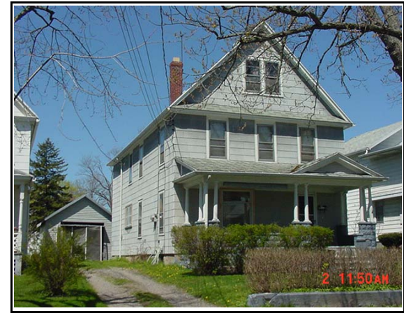
132 Liberty St 180200 84.066-1-19

Neighborhood: 500 Property Class: 220 - 2 Family Res Sale Date: 1/12/2023 Sale Price: $ 85,000 Prelim 2024 Land Asmt: $ 12,200 Prelim 2024 Asmt: $ 94,000 Building Style: Old Style Exterior Wall: Alum/vinyl Year Built: 1900 Basement Type: Full Grade: Average Condition: Poor SFLA: 2,090 Sale Price/SFLA: $ 40.67 Number Bedrooms: 3 Number Baths: 2.0