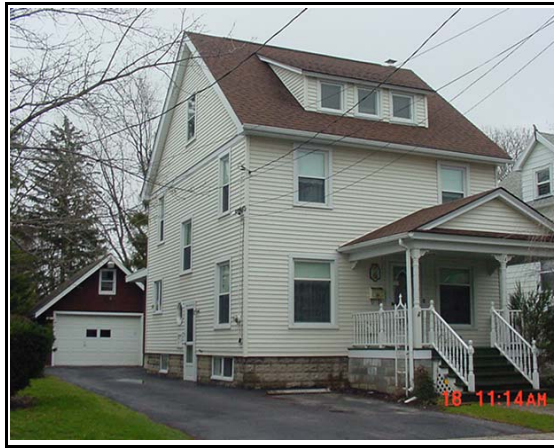
14 Vernon Ave 180200 84.006-3-51

Neighborhood: 200 Property Class: 210 - 1 Family Res Sale Date: 8/15/2023 Sale Price: $ 120,000 Prelim 2024 Land Asmt: $ 15,300 Prelim 2024 Asmt: $ 130,000 Building Style: Old Style Exterior Wall: Alum/vinyl Year Built: 1905 Basement Type: Full Grade: Average Condition: Normal SFLA: 1,628 Sale Price/SFLA: $ 73.71 Number Bedrooms: 4 Number Baths: 1.5