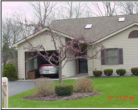
16 North Pointe Dr 180200 84.008-2-75

Neighborhood: 100 Property Class: 210 - 1 Family Res Sale Date: 1/20/2022 Sale Price: $ 189,900 Prelim 2024 Land Asmt: $ 4,500 Prelim 2024 Asmt: $ 182,000 Building Style: Town House Exterior Wall: Alum/vinyl Year Built: 1994 Basement Type: Full Grade: Average Condition: Normal SFLA: 1,236 Sale Price/SFLA: $ 153.64 Number Bedrooms: 2 Number Baths: 2.0