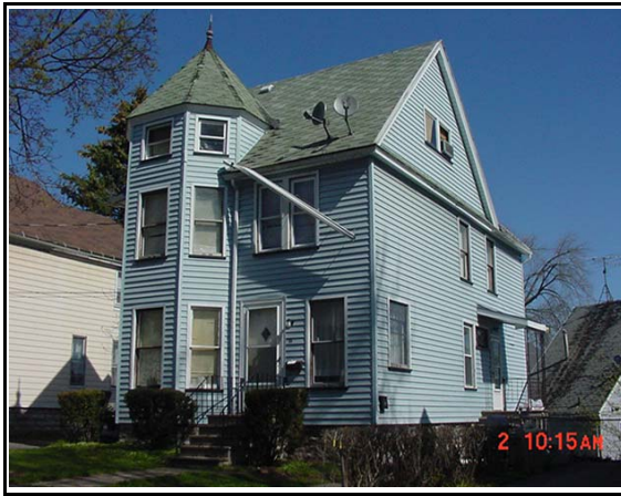
15 Highland Park 180200 84.065-1-26

Neighborhood: 500 Property Class: 220 - 2 Family Res Sale Date: 11/21/2023 Sale Price: $ 105,000 Prelim 2024 Land Asmt: $ 7,700 Prelim 2024 Asmt: $ 108,000 Building Style: Old Style Exterior Wall: Alum/vinyl Year Built: 1890 Basement Type: Full Grade: Average Condition: Fair SFLA: 1,772 Sale Price/SFLA: $ 59.26 Number Bedrooms: 4 Number Baths: 2.0