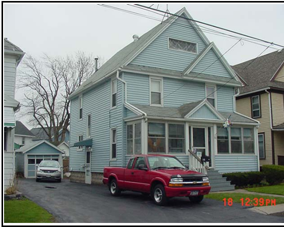
52 Montclair Ave 180200 84.024-1-44

Neighborhood: 300 Property Class: 210 - 1 Family Res Sale Date: 5/30/2023 Sale Price: $ 125,000 Prelim 2024 Land Asmt: $ 8,400 Prelim 2024 Asmt: $ 127,000 Building Style: Old Style Exterior Wall: Alum/vinyl Year Built: 1910 Basement Type: Full Grade: Average Condition: Normal SFLA: 1,410 Sale Price/SFLA: $ 88.65 Number Bedrooms: 4 Number Baths: 1.5