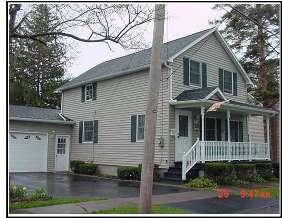
44 Columbia Ave 180200 84.035-1-25

Neighborhood: 300 Property Class: 210 - 1 Family Res Sale Date: 9/2/2022 Sale Price: $ 170,000 Prelim 2024 Land Asmt: $ 14,300 Prelim 2024 Asmt: $ 187,000 Building Style: Old Style Exterior Wall: Alum/vinyl Year Built: 1927 Basement Type: Full Grade: Average Condition: Normal SFLA: 1,560 Sale Price/SFLA: $ 108.97 Number Bedrooms: 3 Number Baths: 1.0