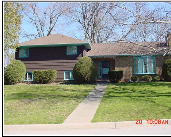
1 Pickthorn Dr 180200 71.018-3-57

Neighborhood: 200 Property Class: 210 - 1 Family Res Sale Date: 6/21/2023 Sale Price: $ 235,000 Prelim 2024 Land Asmt: $ 17,500 Prelim 2024 Asmt: $ 233,000 Building Style: Split Level Exterior Wall: Alum/vinyl Year Built: 1972 Basement Type: Partial Grade: Average Condition: Normal SFLA: 1,557 Sale Price/SFLA: $ 150.93 Number Bedrooms: 3 Number Baths: 1.0