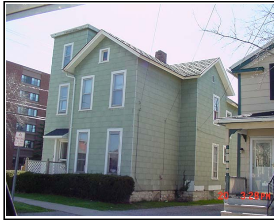
101 State St 180200 84.041-1-38

Neighborhood: 700 Property Class: 210 - 1 Family Res Sale Date: 11/8/2022 Sale Price: $ 165,300 Prelim 2024 Land Asmt: $ 13,800 Prelim 2024 Asmt: $ 165,000 Building Style: Old Style Exterior Wall: Alum/vinyl Year Built: 1890 Basement Type: Full Grade: Average Condition: Normal SFLA: 1,732 Sale Price/SFLA: $ 95.44 Number Bedrooms: 4 Number Baths: 2.0