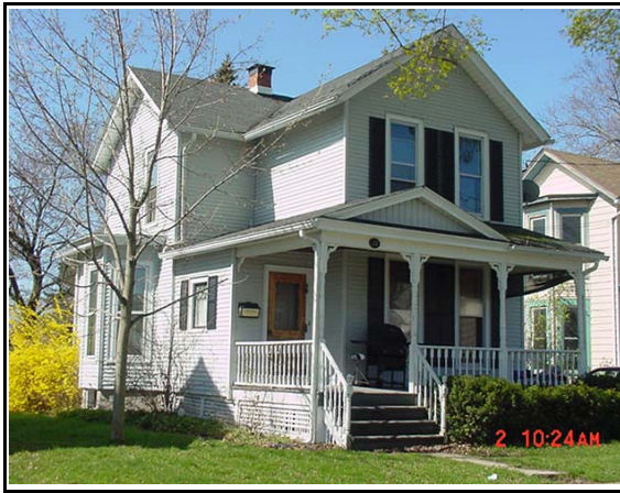
22 Wood St 180200 84.065-2-16

Neighborhood: 500 Property Class: 210 - 1 Family Res Sale Date: 11/14/2022 Sale Price: $ 75,000 Prelim 2024 Land Asmt: $ 11,400 Prelim 2024 Asmt: $ 95,000 Building Style: Old Style Exterior Wall: Alum/vinyl Year Built: 1890 Basement Type: Full Grade: Average Condition: Fair SFLA: 1,352 Sale Price/SFLA: $ 55.47 Number Bedrooms: 2 Number Baths: 1.0