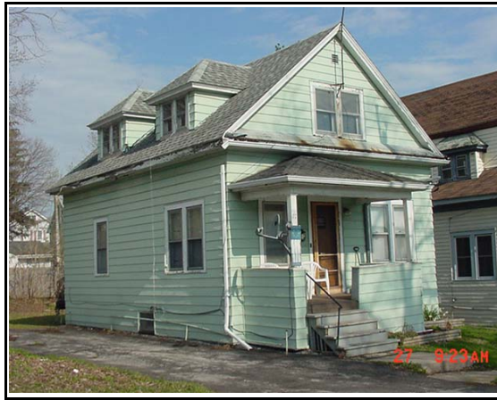
17 North Spruce St 180200 84.051-2-26

Neighborhood: 700 Property Class: 210 - 1 Family Res Sale Date: 5/26/2022 Sale Price: $ 17,500 Prelim 2024 Land Asmt: $ 13,200 Prelim 2024 Asmt: $ 57,000 Building Style: Old Style Exterior Wall: Alum/vinyl Year Built: 1900 Basement Type: Crawl Grade: Average Condition: Normal SFLA: 957 Sale Price/SFLA: $ 18.29 Number Bedrooms: 2 Number Baths: 1.0