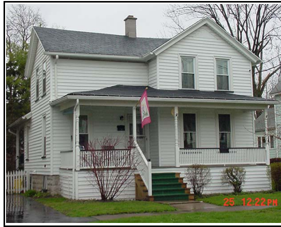
120 North St 180200 84.034-1-17

Neighborhood: 300 Property Class: 210 - 1 Family Res Sale Date: 9/29/2022 Sale Price: $ 107,000 Prelim 2024 Land Asmt: $ 9,000 Prelim 2024 Asmt: $ 137,000 Building Style: Old Style Exterior Wall: Alum/vinyl Year Built: 1910 Basement Type: Full Grade: Average Condition: Fair SFLA: 1,440 Sale Price/SFLA: $ 74.31 Number Bedrooms: 3 Number Baths: 1.5