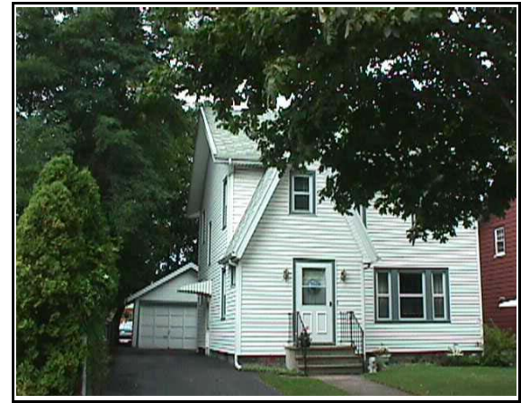
1 Woodrow Rd 180200 84.005-1-27

Neighborhood: 400 Property Class: 210 - 1 Family Res Sale Date: 7/10/2023 Sale Price: $ 357,100 Prelim 2024 Land Asmt: $ 28,000 Prelim 2024 Asmt: $ 357,000 Building Style: Colonial Exterior Wall: Alum/vinyl Year Built: 1955 Basement Type: Full Grade: Average Condition: Normal SFLA: 2,772 Sale Price/SFLA: $ 128.82 Number Bedrooms: 4 Number Baths: 1.5