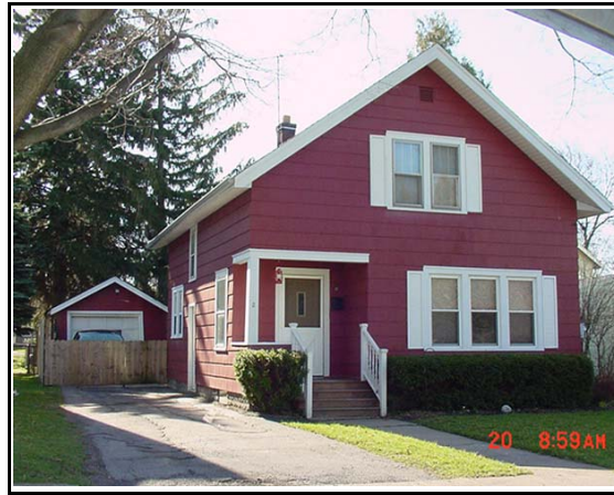
2 Verona Ave 180200 84.006-2-43

Neighborhood: 200 Property Class: 210 - 1 Family Res Sale Date: 11/10/2022 Sale Price: $ 135,000 Prelim 2024 Land Asmt: $ 15,200 Prelim 2024 Asmt: $ 139,000 Building Style: Old Style Exterior Wall: Wood Year Built: 1930 Basement Type: Partial Grade: Average Condition: Normal SFLA: 1,010 Sale Price/SFLA: $ 133.66 Number Bedrooms: 2 Number Baths: 1.0