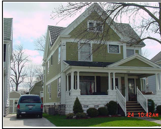
118 Summit St 180200 84.042-2-65

Neighborhood: 300 Property Class: 210 - 1 Family Res Sale Date: 6/5/2023 Sale Price: $ 205,000 Prelim 2024 Land Asmt: $ 16,300 Prelim 2024 Asmt: $ 207,000 Building Style: Old Style Exterior Wall: Wood Year Built: 1915 Basement Type: Full Grade: Average Condition: Normal SFLA: 2,202 Sale Price/SFLA: $ 93.10 Number Bedrooms: 4 Number Baths: 1.5