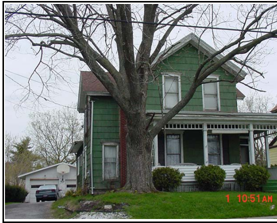
18 Clifton Ave 180200 84.020-2-16

Neighborhood: 500 Property Class: 230 - 3 Family Res Sale Date: 2/18/2022 Sale Price: $ 50,000 Prelim 2024 Land Asmt: $ 8,100 Prelim 2024 Asmt: $ 79,000 Building Style: Old Style Exterior Wall: Alum/vinyl Year Built: 1880 Basement Type: Full Grade: Average Condition: Normal SFLA: 1,966 Sale Price/SFLA: $ 25.43 Number Bedrooms: 6 Number Baths: 3.0