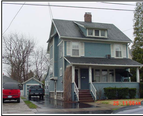
206 North St 180200 84.034-2-2

Neighborhood: 300 Property Class: 210 - 1 Family Res Sale Date: 4/1/2022 Sale Price: $ 150,000 Prelim 2024 Land Asmt: $ 13,100 Prelim 2024 Asmt: $ 157,000 Building Style: Old Style Exterior Wall: Alum/vinyl Year Built: 1920 Basement Type: Full Grade: Average Condition: Normal SFLA: 1,282 Sale Price/SFLA: $ 117.00 Number Bedrooms: 3 Number Baths: 1.0