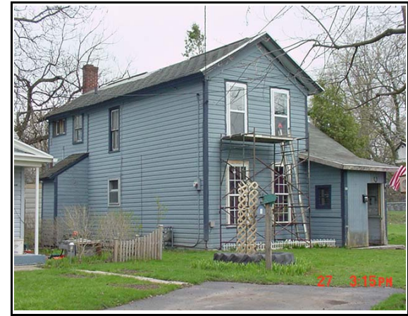
19 Mckinley Ave 180200 84.059-2-43

Neighborhood: 600 Property Class: 210 - 1 Family Res Sale Date: 5/3/2023 Sale Price: $ 139,900 Prelim 2024 Land Asmt: $ 11,800 Prelim 2024 Asmt: $ 143,000 Building Style: Old Style Exterior Wall: Alum/vinyl Year Built: 1900 Basement Type: Full Grade: Average Condition: Normal SFLA: 1,232 Sale Price/SFLA: $ 113.56 Number Bedrooms: 3 Number Baths: 1.0