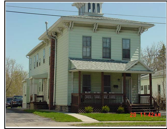
403 Ellicott St 180200 84.015-3-21

Neighborhood: 600 Property Class: 220 - 2 Family Res Sale Date: 9/22/2022 Sale Price: $ 200,000 Prelim 2024 Land Asmt: $ 17,000 Prelim 2024 Asmt: $ 205,000 Building Style: Old Style Exterior Wall: Wood Year Built: 1920 Basement Type: Full Grade: Average Condition: Fair SFLA: 2,314 Sale Price/SFLA: $ 86.43 Number Bedrooms: 4 Number Baths: 2.0