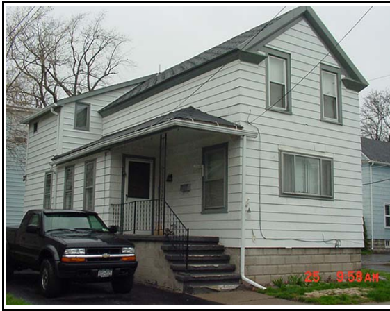
15 Columbia Ave 180200 84.043-1-37

Neighborhood: 300 Property Class: 210 - 1 Family Res Sale Date: 6/2/2022 Sale Price: $ 65,000 Prelim 2024 Land Asmt: $ 6,600 Prelim 2024 Asmt: $ 77,000 Building Style: Old Style Exterior Wall: Composition Year Built: 1910 Basement Type: Partial Grade: Average Condition: Normal SFLA: 1,254 Sale Price/SFLA: $ 51.83 Number Bedrooms: 2 Number Baths: 1.5