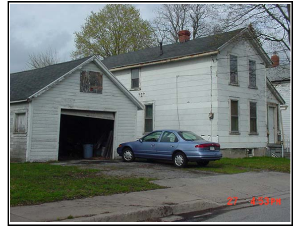
24-26 Colorado Ave 180200 84.067-1-1

Neighborhood: 600 Property Class: 210 - 1 Family Res Sale Date: 9/28/2022 Sale Price: $ 115,000 Prelim 2024 Land Asmt: $ 12,700 Prelim 2024 Asmt: $ 119,000 Building Style: Old Style Exterior Wall: Alum/vinyl Year Built: 1930 Basement Type: Full Grade: Average Condition: Normal SFLA: 865 Sale Price/SFLA: $ 132.95 Number Bedrooms: 2 Number Baths: 1.0