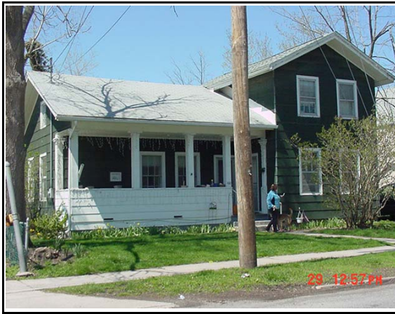
100 Harvester Ave 180200 84.016-1-43

Neighborhood: 600 Property Class: 210 - 1 Family Res Sale Date: 11/21/2023 Sale Price: $ 75,000 Prelim 2024 Land Asmt: $ 13,100 Prelim 2024 Asmt: $ 78,000 Building Style: Old Style Exterior Wall: Alum/vinyl Year Built: 1870 Basement Type: Full Grade: Economy Condition: Poor SFLA: 1,648 Sale Price/SFLA: $ 45.51 Number Bedrooms: 3 Number Baths: 1.0