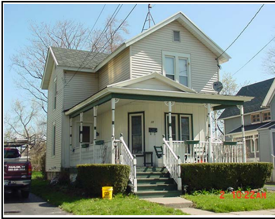
15 Wood St 180200 84.065-2-41

Neighborhood: 500 Property Class: 220 - 2 Family Res Sale Date: 1/5/2022 Sale Price: $ 100,000 Prelim 2024 Land Asmt: $ 15,300 Prelim 2024 Asmt: $ 109,000 Building Style: Old Style Exterior Wall: Alum/vinyl Year Built: 1900 Basement Type: Full Grade: Average Condition: Normal SFLA: 1,997 Sale Price/SFLA: $ 50.08 Number Bedrooms: 4 Number Baths: 2.0