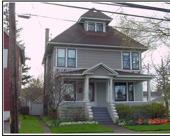
157 Jackson St 180200 84.073-1-13

Neighborhood: 500 Property Class: 210 - 1 Family Res Sale Date: 5/20/2022 Sale Price: $ 75,000 Prelim 2024 Land Asmt: $ 15,400 Prelim 2024 Asmt: $ 85,000 Building Style: Old Style Exterior Wall: Alum/vinyl Year Built: 1900 Basement Type: Full Grade: Average Condition: Normal SFLA: 1,680 Sale Price/SFLA: $ 44.64 Number Bedrooms: 4 Number Baths: 1.0