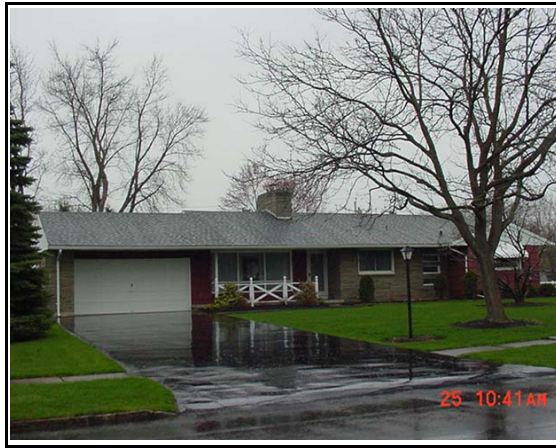
244 East Ave 180200 84.012-3-21

Neighborhood: 200 Property Class: 210 - 1 Family Res Sale Date: 1/7/2022 Sale Price: $ 205,000 Prelim 2024 Land Asmt: $ 35,300 Prelim 2024 Asmt: $ 226,000 Building Style: Ranch Exterior Wall: Wood Year Built: 1961 Basement Type: Full Grade: Average Condition: Normal SFLA: 1,752 Sale Price/SFLA: $ 117.01 Number Bedrooms: 3 Number Baths: 2.0