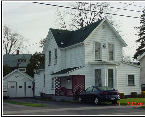
20 Pearl St 180200 84.047-2-41

Neighborhood: 500 Property Class: 210 - 1 Family Res Sale Date: 8/22/2023 Sale Price: $ 173,000 Prelim 2024 Land Asmt: $ 15,300 Prelim 2024 Asmt: $ 188,000 Building Style: Old Style Exterior Wall: Wood Year Built: 1918 Basement Type: Full Grade: Average Condition: Fair SFLA: 1,500 Sale Price/SFLA: $ 115.33 Number Bedrooms: 4 Number Baths: 1.0