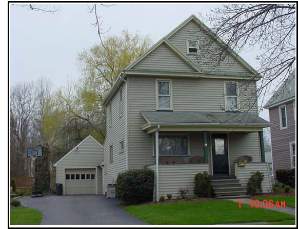
24 Kibbe Ave 180200 84.019-2-78

Neighborhood: 500 Property Class: 210 - 1 Family Res Sale Date: 2/9/2022 Sale Price: $ 95,000 Prelim 2024 Land Asmt: $ 9,600 Prelim 2024 Asmt: $ 129,000 Building Style: Old Style Exterior Wall: Alum/vinyl Year Built: 2004 Basement Type: Full Grade: Average Condition: Normal SFLA: 2,160 Sale Price/SFLA: $ 43.98 Number Bedrooms: 5 Number Baths: 2.0