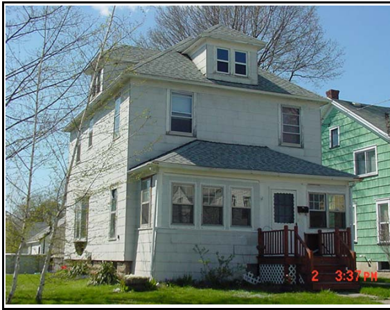
34 Otis St 180200 84.082-2-9

Neighborhood: 500 Property Class: 210 - 1 Family Res Sale Date: 8/22/2023 Sale Price: $ 173,000 Prelim 2024 Land Asmt: $ 15,300 Prelim 2024 Asmt: $ 188,000 Building Style: Old Style Exterior Wall: Wood Year Built: 1918 Basement Type: Full Grade: Average Condition: Fair SFLA: 1,500 Sale Price/SFLA: $ 115.33 Number Bedrooms: 4 Number Baths: 1.0