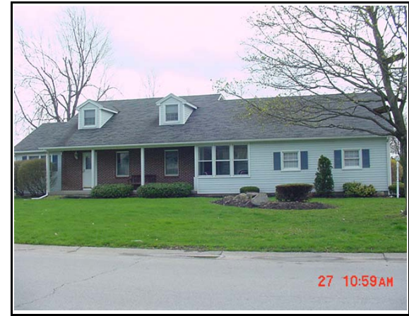
116 Naramore Dr 180200 85.005-1-26

Neighborhood: 100 Property Class: 210 - 1 Family Res Sale Date: 5/5/2023 Sale Price: $ 275,000 Prelim 2024 Land Asmt: $ 32,300 Prelim 2024 Asmt: $ 297,000 Building Style: Split Level Exterior Wall: Alum/vinyl Year Built: 1965 Basement Type: Full Grade: Average Condition: Normal SFLA: 2,090 Sale Price/SFLA: $ 131.58 Number Bedrooms: 3 Number Baths: 2.5