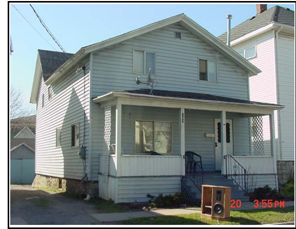
107 State St 180200 84.041-1-35

Neighborhood: 700 Property Class: 210 - 1 Family Res Sale Date: 6/27/2022 Sale Price: $ 72,500 Prelim 2024 Land Asmt: $ 10,100 Prelim 2024 Asmt: $ 94,000 Building Style: Old Style Exterior Wall: Composition Year Built: 1905 Basement Type: Full Grade: Average Condition: Normal SFLA: 1,440 Sale Price/SFLA: $ 50.35 Number Bedrooms: 3 Number Baths: 1.0