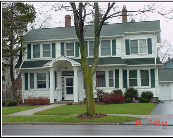
2 Redfield Pkwy 180200 84.005-1-52

Neighborhood: 400 Property Class: 210 - 1 Family Res Sale Date: 8/11/2023 Sale Price: $ 220,000 Prelim 2024 Land Asmt: $ 29,000 Prelim 2024 Asmt: $ 224,000 Building Style: Colonial Exterior Wall: Alum/vinyl Year Built: 1930 Basement Type: Full Grade: Good Condition: Normal SFLA: 1,752 Sale Price/SFLA: $ 125.57 Number Bedrooms: 4 Number Baths: 1.0