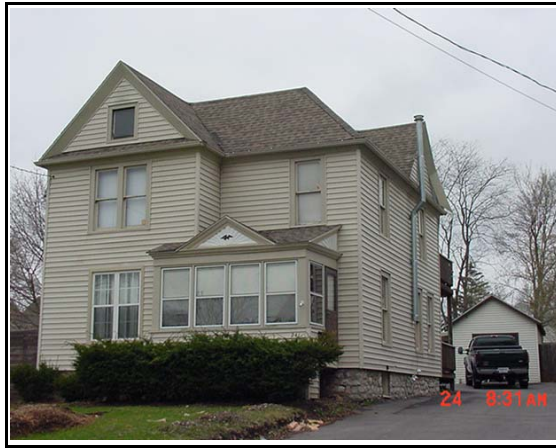
239-241 Bank St 180200 84.026-1-6

Neighborhood: 300 Property Class: 210 - 1 Family Res Sale Date: 8/11/2022 Sale Price: $ 150,000 Prelim 2024 Land Asmt: $ 10,600 Prelim 2024 Asmt: $ 169,000 Building Style: Old Style Exterior Wall: Alum/vinyl Year Built: 1900 Basement Type: Full Grade: Average Condition: Normal SFLA: 1,488 Sale Price/SFLA: $ 100.81 Number Bedrooms: 4 Number Baths: 1.0