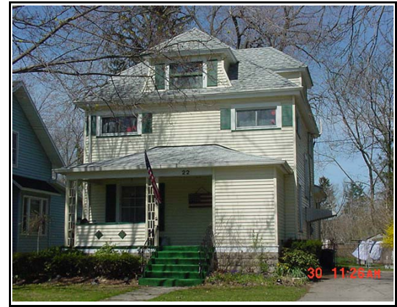
22 Brooklyn Ave 180200 84.010-1-10

Neighborhood: 500 Property Class: 220 - 2 Family Res Sale Date: 8/4/2022 Sale Price: $ 117,500 Prelim 2024 Land Asmt: $ 13,200 Prelim 2024 Asmt: $ 123,000 Building Style: Old Style Exterior Wall: Alum/vinyl Year Built: 1880 Basement Type: Full Grade: Average Condition: Fair SFLA: 1,926 Sale Price/SFLA: $ 61.01 Number Bedrooms: 4 Number Baths: 2.0