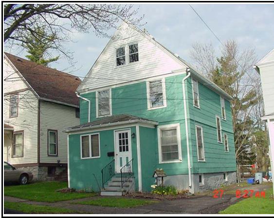
33 Trumbull Pkwy 180200 84.051-2-39

Neighborhood: 700 Property Class: 210 - 1 Family Res Sale Date: 7/20/2022 Sale Price: $ 134,000 Prelim 2024 Land Asmt: $ 11,300 Prelim 2024 Asmt: $ 160,000 Building Style: Old Style Exterior Wall: Composition Year Built: 1900 Basement Type: Full Grade: Average Condition: Normal SFLA: 1,420 Sale Price/SFLA: $ 94.37 Number Bedrooms: 4 Number Baths: 1.5