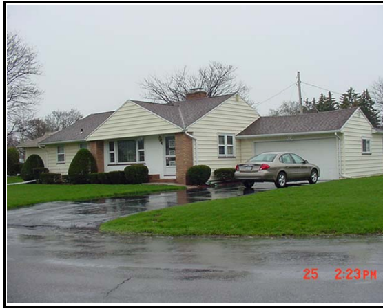
4 Farwell Dr 180200 84.043-2-3

Neighborhood: 200 Property Class: 210 - 1 Family Res Sale Date: 6/23/2023 Sale Price: $ 223,002 Prelim 2024 Land Asmt: $ 13,200 Prelim 2024 Asmt: $ 130,000 Building Style: Ranch Exterior Wall: Composition Year Built: 1974 Basement Type: Full Grade: Average Condition: Normal SFLA: 1,048 Sale Price/SFLA: $ 212.79 Number Bedrooms: 3 Number Baths: 1.0