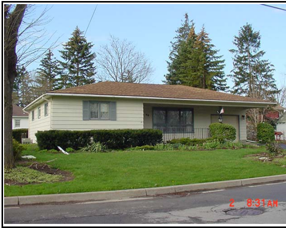
46 Ganson Ave 180200 84.073-1-9

Neighborhood: 500 Property Class: 210 - 1 Family Res Sale Date: 9/21/2022 Sale Price: $ 95,000 Prelim 2024 Land Asmt: $ 13,400 Prelim 2024 Asmt: $ 132,000 Building Style: Ranch Exterior Wall: Wood Year Built: 1964 Basement Type: Full Grade: Average Condition: Fair SFLA: 1,032 Sale Price/SFLA: $ 92.05 Number Bedrooms: 2 Number Baths: 1.0