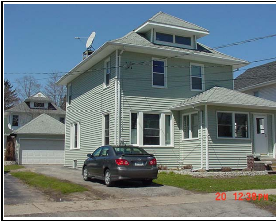
11 Lewis Ave 180200 84.032-2-14

Neighborhood: 200 Property Class: 210 - 1 Family Res Sale Date: 2/2/2022 Sale Price: $ 181,900 Prelim 2024 Land Asmt: $ 12,300 Prelim 2024 Asmt: $ 205,000 Building Style: Old Style Exterior Wall: Alum/vinyl Year Built: 1900 Basement Type: Full Grade: Average Condition: Normal SFLA: 1,809 Sale Price/SFLA: $ 100.55 Number Bedrooms: 4 Number Baths: 1.5