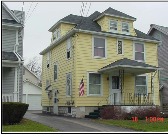
49 Montclair Ave 180200 84.024-1-53

Neighborhood: 300 Property Class: 220 - 2 Family Res Sale Date: 7/14/2022 Sale Price: $ 90,000 Prelim 2024 Land Asmt: $ 8,800 Prelim 2024 Asmt: $ 118,000 Building Style: Old Style Exterior Wall: Alum/vinyl Year Built: 1920 Basement Type: Full Grade: Average Condition: Fair SFLA: 1,344 Sale Price/SFLA: $ 66.96 Number Bedrooms: 2 Number Baths: 2.0