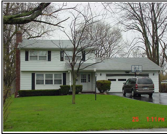
164 Vine St 180200 84.008-1-36

Neighborhood: 200 Property Class: 220 - 2 Family Res Sale Date: 8/19/2022 Sale Price: $ 171,500 Prelim 2024 Land Asmt: $ 20,100 Prelim 2024 Asmt: $ 193,000 Building Style: Colonial Exterior Wall: Alum/vinyl Year Built: 1985 Basement Type: Full Grade: Average Condition: Normal SFLA: 2,100 Sale Price/SFLA: $ 81.67 Number Bedrooms: 4 Number Baths: 2.0