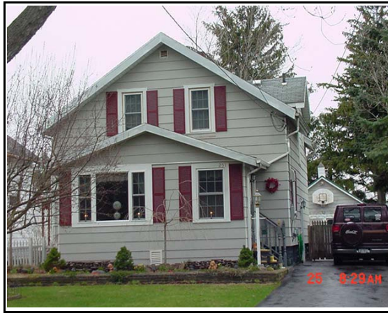
251 Ross St 180200 84.026-2-7

Neighborhood: 200 Property Class: 210 - 1 Family Res Sale Date: 11/29/2022 Sale Price: $ 40,000 Prelim 2024 Land Asmt: $ 10,900 Prelim 2024 Asmt: $ 144,800 Building Style: Old Style Exterior Wall: Wood Year Built: 1900 Basement Type: Full Grade: Economy Condition: Poor SFLA: 1,124 Sale Price/SFLA: $ 35.59 Number Bedrooms: 3 Number Baths: 1.0