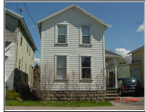
7 1/2 Hutchins St 180200 84.066-2-44.2

Neighborhood: 500 Property Class: 210 - 1 Family Res Sale Date: 6/7/2022 Sale Price: $ 215,000 Prelim 2024 Land Asmt: $ 16,500 Prelim 2024 Asmt: $ 267,000 Building Style: Cape Cod Exterior Wall: Alum/vinyl Year Built: 1999 Basement Type: Full Grade: Average Condition: Normal SFLA: 2,790 Sale Price/SFLA: $ 77.06 Number Bedrooms: 4 Number Baths: 2.5