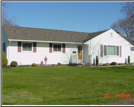
9 Buxton Ave 180200 84.006-2-23

Neighborhood: 200 Property Class: 210 - 1 Family Res Sale Date: 5/10/2022 Sale Price: $ 248,800 Prelim 2024 Land Asmt: $ 17,000 Prelim 2024 Asmt: $ 262,000 Building Style: Ranch Exterior Wall: Alum/vinyl Year Built: 1956 Basement Type: Full Grade: Average Condition: Normal SFLA: 1,534 Sale Price/SFLA: $ 162.19 Number Bedrooms: 2 Number Baths: 1.5