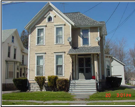
307 Washington Ave 180200 84.042-2-45

Neighborhood: 300 Property Class: 220 - 2 Family Res Sale Date: 1/14/2022 Sale Price: $ 116,000 Prelim 2024 Land Asmt: $ 13,700 Prelim 2024 Asmt: $ 118,000 Building Style: Old Style Exterior Wall: Wood Year Built: 1880 Basement Type: Full Grade: Average Condition: Fair SFLA: 2,083 Sale Price/SFLA: $ 55.69 Number Bedrooms: 3 Number Baths: 2.0