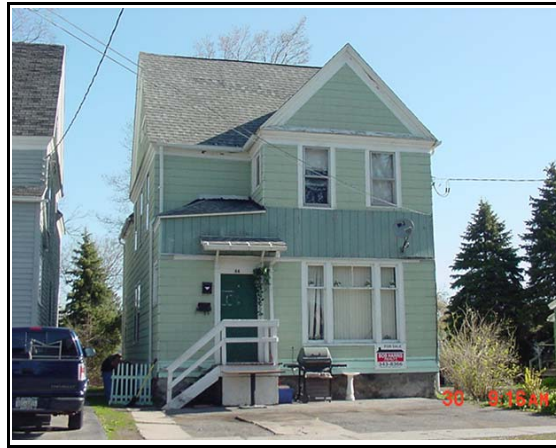
44 South Main St 180200 84.039-2-11

Neighborhood: 500 Property Class: 220 - 2 Family Res Sale Date: 12/15/2022 Sale Price: $ 70,000 Prelim 2024 Land Asmt: $ 8,600 Prelim 2024 Asmt: $ 92,000 Building Style: Old Style Exterior Wall: Alum/vinyl Year Built: 1900 Basement Type: Full Grade: Average Condition: Poor SFLA: 1,954 Sale Price/SFLA: $ 35.82 Number Bedrooms: 3 Number Baths: 2.0