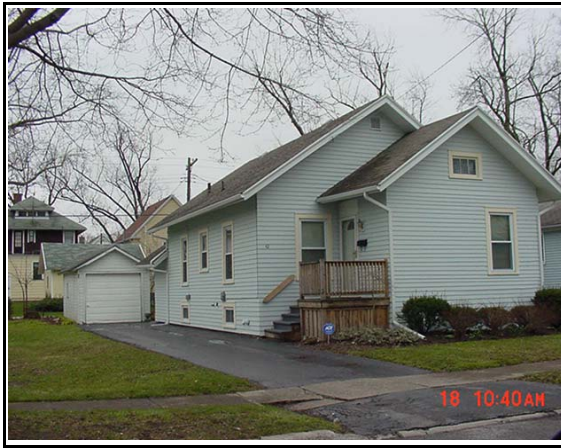
42 Kingsbury Ave 180200 84.023-2-33

Neighborhood: 200 Property Class: 210 - 1 Family Res Sale Date: 11/10/2022 Sale Price: $ 135,000 Prelim 2024 Land Asmt: $ 15,200 Prelim 2024 Asmt: $ 139,000 Building Style: Old Style Exterior Wall: Wood Year Built: 1930 Basement Type: Partial Grade: Average Condition: Normal SFLA: 1,010 Sale Price/SFLA: $ 133.66 Number Bedrooms: 2 Number Baths: 1.0