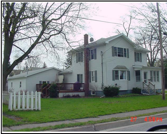
23-25 Colorado Ave 180200 84.075-1-1

Neighborhood: 600 Property Class: 220 - 2 Family Res Sale Date: 11/30/2023 Sale Price: $ 130,000 Prelim 2024 Land Asmt: $ 21,700 Prelim 2024 Asmt: $ 142,000 Building Style: Old Style Exterior Wall: Alum/vinyl Year Built: 1900 Basement Type: Full Grade: Average Condition: Fair SFLA: 1,616 Sale Price/SFLA: $ 80.45 Number Bedrooms: 3 Number Baths: 2.0