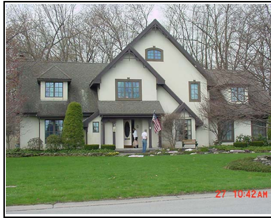
412 Garden Dr 180200 85.005-2-5

Neighborhood: 100 Property Class: 210 - 1 Family Res Sale Date: 7/29/2022 Sale Price: $ 335,000 Prelim 2024 Land Asmt: $ 31,100 Prelim 2024 Asmt: $ 354,000 Building Style: Colonial Exterior Wall: Alum/vinyl Year Built: 1978 Basement Type: Full Grade: Average Condition: Normal SFLA: 2,800 Sale Price/SFLA: $ 119.64 Number Bedrooms: 4 Number Baths: 2.5