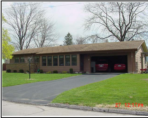
2 Clinton Park 180200 85.009-1-35

Neighborhood: 200 Property Class: 210 - 1 Family Res Sale Date: 1/7/2022 Sale Price: $ 205,000 Prelim 2024 Land Asmt: $ 35,300 Prelim 2024 Asmt: $ 226,000 Building Style: Ranch Exterior Wall: Wood Year Built: 1961 Basement Type: Full Grade: Average Condition: Normal SFLA: 1,752 Sale Price/SFLA: $ 117.01 Number Bedrooms: 3 Number Baths: 2.0