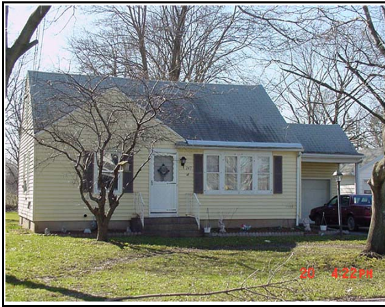
247 State St 180200 71.019-1-30

Neighborhood: 300 Property Class: 210 - 1 Family Res Sale Date: 12/8/2023 Sale Price: $ 153,000 Prelim 2024 Land Asmt: $ 17,000 Prelim 2024 Asmt: $ 119,000 Building Style: Cape Cod Exterior Wall: Alum/vinyl Year Built: 1951 Basement Type: Full Grade: Average Condition: Normal SFLA: 1,401 Sale Price/SFLA: $ 109.21 Number Bedrooms: 3 Number Baths: 2.0