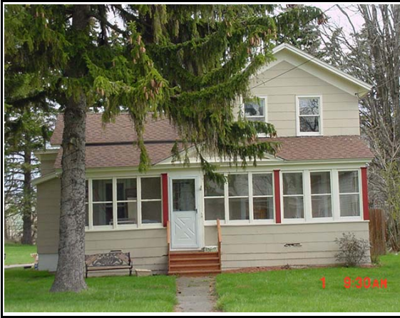
24 Chestnut St 180200 84.018-1-29

Neighborhood: 500 Property Class: 210 - 1 Family Res Sale Date: 7/14/2022 Sale Price: $ 144,000 Prelim 2024 Land Asmt: $ 29,800 Prelim 2024 Asmt: $ 153,000 Building Style: Old Style Exterior Wall: Composition Year Built: 1900 Basement Type: Full Grade: Average Condition: Normal SFLA: 1,208 Sale Price/SFLA: $ 119.21 Number Bedrooms: 2 Number Baths: 2.0