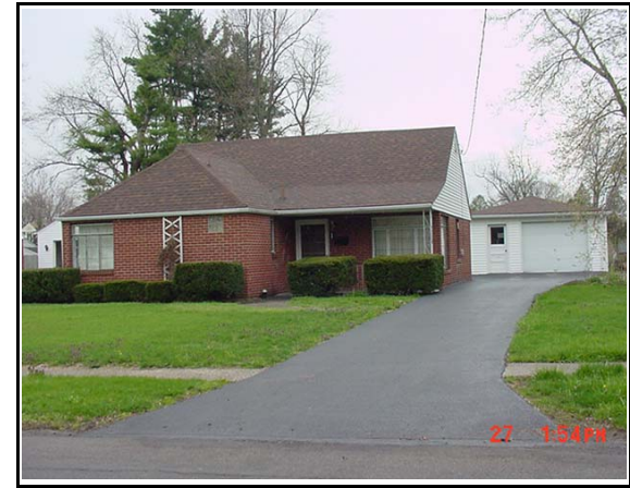
1 Grandview Ter 180200 85.009-2-47

Neighborhood: 200 Property Class: 210 - 1 Family Res Sale Date: 2/1/2023 Sale Price: $ 130,000 Prelim 2024 Land Asmt: $ 16,400 Prelim 2024 Asmt: $ 146,000 Building Style: Ranch Exterior Wall: Alum/vinyl Year Built: 1962 Basement Type: Full Grade: Average Condition: Normal SFLA: 1,040 Sale Price/SFLA: $ 125.00 Number Bedrooms: 2 Number Baths: 1.5