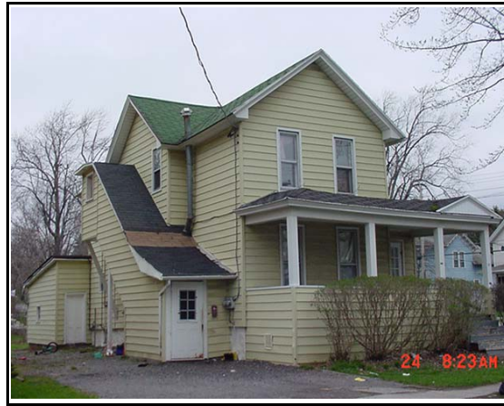
161 Bank St 180200 84.033-2-7

Neighborhood: 300 Property Class: 220 - 2 Family Res Sale Date: 7/20/2023 Sale Price: $ 118,000 Prelim 2024 Land Asmt: $ 9,500 Prelim 2024 Asmt: $ 124,000 Building Style: Old Style Exterior Wall: Composition Year Built: 1900 Basement Type: Full Grade: Average Condition: Fair SFLA: 1,672 Sale Price/SFLA: $ 70.57 Number Bedrooms: 5 Number Baths: 2.0