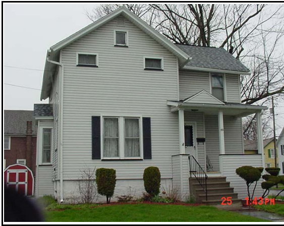
43 Vine St 180200 84.043-3-17

Neighborhood: 700 Property Class: 210 - 1 Family Res Sale Date: 7/6/2022 Sale Price: $ 95,294 Prelim 2024 Land Asmt: $ 12,500 Prelim 2024 Asmt: $ 98,000 Building Style: Old Style Exterior Wall: Alum/vinyl Year Built: 1900 Basement Type: Full Grade: Average Condition: Fair SFLA: 1,275 Sale Price/SFLA: $ 74.74 Number Bedrooms: 3 Number Baths: 1.0