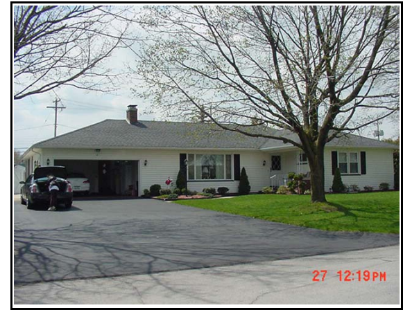
14 Fordham Dr 180200 84.012-3-36

Neighborhood: 200 Property Class: 210 - 1 Family Res Sale Date: 10/14/2022 Sale Price: $ 245,000 Prelim 2024 Land Asmt: $ 20,600 Prelim 2024 Asmt: $ 296,000 Building Style: Ranch Exterior Wall: Brick Year Built: 1957 Basement Type: Full Grade: Average Condition: Normal SFLA: 1,804 Sale Price/SFLA: $ 135.81 Number Bedrooms: 3 Number Baths: 2.0