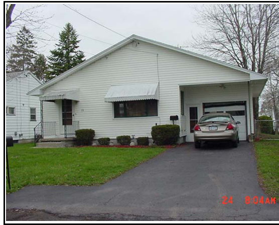
10 Douglas St 180200 71.082-1-57

Neighborhood: 200 Property Class: 210 - 1 Family Res Sale Date: 6/13/2022 Sale Price: $ 155,000 Prelim 2024 Land Asmt: $ 16,400 Prelim 2024 Asmt: $ 161,000 Building Style: Ranch Exterior Wall: Alum/vinyl Year Built: 1959 Basement Type: Full Grade: Average Condition: Normal SFLA: 1,026 Sale Price/SFLA: $ 151.07 Number Bedrooms: 2 Number Baths: 1.0