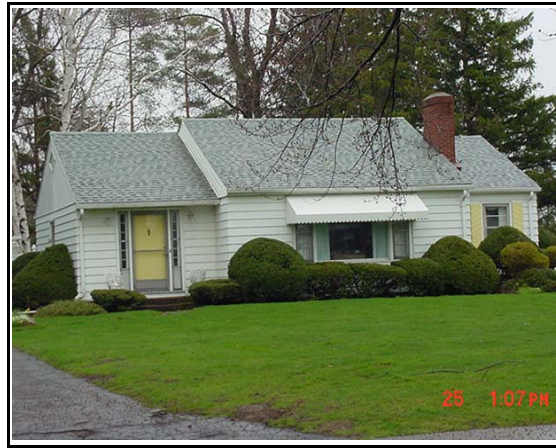
236 Vine St 180200 71.020-1-38

Neighborhood: 200 Property Class: 210 - 1 Family Res Sale Date: 3/31/2022 Sale Price: $ 152,100 Prelim 2024 Land Asmt: $ 17,000 Prelim 2024 Asmt: $ 177,000 Building Style: Ranch Exterior Wall: Alum/vinyl Year Built: 1953 Basement Type: Full Grade: Average Condition: Normal SFLA: 1,247 Sale Price/SFLA: $ 121.97 Number Bedrooms: 3 Number Baths: 1.0