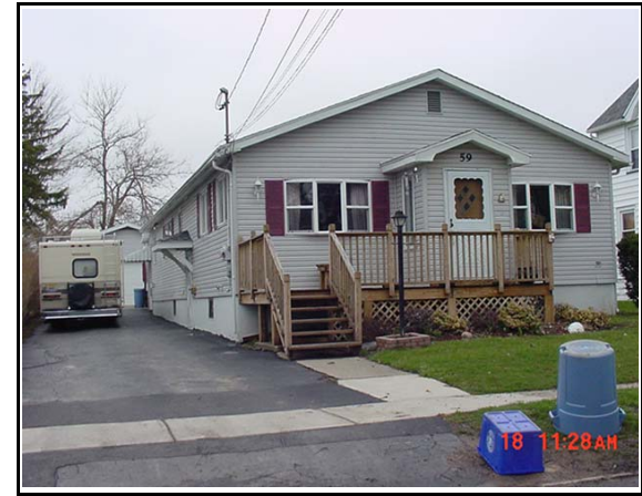
59 Vernon Ave 180200 84.023-2-5

Neighborhood: 200 Property Class: 210 - 1 Family Res Sale Date: 4/6/2022 Sale Price: $ 190,000 Prelim 2024 Land Asmt: $ 19,300 Prelim 2024 Asmt: $ 215,000 Building Style: Ranch Exterior Wall: Wood Year Built: 1960 Basement Type: Full Grade: Average Condition: Normal SFLA: 1,534 Sale Price/SFLA: $ 123.86 Number Bedrooms: 3 Number Baths: 2.0