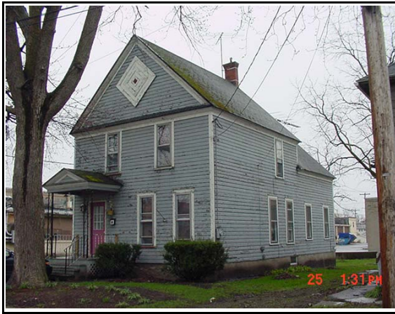
12 Masse Pl 180200 84.059-1-8

Neighborhood: 600 Property Class: 210 - 1 Family Res Sale Date: 11/15/2022 Sale Price: $ 85,000 Prelim 2024 Land Asmt: $ 10,200 Prelim 2024 Asmt: $ 87,000 Building Style: Old Style Exterior Wall: Alum/vinyl Year Built: 1900 Basement Type: Full Grade: Average Condition: Normal SFLA: 1,408 Sale Price/SFLA: $ 60.37 Number Bedrooms: 4 Number Baths: 1.0