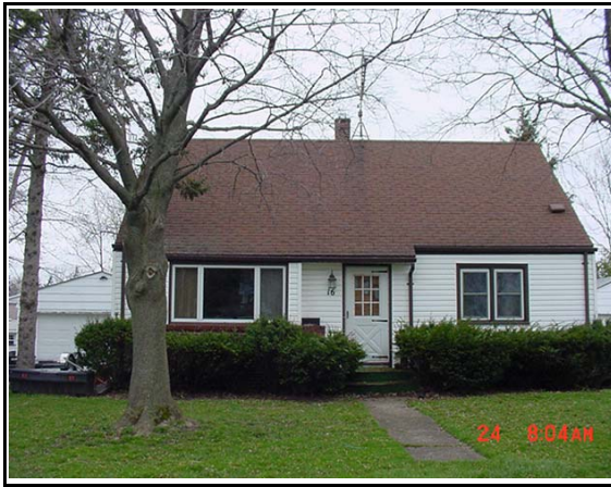
16 Douglas St 180200 71.082-1-56

Neighborhood: 200 Property Class: 210 - 1 Family Res Sale Date: 4/26/2022 Sale Price: $ 143,000 Prelim 2024 Land Asmt: $ 17,000 Prelim 2024 Asmt: $ 147,000 Building Style: Cape Cod Exterior Wall: Alum/vinyl Year Built: 1945 Basement Type: Full Grade: Average Condition: Normal SFLA: 1,150 Sale Price/SFLA: $ 124.35 Number Bedrooms: 3 Number Baths: 1.0