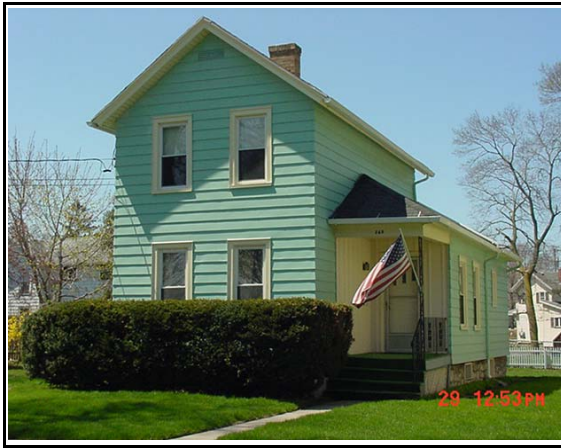
148 Harvester Ave 180200 84.075-1-21

Neighborhood: 600 Property Class: 210 - 1 Family Res Sale Date: 6/23/2022 Sale Price: $ 85,106 Prelim 2024 Land Asmt: $ 12,600 Prelim 2024 Asmt: $ 99,000 Building Style: Old Style Exterior Wall: Alum/vinyl Year Built: 1890 Basement Type: Full Grade: Average Condition: Normal SFLA: 1,024 Sale Price/SFLA: $ 83.11 Number Bedrooms: 2 Number Baths: 1.0