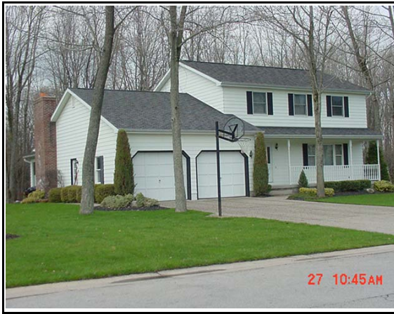
396 Garden Dr 180200 85.005-1-79

Neighborhood: 100 Property Class: 210 - 1 Family Res Sale Date: 10/7/2022 Sale Price: $ 300,000 Prelim 2024 Land Asmt: $ 42,900 Prelim 2024 Asmt: $ 314,000 Building Style: Colonial Exterior Wall: Alum/vinyl Year Built: 1990 Basement Type: Partial Grade: Average Condition: Normal SFLA: 1,880 Sale Price/SFLA: $ 159.57 Number Bedrooms: 4 Number Baths: 2.5