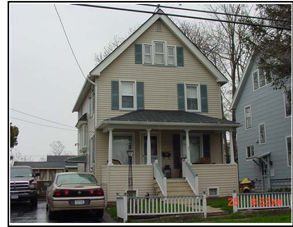
205 Ross St 180200 84.034-3-7

Neighborhood: 300 Property Class: 210 - 1 Family Res Sale Date: 4/27/2022 Sale Price: $ 105,470 Prelim 2024 Land Asmt: $ 12,600 Prelim 2024 Asmt: $ 118,000 Building Style: Old Style Exterior Wall: Alum/vinyl Year Built: 1930 Basement Type: Full Grade: Average Condition: Normal SFLA: 1,254 Sale Price/SFLA: $ 84.11 Number Bedrooms: 3 Number Baths: 1.0