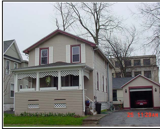
4 East Ave 180200 84.043-3-6

Neighborhood: 700 Property Class: 210 - 1 Family Res Sale Date: 9/22/2023 Sale Price: $ 85,000 Prelim 2024 Land Asmt: $ 10,100 Prelim 2024 Asmt: $ 105,000 Building Style: Old Style Exterior Wall: Wood Year Built: 1870 Basement Type: Full Grade: Average Condition: Poor SFLA: 1,380 Sale Price/SFLA: $ 61.59 Number Bedrooms: 3 Number Baths: 1.5