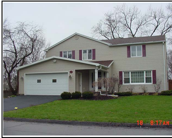
15 Bogue Ave 180200 84.005-1-45

Neighborhood: 400 Property Class: 210 - 1 Family Res Sale Date: 8/11/2023 Sale Price: $ 220,000 Prelim 2024 Land Asmt: $ 29,000 Prelim 2024 Asmt: $ 224,000 Building Style: Colonial Exterior Wall: Alum/vinyl Year Built: 1930 Basement Type: Full Grade: Good Condition: Normal SFLA: 1,752 Sale Price/SFLA: $ 125.57 Number Bedrooms: 4 Number Baths: 1.0