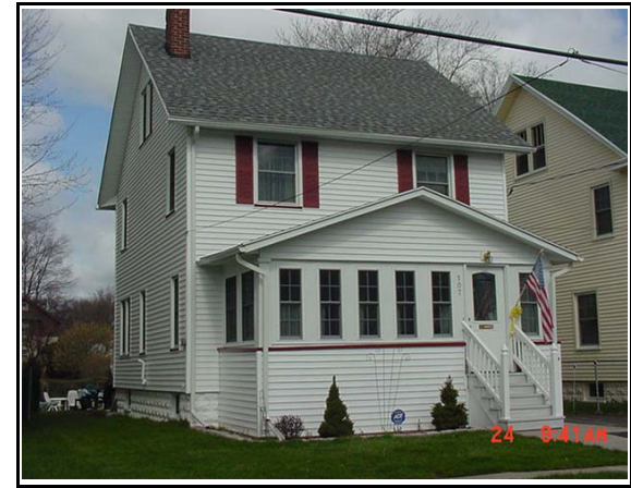
107 Tracy Ave 180200 84.026-1-36

Neighborhood: 300 Property Class: 210 - 1 Family Res Sale Date: 10/6/2023 Sale Price: $ 145,000 Prelim 2024 Land Asmt: $ 6,700 Prelim 2024 Asmt: $ 154,000 Building Style: Old Style Exterior Wall: Alum/vinyl Year Built: 1850 Basement Type: Full Grade: Average Condition: Normal SFLA: 1,442 Sale Price/SFLA: $ 100.55 Number Bedrooms: 3 Number Baths: 1.0