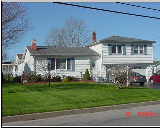
211 South Main St 180200 84.009-1-4

Neighborhood: 500 Property Class: 210 - 1 Family Res Sale Date: 3/24/2022 Sale Price: $ 247,000 Prelim 2024 Land Asmt: $ 16,200 Prelim 2024 Asmt: $ 209,000 Building Style: Split Level Exterior Wall: Alum/vinyl Year Built: 1975 Basement Type: Full Grade: Average Condition: Normal SFLA: 2,000 Sale Price/SFLA: $ 123.50 Number Bedrooms: 3 Number Baths: 1.0