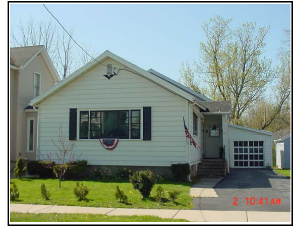
24 Cherry St 180200 84.073-2-4

Neighborhood: 500 Property Class: 220 - 2 Family Res Sale Date: 6/16/2022 Sale Price: $ 70,000 Prelim 2024 Land Asmt: $ 16,000 Prelim 2024 Asmt: $ 100,000 Building Style: Old Style Exterior Wall: Wood Year Built: 1900 Basement Type: Full Grade: Average Condition: Normal SFLA: 1,402 Sale Price/SFLA: $ 49.93 Number Bedrooms: 3 Number Baths: 2.0