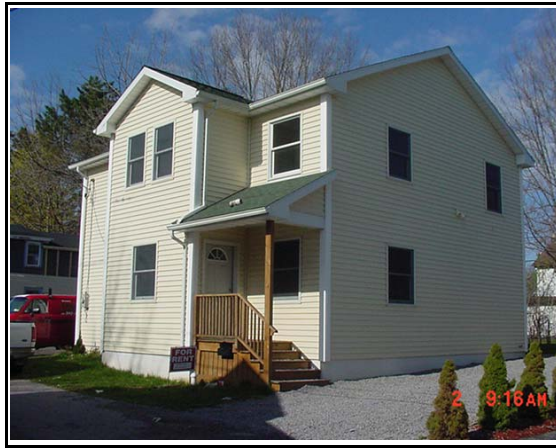
14 Thorp St 180200 84.065-1-53

Neighborhood: 500 Property Class: 220 - 2 Family Res Sale Date: 2/23/2022 Sale Price: $ 95,000 Prelim 2024 Land Asmt: $ 13,700 Prelim 2024 Asmt: $ 122,000 Building Style: Old Style Exterior Wall: Alum/vinyl Year Built: 1900 Basement Type: Full Grade: Average Condition: Normal SFLA: 2,118 Sale Price/SFLA: $ 44.85 Number Bedrooms: 5 Number Baths: 2.0