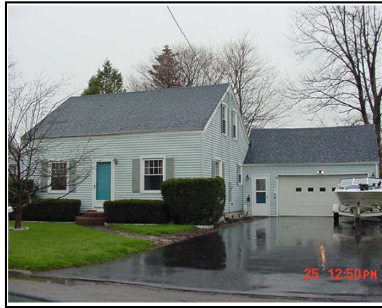
181 Vine St 180200 84.008-1-28

Neighborhood: 200 Property Class: 210 - 1 Family Res Sale Date: 4/26/2022 Sale Price: $ 143,000 Prelim 2024 Land Asmt: $ 17,000 Prelim 2024 Asmt: $ 147,000 Building Style: Cape Cod Exterior Wall: Alum/vinyl Year Built: 1945 Basement Type: Full Grade: Average Condition: Normal SFLA: 1,150 Sale Price/SFLA: $ 124.35 Number Bedrooms: 3 Number Baths: 1.0