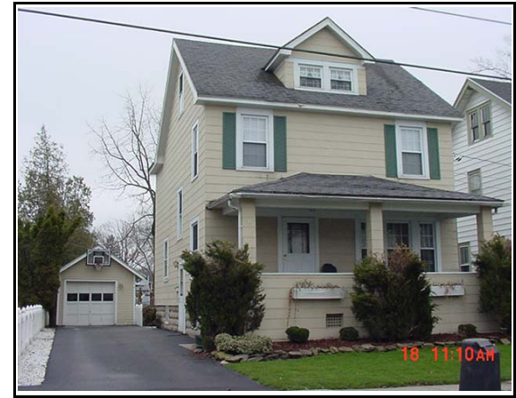
32 Vernon Ave 180200 84.006-3-60

Neighborhood: 200 Property Class: 210 - 1 Family Res Sale Date: 3/3/2023 Sale Price: $ 176,500 Prelim 2024 Land Asmt: $ 11,500 Prelim 2024 Asmt: $ 181,000 Building Style: Old Style Exterior Wall: Wood Year Built: 1910 Basement Type: Full Grade: Average Condition: Normal SFLA: 1,584 Sale Price/SFLA: $ 111.43 Number Bedrooms: 3 Number Baths: 1.0