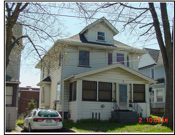
9 Pringle Ave 180200 84.066-1-42

Neighborhood: 500 Property Class: 220 - 2 Family Res Sale Date: 6/16/2022 Sale Price: $ 106,200 Prelim 2024 Land Asmt: $ 13,300 Prelim 2024 Asmt: $ 107,000 Building Style: Old Style Exterior Wall: Alum/vinyl Year Built: 1927 Basement Type: Full Grade: Average Condition: Normal SFLA: 1,782 Sale Price/SFLA: $ 59.60 Number Bedrooms: 4 Number Baths: 2.0