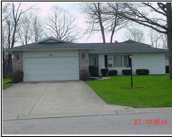
200 Naramore Dr 180200 85.005-1-37

Neighborhood: 100 Property Class: 210 - 1 Family Res Sale Date: 5/21/2023 Sale Price: $ 245,000 Prelim 2024 Land Asmt: $ 33,800 Prelim 2024 Asmt: $ 266,000 Building Style: Ranch Exterior Wall: Wood Year Built: 1980 Basement Type: Full Grade: Average Condition: Normal SFLA: 1,976 Sale Price/SFLA: $ 123.99 Number Bedrooms: 2 Number Baths: 2.0