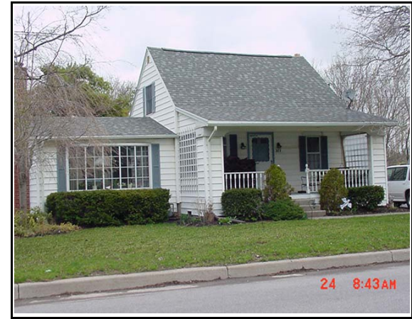
377 Bank St 180200 71.020-1-14

Neighborhood: 200 Property Class: 210 - 1 Family Res Sale Date: 11/9/2022 Sale Price: $ 95,000 Prelim 2024 Land Asmt: $ 14,000 Prelim 2024 Asmt: $ 111,000 Building Style: Cape Cod Exterior Wall: Concrete Year Built: 1944 Basement Type: Full Grade: Average Condition: Poor SFLA: 1,269 Sale Price/SFLA: $ 74.86 Number Bedrooms: 3 Number Baths: 1.5