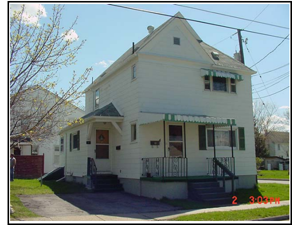
4 Sumner St 180200 84.019-3-18

Neighborhood: 500 Property Class: 220 - 2 Family Res Sale Date: 8/17/2022 Sale Price: $ 49,000 Prelim 2024 Land Asmt: $ 7,700 Prelim 2024 Asmt: $ 109,000 Building Style: Old Style Exterior Wall: Wood Year Built: 1925 Basement Type: Full Grade: Average Condition: Poor SFLA: 1,199 Sale Price/SFLA: $ 40.87 Number Bedrooms: 3 Number Baths: 2.0