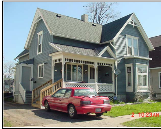
17 Wood St 180200 84.065-2-14

Neighborhood: 500 Property Class: 210 - 1 Family Res Sale Date: 5/26/2022 Sale Price: $ 117,000 Prelim 2024 Land Asmt: $ 13,400 Prelim 2024 Asmt: $ 123,000 Building Style: Old Style Exterior Wall: Alum/vinyl Year Built: 1875 Basement Type: Full Grade: Average Condition: Normal SFLA: 1,578 Sale Price/SFLA: $ 74.14 Number Bedrooms: 4 Number Baths: 1.5