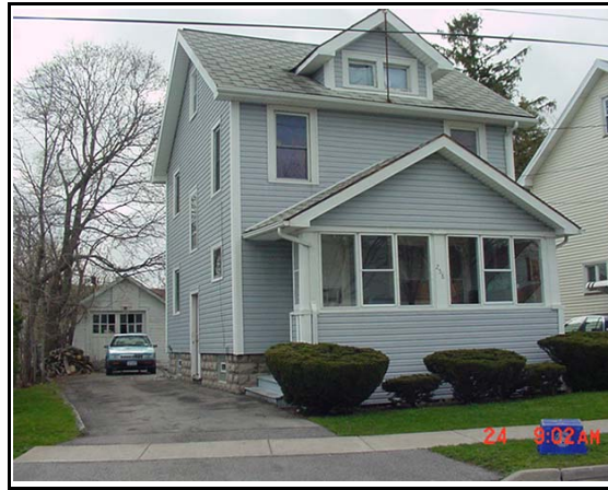
258 Bank St 180200 71.082-1-23

Neighborhood: 300 Property Class: 210 - 1 Family Res Sale Date: 7/10/2023 Sale Price: $ 80,000 Prelim 2024 Land Asmt: $ 6,100 Prelim 2024 Asmt: $ 88,000 Building Style: Old Style Exterior Wall: Wood Year Built: 1900 Basement Type: Full Grade: Average Condition: Fair SFLA: 1,180 Sale Price/SFLA: $ 67.80 Number Bedrooms: 3 Number Baths: 1.0