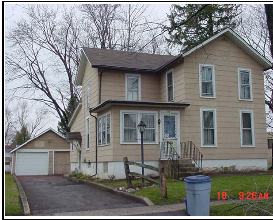
43 Union St 180200 84.006-1-3

Neighborhood: 300 Property Class: 210 - 1 Family Res Sale Date: 8/9/2022 Sale Price: $ 125,000 Prelim 2024 Land Asmt: $ 15,300 Prelim 2024 Asmt: $ 135,000 Building Style: Old Style Exterior Wall: Alum/vinyl Year Built: 1930 Basement Type: Full Grade: Average Condition: Fair SFLA: 1,560 Sale Price/SFLA: $ 80.13 Number Bedrooms: 3 Number Baths: 1.5