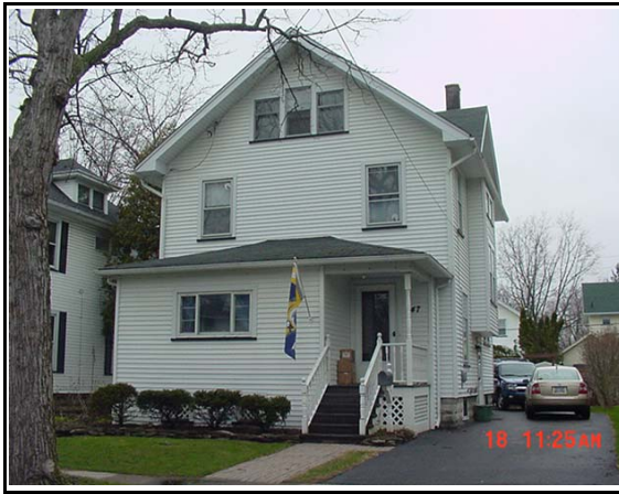
47 Vernon Ave 180200 84.023-2-11

Neighborhood: 200 Property Class: 210 - 1 Family Res Sale Date: 4/24/2023 Sale Price: $ 189,900 Prelim 2024 Land Asmt: $ 15,300 Prelim 2024 Asmt: $ 197,000 Building Style: Old Style Exterior Wall: Alum/vinyl Year Built: 1900 Basement Type: Partial Grade: Average Condition: Normal SFLA: 1,968 Sale Price/SFLA: $ 96.49 Number Bedrooms: 3 Number Baths: 1.0