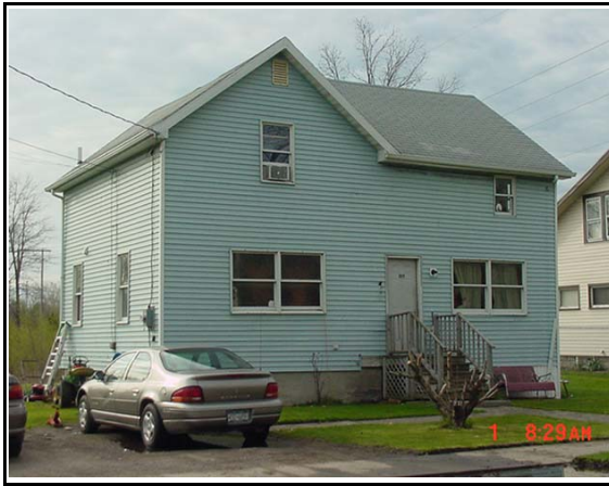
109 Walnut St 180200 84.014-2-30

Neighborhood: 500 Property Class: 210 - 1 Family Res Sale Date: 8/15/2022 Sale Price: $ 105,000 Prelim 2024 Land Asmt: $ 13,200 Prelim 2024 Asmt: $ 108,000 Building Style: Old Style Exterior Wall: Alum/vinyl Year Built: 1935 Basement Type: Crawl Grade: Average Condition: Fair SFLA: 1,408 Sale Price/SFLA: $ 74.57 Number Bedrooms: 4 Number Baths: 1.0