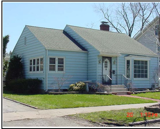
30 Thomas Ave 180200 84.040-2-78

Neighborhood: 300 Property Class: 210 - 1 Family Res Sale Date: 7/27/2022 Sale Price: $ 136,000 Prelim 2024 Land Asmt: $ 11,800 Prelim 2024 Asmt: $ 138,000 Building Style: Ranch Exterior Wall: Alum/vinyl Year Built: 1957 Basement Type: Full Grade: Average Condition: Normal SFLA: 864 Sale Price/SFLA: $ 157.41 Number Bedrooms: 3 Number Baths: 1.0