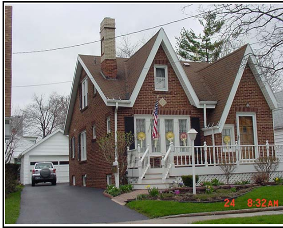
251 Bank St 180200 71.082-1-28

Neighborhood: 300 Property Class: 210 - 1 Family Res Sale Date: 12/8/2023 Sale Price: $ 153,000 Prelim 2024 Land Asmt: $ 17,000 Prelim 2024 Asmt: $ 119,000 Building Style: Cape Cod Exterior Wall: Alum/vinyl Year Built: 1951 Basement Type: Full Grade: Average Condition: Normal SFLA: 1,401 Sale Price/SFLA: $ 109.21 Number Bedrooms: 3 Number Baths: 2.0