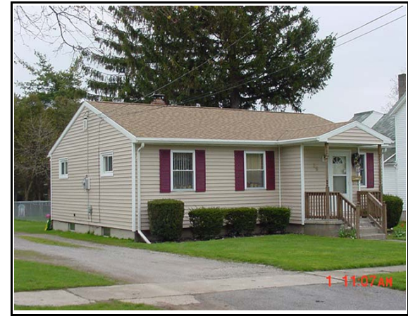
29 Williams St 180200 84.020-2-37

Neighborhood: 500 Property Class: 210 - 1 Family Res Sale Date: 7/27/2023 Sale Price: $ 170,000 Prelim 2024 Land Asmt: $ 16,800 Prelim 2024 Asmt: $ 172,000 Building Style: Ranch Exterior Wall: Alum/vinyl Year Built: 1955 Basement Type: Full Grade: Average Condition: Good SFLA: 976 Sale Price/SFLA: $ 174.18 Number Bedrooms: 2 Number Baths: 1.0