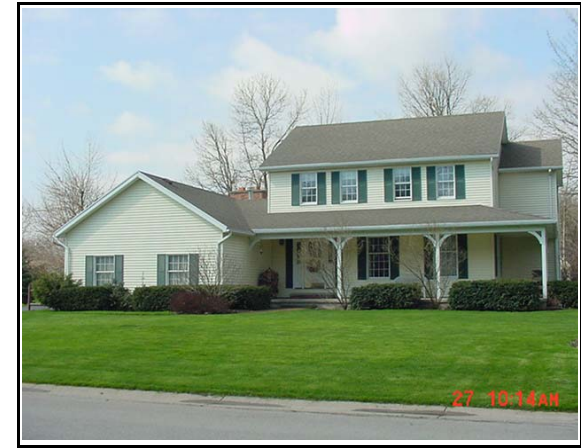
207 Naramore Dr 180200 85.005-1-74

Neighborhood: 100 Property Class: 210 - 1 Family Res Sale Date: 10/28/2022 Sale Price: $ 240,000 Prelim 2024 Land Asmt: $ 34,200 Prelim 2024 Asmt: $ 292,000 Building Style: Colonial Exterior Wall: Alum/vinyl Year Built: 1974 Basement Type: Partial Grade: Average Condition: Normal SFLA: 2,156 Sale Price/SFLA: $ 111.32 Number Bedrooms: 3 Number Baths: 1.5