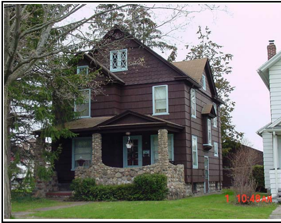
46 Clifton Ave 180200 84.020-2-27

Neighborhood: 500 Property Class: 210 - 1 Family Res Sale Date: 12/21/2022 Sale Price: $ 172,000 Prelim 2024 Land Asmt: $ 16,600 Prelim 2024 Asmt: $ 189,000 Building Style: Old Style Exterior Wall: Wood Year Built: 1924 Basement Type: Full Grade: Average Condition: Normal SFLA: 1,272 Sale Price/SFLA: $ 135.22 Number Bedrooms: 4 Number Baths: 1.0