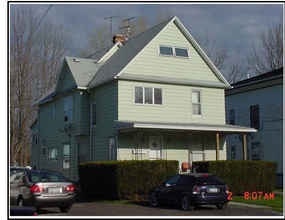
122 Jackson St 180200 84.065-1-40

Neighborhood: 500 Property Class: 220 - 2 Family Res Sale Date: 7/31/2023 Sale Price: $ 75,000 Prelim 2024 Land Asmt: $ 8,600 Prelim 2024 Asmt: $ 92,000 Building Style: Old Style Exterior Wall: Alum/vinyl Year Built: 1900 Basement Type: Full Grade: Average Condition: Poor SFLA: 1,954 Sale Price/SFLA: $ 38.38 Number Bedrooms: 3 Number Baths: 2.0