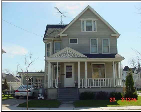
22 Washington Ave 180200 84.040-2-4

Neighborhood: 300 Property Class: 210 - 1 Family Res Sale Date: 11/13/2023 Sale Price: $ 160,000 Prelim 2024 Land Asmt: $ 10,000 Prelim 2024 Asmt: $ 165,000 Building Style: Old Style Exterior Wall: Alum/vinyl Year Built: 1925 Basement Type: Full Grade: Average Condition: Normal SFLA: 1,798 Sale Price/SFLA: $ 88.99 Number Bedrooms: 6 Number Baths: 1.0