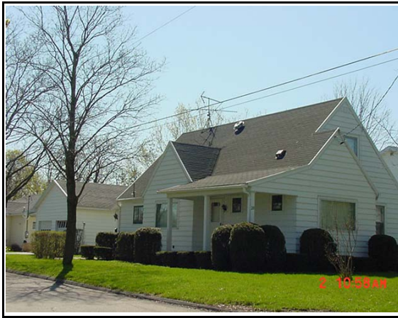
28 Garfield Ave 180200 84.073-2-59

Neighborhood: 500 Property Class: 210 - 1 Family Res Sale Date: 12/7/2023 Sale Price: $ 150,500 Prelim 2024 Land Asmt: $ 10,800 Prelim 2024 Asmt: $ 148,000 Building Style: Cape Cod Exterior Wall: Alum/vinyl Year Built: 1950 Basement Type: Full Grade: Average Condition: Normal SFLA: 1,524 Sale Price/SFLA: $ 98.75 Number Bedrooms: 4 Number Baths: 1.0