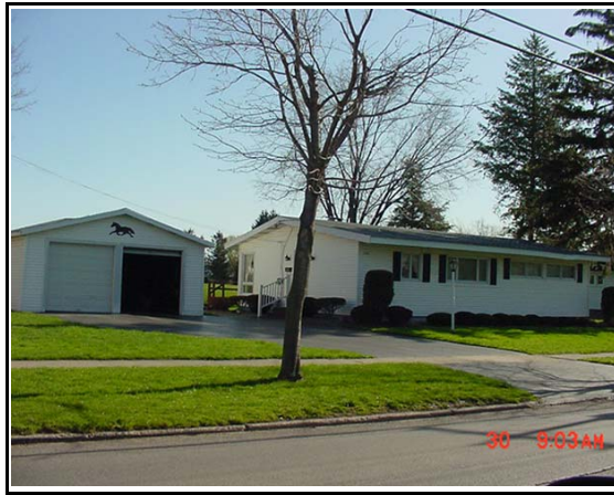
158 South Main St 180200 84.005-2-34

Neighborhood: 500 Property Class: 210 - 1 Family Res Sale Date: 10/31/2022 Sale Price: $ 159,900 Prelim 2024 Land Asmt: $ 15,200 Prelim 2024 Asmt: $ 152,000 Building Style: Ranch Exterior Wall: Wood Year Built: 1965 Basement Type: Full Grade: Average Condition: Normal SFLA: 1,292 Sale Price/SFLA: $ 123.76 Number Bedrooms: 2 Number Baths: 1.5