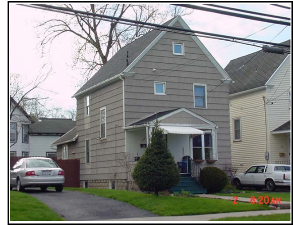
135 Jackson St 180200 84.065-2-49

Neighborhood: 500 Property Class: 210 - 1 Family Res Sale Date: 8/24/2023 Sale Price: $ 160,000 Prelim 2024 Land Asmt: $ 15,800 Prelim 2024 Asmt: $ 166,000 Building Style: Old Style Exterior Wall: Alum/vinyl Year Built: 1900 Basement Type: Full Grade: Average Condition: Normal SFLA: 1,312 Sale Price/SFLA: $ 121.95 Number Bedrooms: 3 Number Baths: 1.0