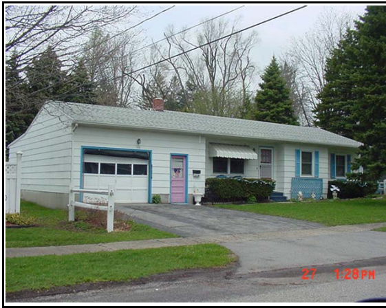
100 Grandview Ter 180200 85.009-2-51

Neighborhood: 200 Property Class: 210 - 1 Family Res Sale Date: 8/10/2022 Sale Price: $ 200,090 Prelim 2024 Land Asmt: $ 17,500 Prelim 2024 Asmt: $ 219,000 Building Style: Ranch Exterior Wall: Wood Year Built: 1966 Basement Type: Full Grade: Average Condition: Normal SFLA: 1,403 Sale Price/SFLA: $ 142.62 Number Bedrooms: 3 Number Baths: 1.5