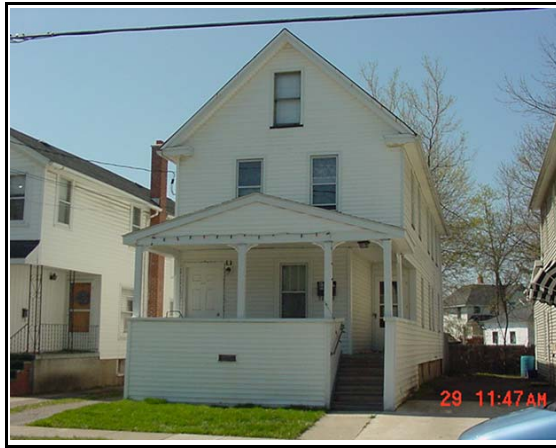
412 Ellicott St 180200 84.074-2-6

Neighborhood: 600 Property Class: 210 - 1 Family Res Sale Date: 11/21/2023 Sale Price: $ 75,000 Prelim 2024 Land Asmt: $ 13,100 Prelim 2024 Asmt: $ 78,000 Building Style: Old Style Exterior Wall: Alum/vinyl Year Built: 1870 Basement Type: Full Grade: Economy Condition: Poor SFLA: 1,648 Sale Price/SFLA: $ 45.51 Number Bedrooms: 3 Number Baths: 1.0