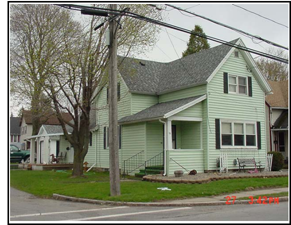
19 Cedar St 180200 85.013-1-52

Neighborhood: 600 Property Class: 220 - 2 Family Res Sale Date: 11/21/2023 Sale Price: $ 110,000 Prelim 2024 Land Asmt: $ 15,100 Prelim 2024 Asmt: $ 114,000 Building Style: Old Style Exterior Wall: Composition Year Built: 1900 Basement Type: Full Grade: Average Condition: Normal SFLA: 1,368 Sale Price/SFLA: $ 80.41 Number Bedrooms: 4 Number Baths: 2.0