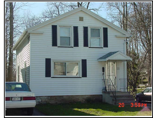
133 State St 180200 84.007-1-9

Neighborhood: 700 Property Class: 210 - 1 Family Res Sale Date: 11/23/2022 Sale Price: $ 105,000 Prelim 2024 Land Asmt: $ 9,200 Prelim 2024 Asmt: $ 89,000 Building Style: Old Style Exterior Wall: Alum/vinyl Year Built: 1900 Basement Type: Partial Grade: Average Condition: Fair SFLA: 1,680 Sale Price/SFLA: $ 62.50 Number Bedrooms: 4 Number Baths: 1.0