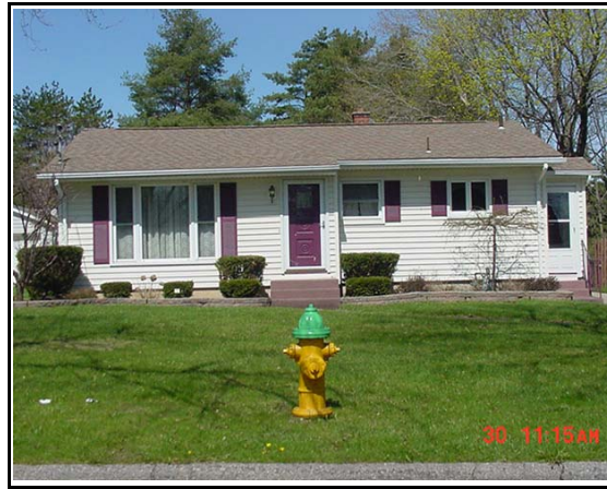
12 Dewey Ave 180200 84.009-2-16

Neighborhood: 500 Property Class: 210 - 1 Family Res Sale Date: 9/27/2023 Sale Price: $ 165,000 Prelim 2024 Land Asmt: $ 17,300 Prelim 2024 Asmt: $ 169,000 Building Style: Ranch Exterior Wall: Alum/vinyl Year Built: 1988 Basement Type: Full Grade: Average Condition: Normal SFLA: 960 Sale Price/SFLA: $ 171.88 Number Bedrooms: 3 Number Baths: 1.0