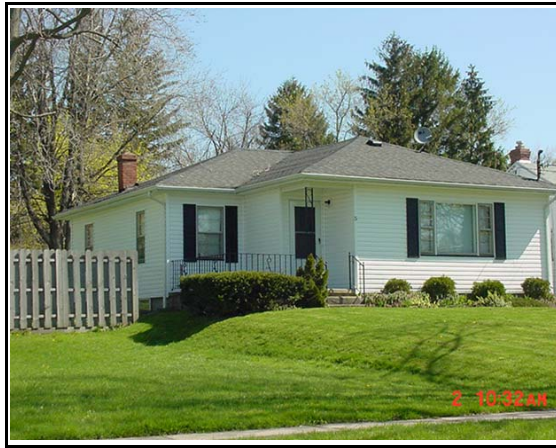
5 Cherry St 180200 84.065-2-26

Neighborhood: 500 Property Class: 210 - 1 Family Res Sale Date: 9/21/2022 Sale Price: $ 95,000 Prelim 2024 Land Asmt: $ 13,400 Prelim 2024 Asmt: $ 132,000 Building Style: Ranch Exterior Wall: Wood Year Built: 1964 Basement Type: Full Grade: Average Condition: Fair SFLA: 1,032 Sale Price/SFLA: $ 92.05 Number Bedrooms: 2 Number Baths: 1.0