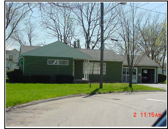
30-32 Warren St 180200 84.073-2-36

Neighborhood: 500 Property Class: 210 - 1 Family Res Sale Date: 10/7/2022 Sale Price: $ 155,200 Prelim 2024 Land Asmt: $ 17,000 Prelim 2024 Asmt: $ 154,000 Building Style: Ranch Exterior Wall: Alum/vinyl Year Built: 1954 Basement Type: Full Grade: Average Condition: Normal SFLA: 1,224 Sale Price/SFLA: $ 126.80 Number Bedrooms: 2 Number Baths: 1.0