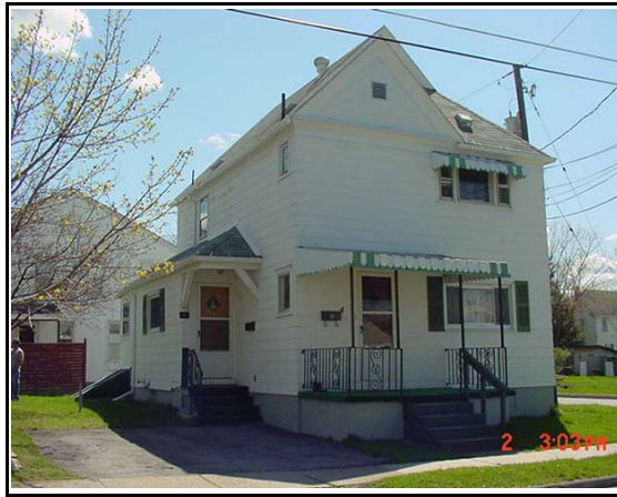
4 Sumner St 180200 84.019-3-18

Neighborhood: 500 Property Class: 210 - 1 Family Res Sale Date: 7/24/2023 Sale Price: $ 119,000 Prelim 2024 Land Asmt: $ 8,500 Prelim 2024 Asmt: $ 119,000 Building Style: Old Style Exterior Wall: Alum/vinyl Year Built: 1920 Basement Type: Full Grade: Average Condition: Normal SFLA: 1,144 Sale Price/SFLA: $ 104.02 Number Bedrooms: 3 Number Baths: 1.0