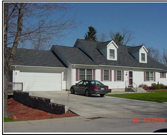
16 Orleans Ave 180200 84.046-1-22

Neighborhood: 500 Property Class: 210 - 1 Family Res Sale Date: 12/7/2023 Sale Price: $ 150,500 Prelim 2024 Land Asmt: $ 10,800 Prelim 2024 Asmt: $ 148,000 Building Style: Cape Cod Exterior Wall: Alum/vinyl Year Built: 1950 Basement Type: Full Grade: Average Condition: Normal SFLA: 1,524 Sale Price/SFLA: $ 98.75 Number Bedrooms: 4 Number Baths: 1.0