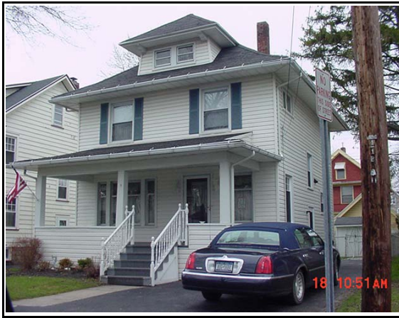
11 Kingsbury Ave 180200 84.031-1-27

Neighborhood: 200 Property Class: 210 - 1 Family Res Sale Date: 8/17/2023 Sale Price: $ 180,000 Prelim 2024 Land Asmt: $ 11,000 Prelim 2024 Asmt: $ 193,000 Building Style: Old Style Exterior Wall: Alum/vinyl Year Built: 1920 Basement Type: Full Grade: Average Condition: Normal SFLA: 1,470 Sale Price/SFLA: $ 122.45 Number Bedrooms: 4 Number Baths: 1.5