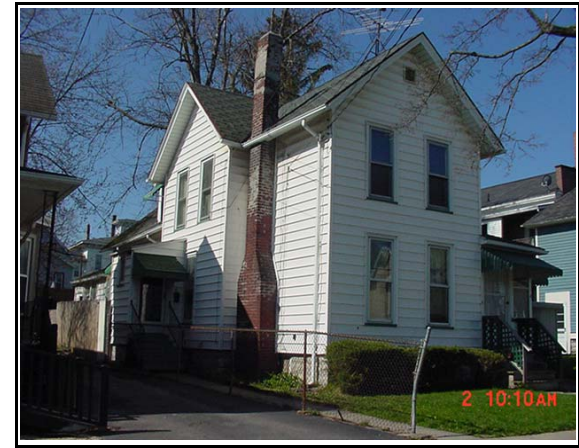
4 Central Ave 180200 84.065-1-14

Neighborhood: 500 Property Class: 210 - 1 Family Res Sale Date: 6/2/2022 Sale Price: $ 182,500 Prelim 2024 Land Asmt: $ 15,100 Prelim 2024 Asmt: $ 117,000 Building Style: Old Style Exterior Wall: Wood Year Built: 1911 Basement Type: Full Grade: Average Condition: Normal SFLA: 1,616 Sale Price/SFLA: $ 112.93 Number Bedrooms: 4 Number Baths: 1.5