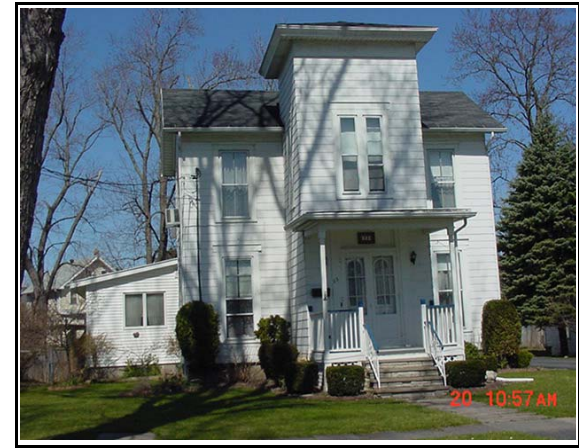
23 Prospect Ave 180200 84.032-1-26

Neighborhood: 200 Property Class: 210 - 1 Family Res Sale Date: 10/31/2023 Sale Price: $ 220,000 Prelim 2024 Land Asmt: $ 16,500 Prelim 2024 Asmt: $ 231,000 Building Style: Old Style Exterior Wall: Alum/vinyl Year Built: 1910 Basement Type: Full Grade: Average Condition: Normal SFLA: 2,070 Sale Price/SFLA: $ 106.28 Number Bedrooms: 4 Number Baths: 1.5