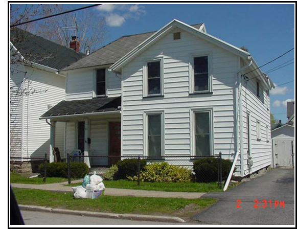
25 Hutchins St 180200 84.074-1-3

Neighborhood: 500 Property Class: 210 - 1 Family Res Sale Date: 8/29/2022 Sale Price: $ 145,000 Prelim 2024 Land Asmt: $ 15,600 Prelim 2024 Asmt: $ 154,000 Building Style: Old Style Exterior Wall: Wood Year Built: 1900 Basement Type: Full Grade: Average Condition: Fair SFLA: 1,978 Sale Price/SFLA: $ 73.31 Number Bedrooms: 4 Number Baths: 1.0