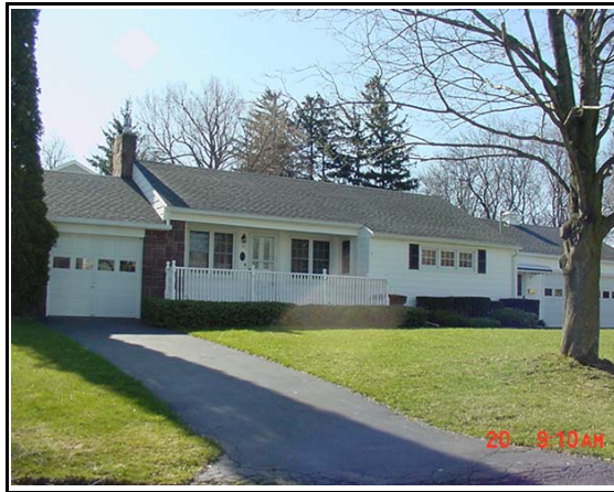
10 Buxton Ave 180200 84.006-2-26

Neighborhood: 200 Property Class: 210 - 1 Family Res Sale Date: 5/20/2022 Sale Price: $ 128,000 Prelim 2024 Land Asmt: $ 14,000 Prelim 2024 Asmt: $ 129,000 Building Style: Ranch Exterior Wall: Alum/vinyl Year Built: 1944 Basement Type: Full Grade: Average Condition: Normal SFLA: 846 Sale Price/SFLA: $ 151.30 Number Bedrooms: 2 Number Baths: 1.0