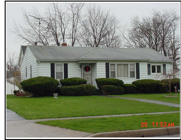
504 North St 180200 84.035-2-1

Neighborhood: 200 Property Class: 210 - 1 Family Res Sale Date: 6/27/2022 Sale Price: $ 210,000 Prelim 2024 Land Asmt: $ 16,400 Prelim 2024 Asmt: $ 219,000 Building Style: Ranch Exterior Wall: Alum/vinyl Year Built: 1961 Basement Type: Full Grade: Average Condition: Normal SFLA: 1,206 Sale Price/SFLA: $ 174.13 Number Bedrooms: 2 Number Baths: 1.0