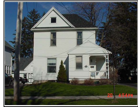
224 State St 180200 84.025-1-53

Neighborhood: 300 Property Class: 210 - 1 Family Res Sale Date: 5/31/2022 Sale Price: $ 200,000 Prelim 2024 Land Asmt: $ 11,900 Prelim 2024 Asmt: $ 221,000 Building Style: Old Style Exterior Wall: Alum/vinyl Year Built: 1928 Basement Type: Full Grade: Average Condition: Normal SFLA: 1,948 Sale Price/SFLA: $ 102.67 Number Bedrooms: 3 Number Baths: 2.0