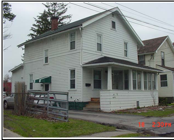
3 Raymond Ave 180200 84.039-2-5

Neighborhood: 300 Property Class: 210 - 1 Family Res Sale Date: 5/26/2023 Sale Price: $ 150,000 Prelim 2024 Land Asmt: $ 8,600 Prelim 2024 Asmt: $ 156,000 Building Style: Old Style Exterior Wall: Alum/vinyl Year Built: 1900 Basement Type: Full Grade: Average Condition: Normal SFLA: 1,362 Sale Price/SFLA: $ 110.13 Number Bedrooms: 4 Number Baths: 1.0