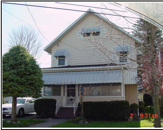
111 Evans St 180200 84.065-1-61

Neighborhood: 500 Property Class: 210 - 1 Family Res Sale Date: 5/20/2022 Sale Price: $ 75,000 Prelim 2024 Land Asmt: $ 15,400 Prelim 2024 Asmt: $ 85,000 Building Style: Old Style Exterior Wall: Alum/vinyl Year Built: 1900 Basement Type: Full Grade: Average Condition: Normal SFLA: 1,680 Sale Price/SFLA: $ 44.64 Number Bedrooms: 4 Number Baths: 1.0