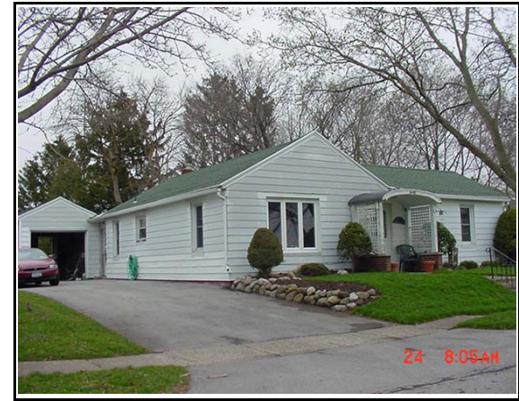
20 Douglas St 180200 71.082-1-54

Neighborhood: 200 Property Class: 210 - 1 Family Res Sale Date: 7/29/2022 Sale Price: $ 187,351 Prelim 2024 Land Asmt: $ 22,100 Prelim 2024 Asmt: $ 191,000 Building Style: Ranch Exterior Wall: Alum/vinyl Year Built: 1950 Basement Type: Full Grade: Average Condition: Normal SFLA: 1,265 Sale Price/SFLA: $ 148.10 Number Bedrooms: 2 Number Baths: 1.0