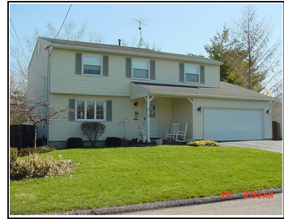
5 Burke Dr 180200 71.018-2-18

Neighborhood: 200 Property Class: 210 - 1 Family Res Sale Date: 4/11/2022 Sale Price: $ 145,000 Prelim 2024 Land Asmt: $ 18,200 Prelim 2024 Asmt: $ 156,000 Building Style: Colonial Exterior Wall: Composition Year Built: 1920 Basement Type: Partial Grade: Average Condition: Normal SFLA: 1,650 Sale Price/SFLA: $ 87.88 Number Bedrooms: 2 Number Baths: 1.5