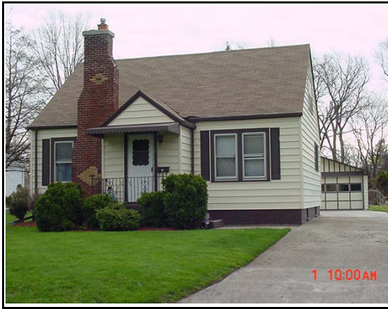
19 Kibbe Ave 180200 84.019-2-63

Neighborhood: 500 Property Class: 210 - 1 Family Res Sale Date: 10/4/2022 Sale Price: $ 95,462 Prelim 2024 Land Asmt: $ 13,000 Prelim 2024 Asmt: $ 107,000 Building Style: Cape Cod Exterior Wall: Alum/vinyl Year Built: 1947 Basement Type: Full Grade: Average Condition: Fair SFLA: 1,214 Sale Price/SFLA: $ 78.63 Number Bedrooms: 3 Number Baths: 1.0