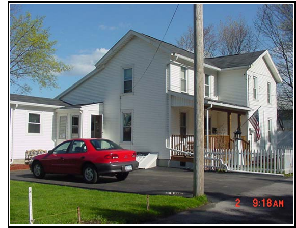
2 Thorp St 180200 84.057-1-5.1

Neighborhood: 500 Property Class: 210 - 1 Family Res Sale Date: 11/1/2023 Sale Price: $ 178,000 Prelim 2024 Land Asmt: $ 10,900 Prelim 2024 Asmt: $ 181,000 Building Style: Old Style Exterior Wall: Wood Year Built: 1915 Basement Type: Full Grade: Average Condition: Normal SFLA: 1,710 Sale Price/SFLA: $ 104.09 Number Bedrooms: 4 Number Baths: 1.5