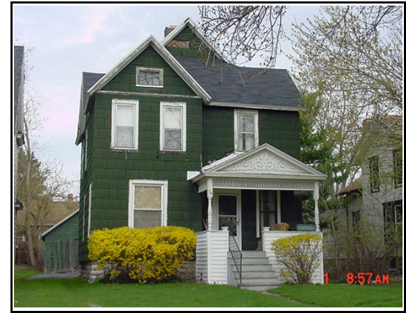
50 Walnut St 180200 84.055-1-16

Neighborhood: 500 Property Class: 220 - 2 Family Res Sale Date: 11/17/2023 Sale Price: $ 75,000 Prelim 2024 Land Asmt: $ 10,600 Prelim 2024 Asmt: $ 85,000 Building Style: Old Style Exterior Wall: Wood Year Built: 1890 Basement Type: Full Grade: Average Condition: Normal SFLA: 2,016 Sale Price/SFLA: $ 37.20 Number Bedrooms: 4 Number Baths: 2.0