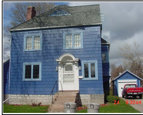
7 Tracy Ave 180200 84.042-1-55

Neighborhood: 300 Property Class: 220 - 2 Family Res Sale Date: 1/14/2022 Sale Price: $ 116,000 Prelim 2024 Land Asmt: $ 13,700 Prelim 2024 Asmt: $ 118,000 Building Style: Old Style Exterior Wall: Wood Year Built: 1880 Basement Type: Full Grade: Average Condition: Fair SFLA: 2,083 Sale Price/SFLA: $ 55.69 Number Bedrooms: 3 Number Baths: 2.0