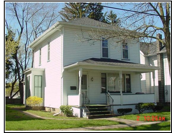
12 Wood St 180200 84.065-2-38

Neighborhood: 500 Property Class: 220 - 2 Family Res Sale Date: 11/30/2023 Sale Price: $ 96,000 Prelim 2024 Land Asmt: $ 6,900 Prelim 2024 Asmt: $ 77,000 Building Style: Old Style Exterior Wall: Composition Year Built: 1890 Basement Type: Full Grade: Average Condition: Normal SFLA: 1,760 Sale Price/SFLA: $ 54.55 Number Bedrooms: 5 Number Baths: 2.0