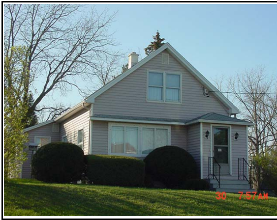
51 River St 180200 84.009-2-66

Neighborhood: 500 Property Class: 210 - 1 Family Res Sale Date: 3/8/2022 Sale Price: $ 131,000 Prelim 2024 Land Asmt: $ 17,200 Prelim 2024 Asmt: $ 154,000 Building Style: Old Style Exterior Wall: Alum/vinyl Year Built: 1925 Basement Type: Partial Grade: Average Condition: Normal SFLA: 1,388 Sale Price/SFLA: $ 94.38 Number Bedrooms: 3 Number Baths: 1.5