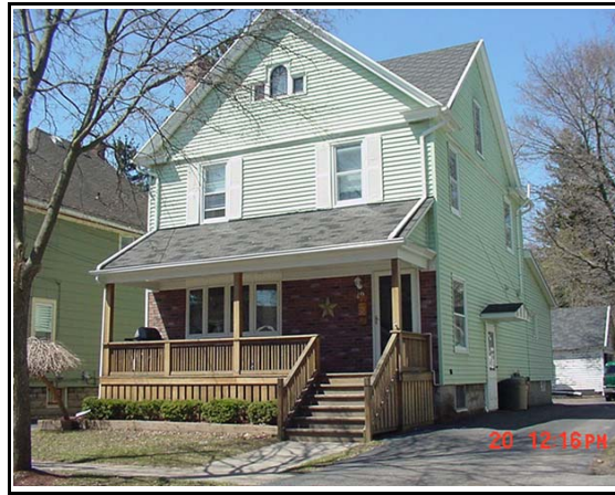
19 Lincoln Ave 180200 84.032-2-37

Neighborhood: 200 Property Class: 210 - 1 Family Res Sale Date: 2/2/2022 Sale Price: $ 181,900 Prelim 2024 Land Asmt: $ 12,300 Prelim 2024 Asmt: $ 205,000 Building Style: Old Style Exterior Wall: Alum/vinyl Year Built: 1900 Basement Type: Full Grade: Average Condition: Normal SFLA: 1,809 Sale Price/SFLA: $ 100.55 Number Bedrooms: 4 Number Baths: 1.5