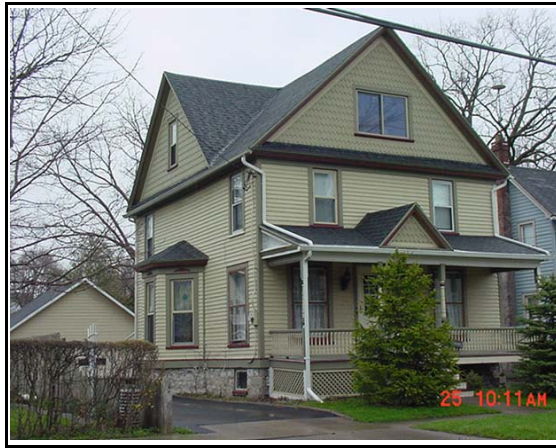
3 East Ave 180200 84.043-1-49

Neighborhood: 300 Property Class: 220 - 2 Family Res Sale Date: 3/15/2023 Sale Price: $ 97,000 Prelim 2024 Land Asmt: $ 9,500 Prelim 2024 Asmt: $ 101,000 Building Style: Old Style Exterior Wall: Alum/vinyl Year Built: 1900 Basement Type: Full Grade: Average Condition: Fair SFLA: 1,646 Sale Price/SFLA: $ 58.93 Number Bedrooms: 4 Number Baths: 2.0