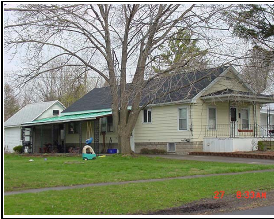
139 Trumbull Pkwy 180200 84.043-2-23.1

Neighborhood: 200 Property Class: 210 - 1 Family Res Sale Date: 6/10/2022 Sale Price: $ 118,000 Prelim 2024 Land Asmt: $ 18,900 Prelim 2024 Asmt: $ 129,000 Building Style: Ranch Exterior Wall: Alum/vinyl Year Built: 1915 Basement Type: Partial Grade: Average Condition: Normal SFLA: 1,144 Sale Price/SFLA: $ 103.15 Number Bedrooms: 2 Number Baths: 1.0