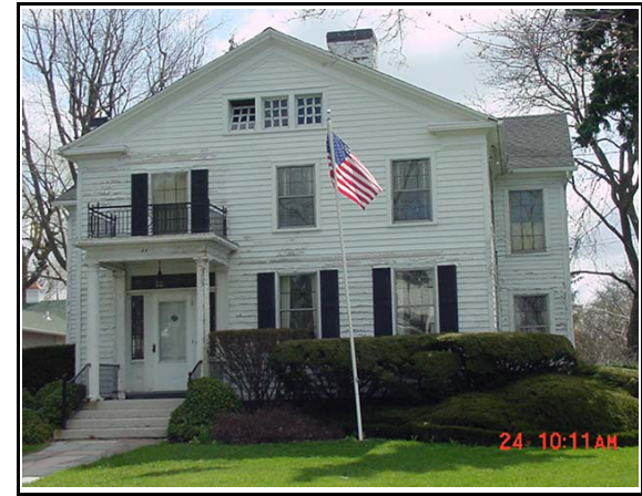
20 Summit St 180200 84.011-2-1

Neighborhood: 300 Property Class: 210 - 1 Family Res Sale Date: 7/24/2023 Sale Price: $ 205,000 Prelim 2024 Land Asmt: $ 14,400 Prelim 2024 Asmt: $ 224,000 Building Style: Old Style Exterior Wall: Alum/vinyl Year Built: 1900 Basement Type: Full Grade: Average Condition: Normal SFLA: 3,268 Sale Price/SFLA: $ 62.73 Number Bedrooms: 3 Number Baths: 2.5