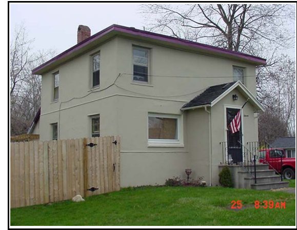
11 Bryant St 180200 84.008-1-88

Neighborhood: 200 Property Class: 210 - 1 Family Res Sale Date: 6/6/2022 Sale Price: $ 166,500 Prelim 2024 Land Asmt: $ 17,500 Prelim 2024 Asmt: $ 173,000 Building Style: Old Style Exterior Wall: Composition Year Built: 1931 Basement Type: Full Grade: Average Condition: Normal SFLA: 1,176 Sale Price/SFLA: $ 141.58 Number Bedrooms: 3 Number Baths: 1.0