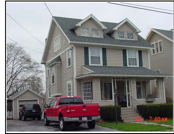
6 Norris Ave 180200 84.026-1-82.1

Neighborhood: 200 Property Class: 210 - 1 Family Res Sale Date: 8/25/2023 Sale Price: $ 203,000 Prelim 2024 Land Asmt: $ 15,300 Prelim 2024 Asmt: $ 206,000 Building Style: Old Style Exterior Wall: Alum/vinyl Year Built: 1925 Basement Type: Full Grade: Average Condition: Normal SFLA: 1,662 Sale Price/SFLA: $ 122.14 Number Bedrooms: 3 Number Baths: 1.5