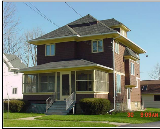
128 South Main St 180200 84.009-3-9

Neighborhood: 500 Property Class: 220 - 2 Family Res Sale Date: 4/19/2023 Sale Price: $ 65,000 Prelim 2024 Land Asmt: $ 11,500 Prelim 2024 Asmt: $ 94,000 Building Style: Old Style Exterior Wall: Alum/vinyl Year Built: 1900 Basement Type: Full Grade: Average Condition: Poor SFLA: 1,442 Sale Price/SFLA: $ 45.08 Number Bedrooms: 3 Number Baths: 2.0