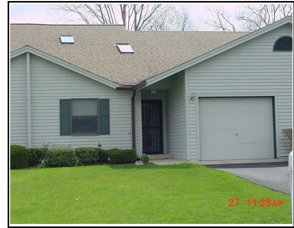
6 North Pointe Dr 180200 84.008-2-70

Neighborhood: 100 Property Class: 210 - 1 Family Res Sale Date: 6/26/2023 Sale Price: $ 225,000 Prelim 2024 Land Asmt: $ 9,900 Prelim 2024 Asmt: $ 232,000 Building Style: Town House Exterior Wall: Wood Year Built: 1990 Basement Type: Full Grade: Average Condition: Normal SFLA: 1,613 Sale Price/SFLA: $ 139.49 Number Bedrooms: 2 Number Baths: 2.5