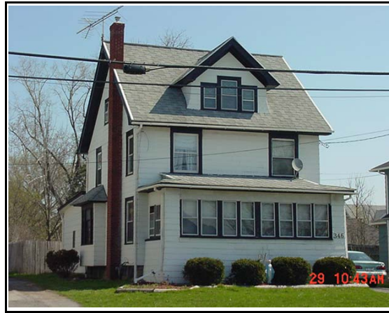
346 West Main St 180200 84.005-2-19

Neighborhood: 300 Property Class: 220 - 2 Family Res Sale Date: 9/7/2023 Sale Price: $ 90,000 Prelim 2024 Land Asmt: $ 8,300 Prelim 2024 Asmt: $ 107,000 Building Style: Old Style Exterior Wall: Wood Year Built: 1890 Basement Type: Full Grade: Average Condition: Poor SFLA: 1,986 Sale Price/SFLA: $ 45.32 Number Bedrooms: 5 Number Baths: 2.0