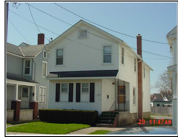
414 Ellicott St 180200 84.074-2-7

Neighborhood: 600 Property Class: 210 - 1 Family Res Sale Date: 11/30/2023 Sale Price: $ 175,000 Prelim 2024 Land Asmt: $ 16,800 Prelim 2024 Asmt: $ 223,000 Building Style: Old Style Exterior Wall: Wood Year Built: 1890 Basement Type: Full Grade: Average Condition: Normal SFLA: 1,624 Sale Price/SFLA: $ 107.76 Number Bedrooms: 4 Number Baths: 2.0