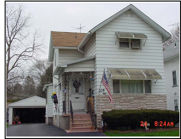
205 Bank St 180200 84.025-1-27

Neighborhood: 300 Property Class: 210 - 1 Family Res Sale Date: 5/12/2023 Sale Price: $ 187,000 Prelim 2024 Land Asmt: $ 9,500 Prelim 2024 Asmt: $ 189,000 Building Style: Old Style Exterior Wall: Alum/vinyl Year Built: 1900 Basement Type: Full Grade: Average Condition: Normal SFLA: 1,476 Sale Price/SFLA: $ 126.69 Number Bedrooms: 4 Number Baths: 1.5