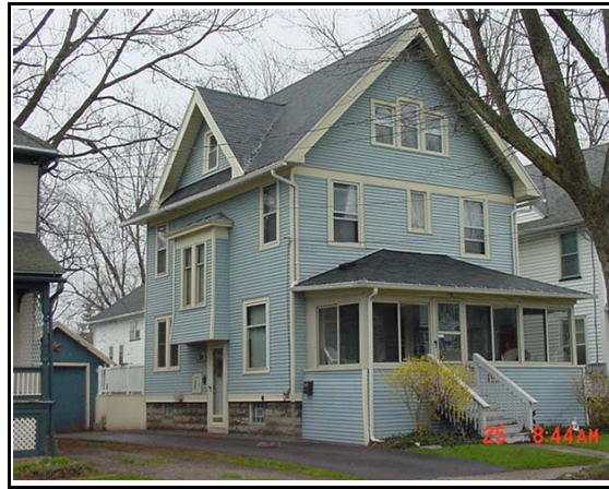
170 Ross St 180200 84.035-1-77

Neighborhood: 300 Property Class: 210 - 1 Family Res Sale Date: 5/5/2022 Sale Price: $ 75,000 Prelim 2024 Land Asmt: $ 0 Prelim 2024 Asmt: $ 96,000 Building Style: Old Style Exterior Wall: Alum/vinyl Year Built: 1880 Basement Type: Full Grade: Average Condition: Normal SFLA: 1,469 Sale Price/SFLA: $ 51.06 Number Bedrooms: 2 Number Baths: 1.5