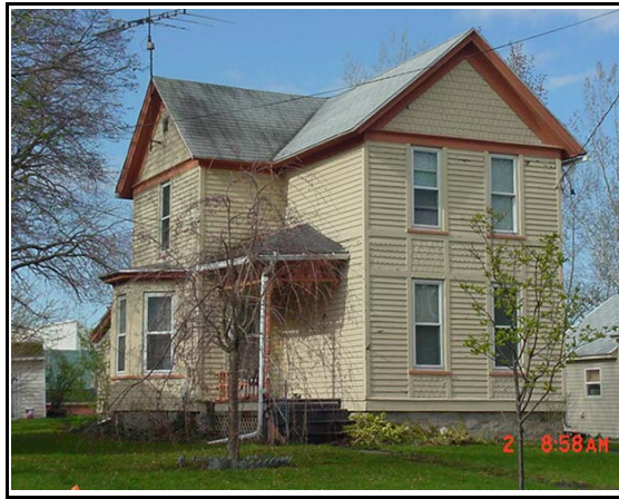
41 Maple St 180200 84.064-1-19

Neighborhood: 500 Property Class: 220 - 2 Family Res Sale Date: 1/26/2022 Sale Price: $ 58,316 Prelim 2024 Land Asmt: $ 16,000 Prelim 2024 Asmt: $ 100,000 Building Style: Old Style Exterior Wall: Wood Year Built: 1900 Basement Type: Full Grade: Average Condition: Normal SFLA: 1,402 Sale Price/SFLA: $ 41.59 Number Bedrooms: 3 Number Baths: 2.0