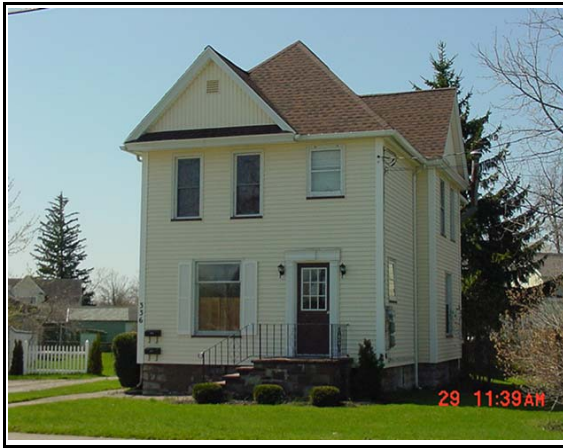
336 Ellicott St 180200 84.066-2-33

Neighborhood: 600 Property Class: 220 - 2 Family Res Sale Date: 6/28/2023 Sale Price: $ 122,000 Prelim 2024 Land Asmt: $ 17,400 Prelim 2024 Asmt: $ 126,000 Building Style: Old Style Exterior Wall: Alum/vinyl Year Built: 1880 Basement Type: Full Grade: Average Condition: Fair SFLA: 1,506 Sale Price/SFLA: $ 81.01 Number Bedrooms: 2 Number Baths: 2.0