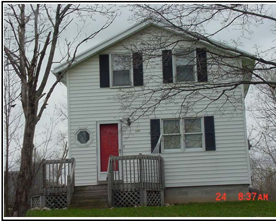
305 Bank St 180200 71.019-1-14

Neighborhood: 300 Property Class: 210 - 1 Family Res Sale Date: 5/5/2022 Sale Price: $ 75,000 Prelim 2024 Land Asmt: $ 0 Prelim 2024 Asmt: $ 96,000 Building Style: Old Style Exterior Wall: Alum/vinyl Year Built: 1880 Basement Type: Full Grade: Average Condition: Normal SFLA: 1,469 Sale Price/SFLA: $ 51.06 Number Bedrooms: 2 Number Baths: 1.5