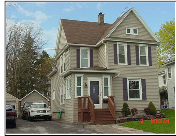
5 Maple St 180200 84.015-2-9

Neighborhood: 500 Property Class: 220 - 2 Family Res Sale Date: 5/20/2022 Sale Price: $ 80,580 Prelim 2024 Land Asmt: $ 11,400 Prelim 2024 Asmt: $ 86,000 Building Style: Old Style Exterior Wall: Wood Year Built: 1900 Basement Type: Full Grade: Average Condition: Normal SFLA: 1,587 Sale Price/SFLA: $ 50.78 Number Bedrooms: 4 Number Baths: 3.0