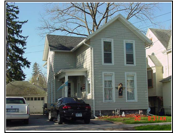
43 South Main St 180200 84.047-2-15

Neighborhood: 500 Property Class: 210 - 1 Family Res Sale Date: 5/6/2022 Sale Price: $ 78,000 Prelim 2024 Land Asmt: $ 10,200 Prelim 2024 Asmt: $ 111,000 Building Style: Old Style Exterior Wall: Alum/vinyl Year Built: 1880 Basement Type: Full Grade: Average Condition: Normal SFLA: 1,559 Sale Price/SFLA: $ 50.03 Number Bedrooms: 3 Number Baths: 2.0