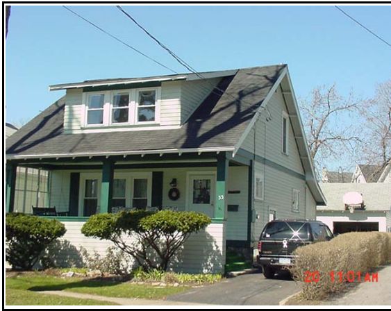
33 Prospect Ave 180200 84.032-1-22

Neighborhood: 200 Property Class: 210 - 1 Family Res Sale Date: 7/21/2023 Sale Price: $ 227,000 Prelim 2024 Land Asmt: $ 13,900 Prelim 2024 Asmt: $ 227,000 Building Style: Old Style Exterior Wall: Wood Year Built: 1925 Basement Type: Full Grade: Average Condition: Normal SFLA: 1,327 Sale Price/SFLA: $ 171.06 Number Bedrooms: 3 Number Baths: 1.5