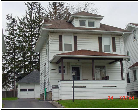
13 Norris Ave 180200 84.025-1-8

Neighborhood: 200 Property Class: 210 - 1 Family Res Sale Date: 8/11/2022 Sale Price: $ 150,000 Prelim 2024 Land Asmt: $ 14,000 Prelim 2024 Asmt: $ 139,000 Building Style: Old Style Exterior Wall: Alum/vinyl Year Built: 1915 Basement Type: Full Grade: Average Condition: Normal SFLA: 1,396 Sale Price/SFLA: $ 107.45 Number Bedrooms: 4 Number Baths: 1.0