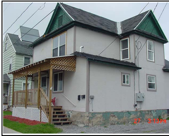
9-11 Mckinley Ave 180200 84.059-2-38

Neighborhood: 600 Property Class: 210 - 1 Family Res Sale Date: 7/28/2023 Sale Price: $ 90,000 Prelim 2024 Land Asmt: $ 9,900 Prelim 2024 Asmt: $ 91,000 Building Style: Old Style Exterior Wall: Alum/vinyl Year Built: 1890 Basement Type: Full Grade: Average Condition: Normal SFLA: 1,352 Sale Price/SFLA: $ 66.57 Number Bedrooms: 2 Number Baths: 1.0