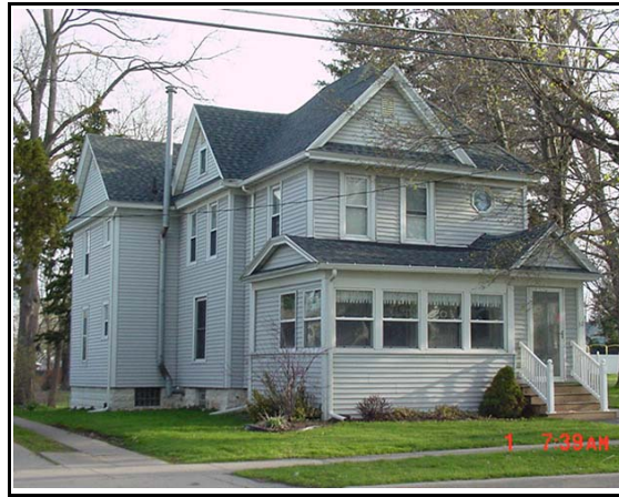
52 Pearl St 180200 84.047-2-51

Neighborhood: 500 Property Class: 220 - 2 Family Res Sale Date: 4/8/2022 Sale Price: $ 120,000 Prelim 2024 Land Asmt: $ 14,400 Prelim 2024 Asmt: $ 137,000 Building Style: Old Style Exterior Wall: Alum/vinyl Year Built: 1925 Basement Type: Full Grade: Average Condition: Normal SFLA: 2,176 Sale Price/SFLA: $ 55.15 Number Bedrooms: 6 Number Baths: 2.0