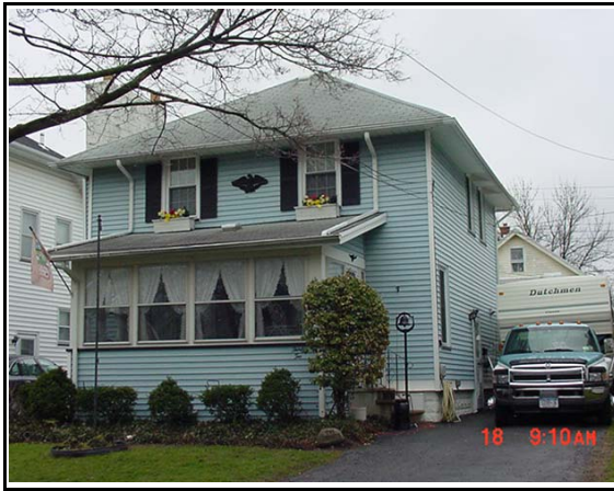
32 Union St 180200 84.023-1-42

Neighborhood: 300 Property Class: 210 - 1 Family Res Sale Date: 12/19/2022 Sale Price: $ 122,000 Prelim 2024 Land Asmt: $ 9,000 Prelim 2024 Asmt: $ 148,000 Building Style: Old Style Exterior Wall: Alum/vinyl Year Built: 1925 Basement Type: Full Grade: Average Condition: Normal SFLA: 1,300 Sale Price/SFLA: $ 93.85 Number Bedrooms: 3 Number Baths: 1.5