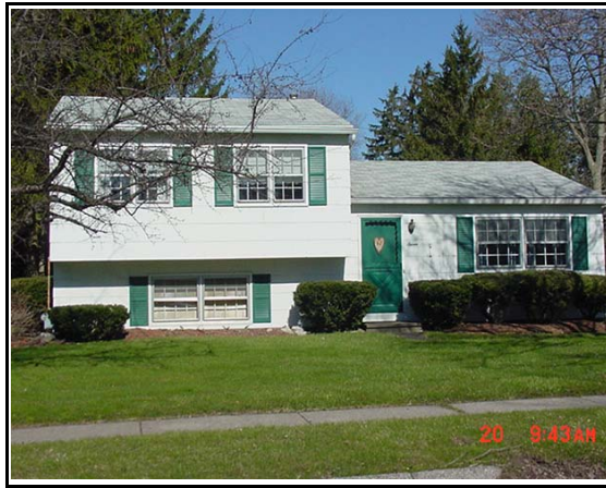
7 Gateway Dr 180200 71.018-2-33

Neighborhood: 200 Property Class: 210 - 1 Family Res Sale Date: 3/8/2022 Sale Price: $ 295,000 Prelim 2024 Land Asmt: $ 20,400 Prelim 2024 Asmt: $ 301,000 Building Style: R. Ranch Exterior Wall: Alum/vinyl Year Built: 1989 Basement Type: Full Grade: Average Condition: Normal SFLA: 2,426 Sale Price/SFLA: $ 121.60 Number Bedrooms: 3 Number Baths: 1.5