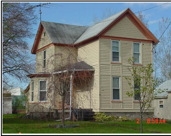
41 Maple St 180200 84.064-1-19

Neighborhood: 500 Property Class: 220 - 2 Family Res Sale Date: 1/26/2022 Sale Price: $ 58,316 Prelim 2024 Land Asmt: $ 16,000 Prelim 2024 Asmt: $ 100,000 Building Style: Old Style Exterior Wall: Wood Year Built: 1900 Basement Type: Full Grade: Average Condition: Normal SFLA: 1,402 Sale Price/SFLA: $ 41.59 Number Bedrooms: 3 Number Baths: 2.0