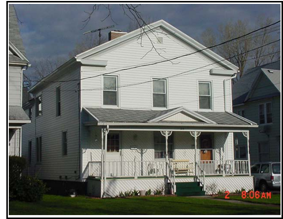
124 Jackson St 180200 84.065-1-41

Neighborhood: 500 Property Class: 220 - 2 Family Res Sale Date: 6/27/2023 Sale Price: $ 127,500 Prelim 2024 Land Asmt: $ 10,200 Prelim 2024 Asmt: $ 129,000 Building Style: Old Style Exterior Wall: Alum/vinyl Year Built: 1900 Basement Type: Full Grade: Average Condition: Normal SFLA: 2,576 Sale Price/SFLA: $ 49.50 Number Bedrooms: 6 Number Baths: 2.5