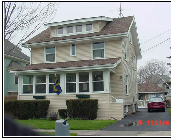
21 Vernon Ave 180200 84.023-2-24

Neighborhood: 200 Property Class: 210 - 1 Family Res Sale Date: 2/23/2023 Sale Price: $ 147,500 Prelim 2024 Land Asmt: $ 14,600 Prelim 2024 Asmt: $ 168,000 Building Style: Old Style Exterior Wall: Alum/vinyl Year Built: 1920 Basement Type: Full Grade: Average Condition: Normal SFLA: 1,660 Sale Price/SFLA: $ 88.86 Number Bedrooms: 3 Number Baths: 1.0