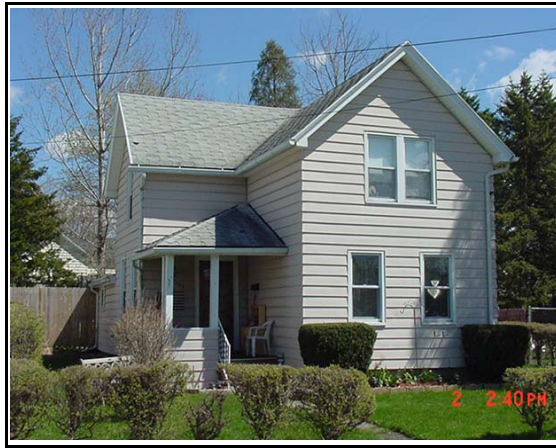
129 Hutchins St 180200 84.082-1-28

Neighborhood: 500 Property Class: 210 - 1 Family Res Sale Date: 12/21/2022 Sale Price: $ 172,000 Prelim 2024 Land Asmt: $ 16,600 Prelim 2024 Asmt: $ 189,000 Building Style: Old Style Exterior Wall: Wood Year Built: 1924 Basement Type: Full Grade: Average Condition: Normal SFLA: 1,272 Sale Price/SFLA: $ 135.22 Number Bedrooms: 4 Number Baths: 1.0