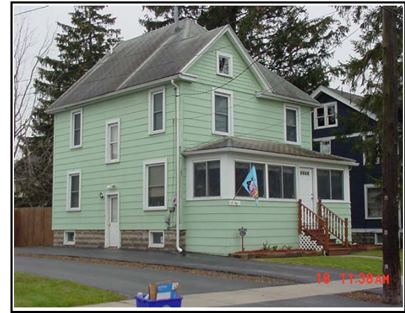
46 Lyon St 180200 84.024-1-57

Neighborhood: 300 Property Class: 210 - 1 Family Res Sale Date: 3/30/2022 Sale Price: $ 80,000 Prelim 2024 Land Asmt: $ 14,900 Prelim 2024 Asmt: $ 126,000 Building Style: Old Style Exterior Wall: Alum/vinyl Year Built: 1890 Basement Type: Full Grade: Average Condition: Normal SFLA: 1,342 Sale Price/SFLA: $ 59.61 Number Bedrooms: 3 Number Baths: 1.5