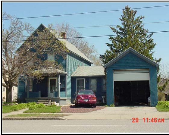
411 Ellicott St 180200 84.015-3-17

Neighborhood: 600 Property Class: 210 - 1 Family Res Sale Date: 1/18/2022 Sale Price: $ 124,000 Prelim 2024 Land Asmt: $ 15,700 Prelim 2024 Asmt: $ 135,000 Building Style: Old Style Exterior Wall: Wood Year Built: 1890 Basement Type: Full Grade: Average Condition: Normal SFLA: 2,064 Sale Price/SFLA: $ 60.08 Number Bedrooms: 4 Number Baths: 2.0