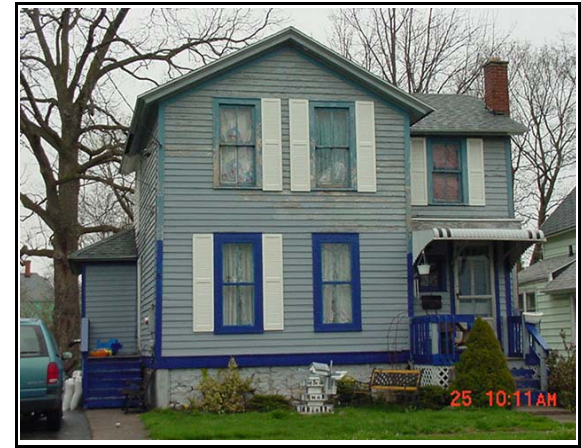
7 East Ave 180200 84.043-1-47

Neighborhood: 300 Property Class: 210 - 1 Family Res Sale Date: 1/13/2022 Sale Price: $ 100,000 Prelim 2024 Land Asmt: $ 12,600 Prelim 2024 Asmt: $ 126,000 Building Style: Old Style Exterior Wall: Wood Year Built: 1910 Basement Type: Full Grade: Average Condition: Normal SFLA: 1,376 Sale Price/SFLA: $ 72.67 Number Bedrooms: 3 Number Baths: 1.5