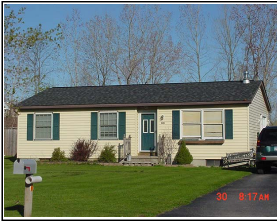
66 River St 180200 84.009-1-21

Neighborhood: 500 Property Class: 210 - 1 Family Res Sale Date: 9/27/2023 Sale Price: $ 165,000 Prelim 2024 Land Asmt: $ 17,300 Prelim 2024 Asmt: $ 169,000 Building Style: Ranch Exterior Wall: Alum/vinyl Year Built: 1988 Basement Type: Full Grade: Average Condition: Normal SFLA: 960 Sale Price/SFLA: $ 171.88 Number Bedrooms: 3 Number Baths: 1.0