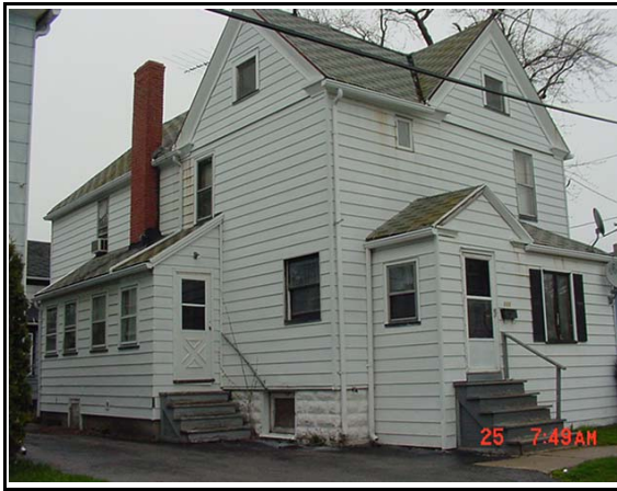
111 Ellsworth Ave 180200 84.043-1-36

Neighborhood: 300 Property Class: 220 - 2 Family Res Sale Date: 10/4/2022 Sale Price: $ 84,000 Prelim 2024 Land Asmt: $ 8,300 Prelim 2024 Asmt: $ 109,000 Building Style: Old Style Exterior Wall: Alum/vinyl Year Built: 1900 Basement Type: Full Grade: Average Condition: Normal SFLA: 2,150 Sale Price/SFLA: $ 39.07 Number Bedrooms: 6 Number Baths: 2.0