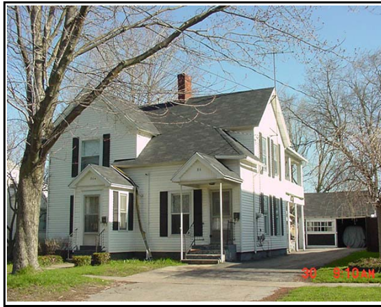
86 South Main St 180200 84.039-1-32

Neighborhood: 500 Property Class: 220 - 2 Family Res Sale Date: 7/31/2023 Sale Price: $ 82,500 Prelim 2024 Land Asmt: $ 8,700 Prelim 2024 Asmt: $ 80,000 Building Style: Old Style Exterior Wall: Wood Year Built: 1900 Basement Type: Full Grade: Average Condition: Poor SFLA: 1,936 Sale Price/SFLA: $ 42.61 Number Bedrooms: 4 Number Baths: 2.0