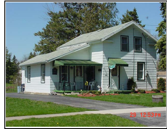
138 Harvester Ave 180200 84.075-1-17

Neighborhood: 600 Property Class: 210 - 1 Family Res Sale Date: 7/26/2022 Sale Price: $ 75,000 Prelim 2024 Land Asmt: $ 12,800 Prelim 2024 Asmt: $ 72,000 Building Style: Old Style Exterior Wall: Composition Year Built: 1900 Basement Type: Full Grade: Average Condition: Fair SFLA: 1,038 Sale Price/SFLA: $ 72.25 Number Bedrooms: 2 Number Baths: 1.0