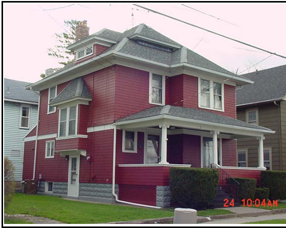
2 Tracy Ave 180200 84.042-1-33

Neighborhood: 300 Property Class: 210 - 1 Family Res Sale Date: 3/31/2023 Sale Price: $ 130,000 Prelim 2024 Land Asmt: $ 7,100 Prelim 2024 Asmt: $ 139,000 Building Style: Old Style Exterior Wall: Wood Year Built: 1915 Basement Type: Full Grade: Average Condition: Normal SFLA: 1,416 Sale Price/SFLA: $ 91.81 Number Bedrooms: 3 Number Baths: 1.0