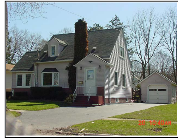
32 Prospect Ave 180200 84.006-4-57

Neighborhood: 200 Property Class: 210 - 1 Family Res Sale Date: 2/8/2022 Sale Price: $ 149,900 Prelim 2024 Land Asmt: $ 18,200 Prelim 2024 Asmt: $ 154,000 Building Style: Cape Cod Exterior Wall: Alum/vinyl Year Built: 1950 Basement Type: Crawl Grade: Average Condition: Normal SFLA: 1,170 Sale Price/SFLA: $ 128.12 Number Bedrooms: 2 Number Baths: 1.0