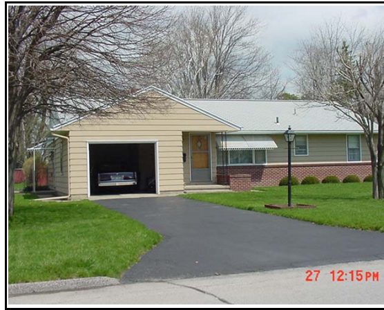
15 Fordham Dr 180200 85.009-1-38

Neighborhood: 200 Property Class: 210 - 1 Family Res Sale Date: 8/25/2022 Sale Price: $ 220,000 Prelim 2024 Land Asmt: $ 18,400 Prelim 2024 Asmt: $ 200,000 Building Style: Ranch Exterior Wall: Wood Year Built: 1963 Basement Type: Full Grade: Average Condition: Normal SFLA: 1,376 Sale Price/SFLA: $ 159.88 Number Bedrooms: 3 Number Baths: 1.5