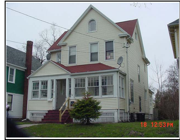
11 Montclair Ave 180200 84.031-2-17

Neighborhood: 300 Property Class: 220 - 2 Family Res Sale Date: 4/27/2022 Sale Price: $ 64,000 Prelim 2024 Land Asmt: $ 13,700 Prelim 2024 Asmt: $ 94,000 Building Style: Old Style Exterior Wall: Alum/vinyl Year Built: 1900 Basement Type: Full Grade: Average Condition: Normal SFLA: 1,730 Sale Price/SFLA: $ 36.99 Number Bedrooms: 3 Number Baths: 2.0