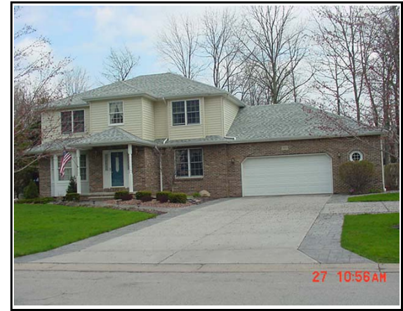
395 Garden Dr 180200 85.005-1-77

Neighborhood: 100 Property Class: 210 - 1 Family Res Sale Date: 4/28/2022 Sale Price: $ 310,000 Prelim 2024 Land Asmt: $ 31,600 Prelim 2024 Asmt: $ 319,000 Building Style: Colonial Exterior Wall: Alum/vinyl Year Built: 1977 Basement Type: Full Grade: Average Condition: Normal SFLA: 2,619 Sale Price/SFLA: $ 118.37 Number Bedrooms: 4 Number Baths: 2.5