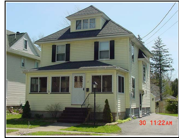
17 Brooklyn Ave 180200 84.047-2-63

Neighborhood: 500 Property Class: 210 - 1 Family Res Sale Date: 12/16/2022 Sale Price: $ 145,000 Prelim 2024 Land Asmt: $ 16,900 Prelim 2024 Asmt: $ 143,000 Building Style: Old Style Exterior Wall: Wood Year Built: 1912 Basement Type: Full Grade: Average Condition: Normal SFLA: 1,476 Sale Price/SFLA: $ 98.24 Number Bedrooms: 3 Number Baths: 1.0