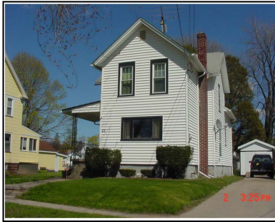
27 Otis St 180200 84.020-2-76

Neighborhood: 500 Property Class: 210 - 1 Family Res Sale Date: 2/13/2023 Sale Price: $ 139,900 Prelim 2024 Land Asmt: $ 13,100 Prelim 2024 Asmt: $ 142,000 Building Style: Old Style Exterior Wall: Wood Year Built: 1920 Basement Type: Full Grade: Average Condition: Normal SFLA: 1,312 Sale Price/SFLA: $ 106.63 Number Bedrooms: 4 Number Baths: 1.0