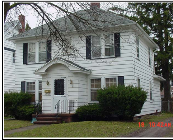
30 Kingsbury Ave 180200 84.023-2-29

Neighborhood: 200 Property Class: 210 - 1 Family Res Sale Date: 8/17/2023 Sale Price: $ 180,000 Prelim 2024 Land Asmt: $ 11,000 Prelim 2024 Asmt: $ 193,000 Building Style: Old Style Exterior Wall: Alum/vinyl Year Built: 1920 Basement Type: Full Grade: Average Condition: Normal SFLA: 1,470 Sale Price/SFLA: $ 122.45 Number Bedrooms: 4 Number Baths: 1.5