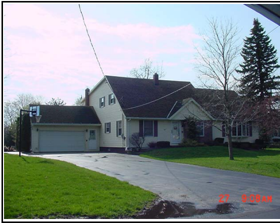
108 North Spruce St 180200 84.012-2-67

Neighborhood: 200 Property Class: 210 - 1 Family Res Sale Date: 2/4/2022 Sale Price: $ 259,900 Prelim 2024 Land Asmt: $ 23,000 Prelim 2024 Asmt: $ 280,000 Building Style: Cape Cod Exterior Wall: Alum/vinyl Year Built: 1950 Basement Type: Partial Grade: Average Condition: Good SFLA: 3,160 Sale Price/SFLA: $ 82.25 Number Bedrooms: 4 Number Baths: 2.0