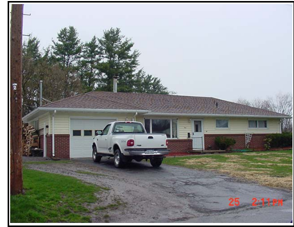
1 Farwell Dr 180200 84.008-1-74

Neighborhood: 200 Property Class: 210 - 1 Family Res Sale Date: 11/17/2022 Sale Price: $ 180,000 Prelim 2024 Land Asmt: $ 23,400 Prelim 2024 Asmt: $ 191,000 Building Style: Ranch Exterior Wall: Wood Year Built: 1959 Basement Type: Full Grade: Average Condition: Normal SFLA: 1,388 Sale Price/SFLA: $ 129.68 Number Bedrooms: 3 Number Baths: 1.0