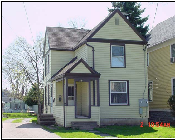
29 Pringle Ave 180200 84.066-1-32

Neighborhood: 500 Property Class: 220 - 2 Family Res Sale Date: 4/19/2023 Sale Price: $ 65,000 Prelim 2024 Land Asmt: $ 11,500 Prelim 2024 Asmt: $ 94,000 Building Style: Old Style Exterior Wall: Alum/vinyl Year Built: 1900 Basement Type: Full Grade: Average Condition: Poor SFLA: 1,442 Sale Price/SFLA: $ 45.08 Number Bedrooms: 3 Number Baths: 2.0