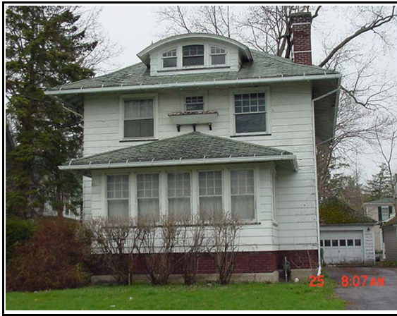
103 Ross St 180200 84.042-2-21

Neighborhood: 300 Property Class: 210 - 1 Family Res Sale Date: 6/5/2023 Sale Price: $ 205,000 Prelim 2024 Land Asmt: $ 16,300 Prelim 2024 Asmt: $ 207,000 Building Style: Old Style Exterior Wall: Wood Year Built: 1915 Basement Type: Full Grade: Average Condition: Normal SFLA: 2,202 Sale Price/SFLA: $ 93.10 Number Bedrooms: 4 Number Baths: 1.5