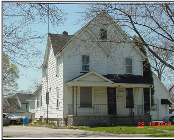
452 Ellicott St 180200 84.020-2-4.1

Neighborhood: 600 Property Class: 210 - 1 Family Res Sale Date: 11/15/2022 Sale Price: $ 85,000 Prelim 2024 Land Asmt: $ 10,200 Prelim 2024 Asmt: $ 87,000 Building Style: Old Style Exterior Wall: Alum/vinyl Year Built: 1900 Basement Type: Full Grade: Average Condition: Normal SFLA: 1,408 Sale Price/SFLA: $ 60.37 Number Bedrooms: 4 Number Baths: 1.0