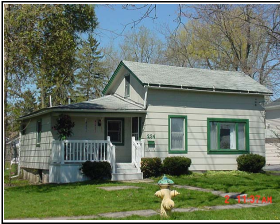
234 Liberty St 180200 84.073-2-20

Neighborhood: 500 Property Class: 210 - 1 Family Res Sale Date: 1/28/2022 Sale Price: $ 80,000 Prelim 2024 Land Asmt: $ 15,800 Prelim 2024 Asmt: $ 80,000 Building Style: Old Style Exterior Wall: Wood Year Built: 1840 Basement Type: Partial Grade: Average Condition: Normal SFLA: 920 Sale Price/SFLA: $ 86.96 Number Bedrooms: 2 Number Baths: 1.0