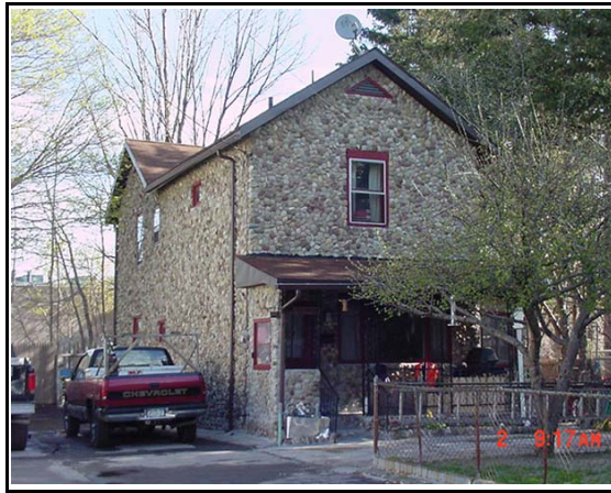
1 Thorp St 180200 84.057-1-6

Neighborhood: 500 Property Class: 220 - 2 Family Res Sale Date: 7/25/2022 Sale Price: $ 79,000 Prelim 2024 Land Asmt: $ 17,800 Prelim 2024 Asmt: $ 94,000 Building Style: Old Style Exterior Wall: Alum/vinyl Year Built: 1880 Basement Type: Partial Grade: Economy Condition: Poor SFLA: 1,648 Sale Price/SFLA: $ 47.94 Number Bedrooms: 3 Number Baths: 2.0