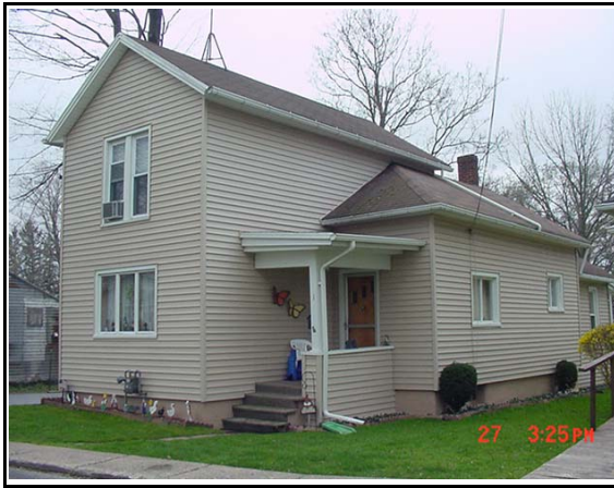
1 Prune St 180200 84.059-2-25

Neighborhood: 600 Property Class: 210 - 1 Family Res Sale Date: 7/28/2023 Sale Price: $ 90,000 Prelim 2024 Land Asmt: $ 9,900 Prelim 2024 Asmt: $ 91,000 Building Style: Old Style Exterior Wall: Alum/vinyl Year Built: 1890 Basement Type: Full Grade: Average Condition: Normal SFLA: 1,352 Sale Price/SFLA: $ 66.57 Number Bedrooms: 2 Number Baths: 1.0