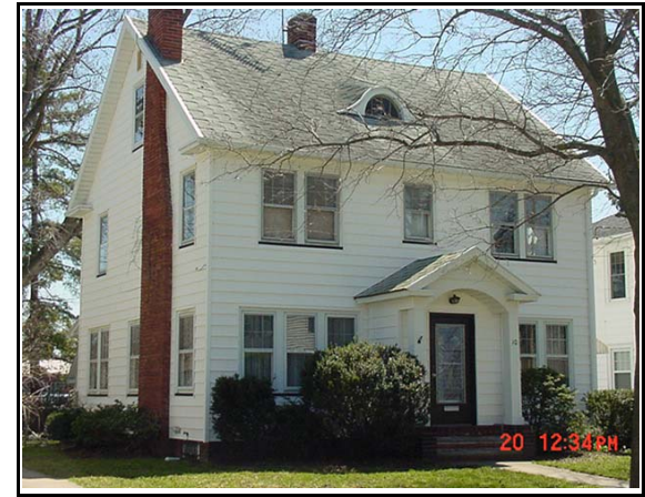
10 Lewis Ave 180200 84.033-1-10

Neighborhood: 200 Property Class: 210 - 1 Family Res Sale Date: 4/21/2022 Sale Price: $ 170,555 Prelim 2024 Land Asmt: $ 16,200 Prelim 2024 Asmt: $ 177,000 Building Style: Old Style Exterior Wall: Alum/vinyl Year Built: 1925 Basement Type: Full Grade: Average Condition: Normal SFLA: 1,632 Sale Price/SFLA: $ 104.51 Number Bedrooms: 4 Number Baths: 2.0