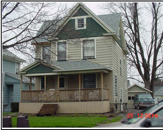
101 North St 180200 84.026-1-43

Neighborhood: 300 Property Class: 210 - 1 Family Res Sale Date: 7/20/2023 Sale Price: $ 177,000 Prelim 2024 Land Asmt: $ 10,600 Prelim 2024 Asmt: $ 122,000 Building Style: Old Style Exterior Wall: Wood Year Built: 1900 Basement Type: Full Grade: Average Condition: Normal SFLA: 1,452 Sale Price/SFLA: $ 121.90 Number Bedrooms: 3 Number Baths: 2.0