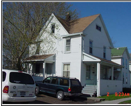
1 Watson St 180200 84.065-1-11

Neighborhood: 500 Property Class: 210 - 1 Family Res Sale Date: 4/18/2023 Sale Price: $ 123,800 Prelim 2024 Land Asmt: $ 24,200 Prelim 2024 Asmt: $ 126,000 Building Style: Old Style Exterior Wall: Wood Year Built: 1910 Basement Type: Full Grade: Average Condition: Fair SFLA: 1,235 Sale Price/SFLA: $ 100.24 Number Bedrooms: 2 Number Baths: 1.0